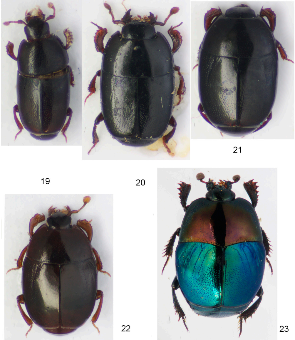
Figures 19-23. Papuan Histeridae, habitus, dorsal view. 19 – Platylomalus musicus (MARSEUL), specimen from S Halmahera Is., Tilope vill. env.; 20 – Platylomalus oceanitis (MARSEUL), specimen from New Guinea, Triton Bay; 21 – Eulomalus pradali (MARSEUL), specimen from New Guinea, Triton Bay; 22 – Eulomalus amplipes COOMAN, specimen from New Guinea, Onin Perninsula; 23 – Saprinus cyaneus cyaneus (FABRICIUS), specimen from S New Guinea, Merauke env.