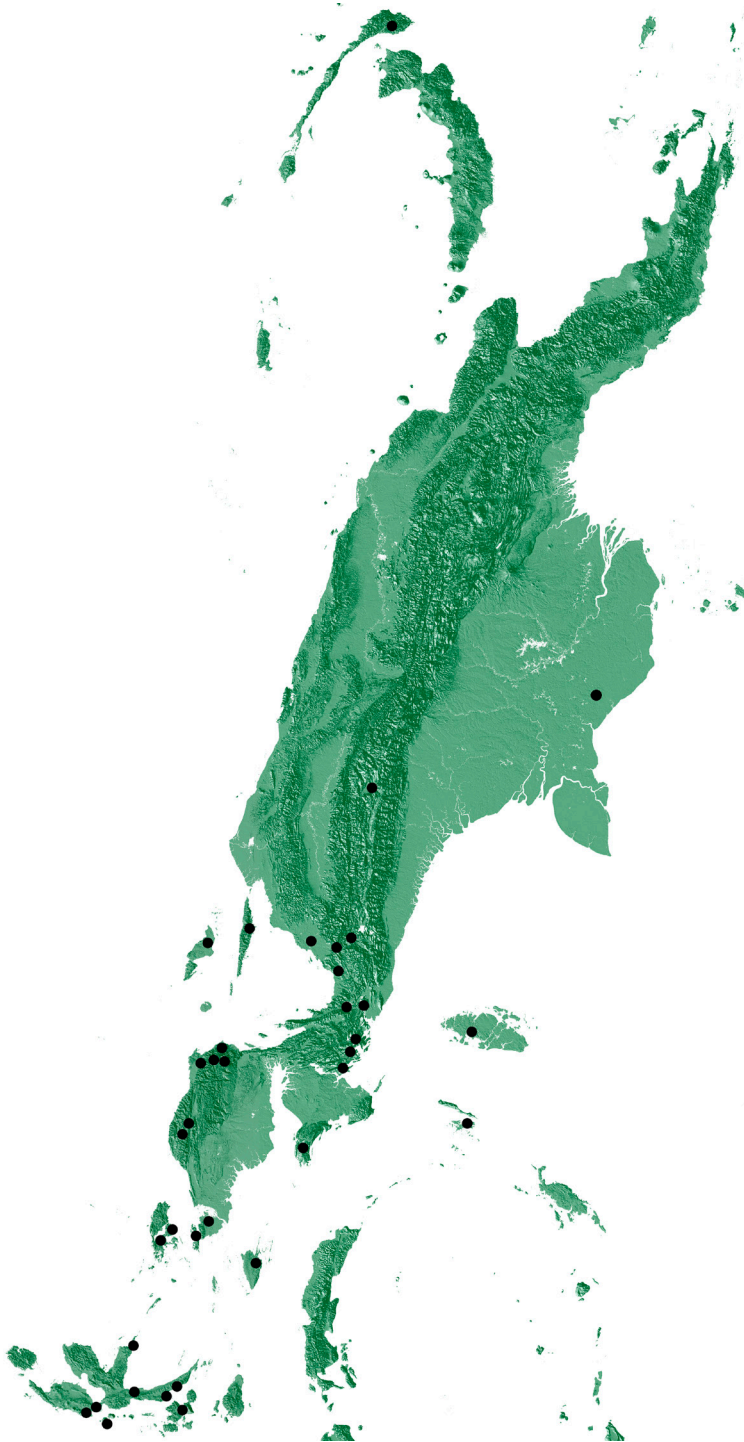
Map 2. Schematic map of sampling localities in the Papuan region. Each black dot represent one or several closely located sampling spots (for sampling locations see geographic coordinates in species list). Consider prevalence of sampling localities in the western part of the region. Map is prepared with ArcGIS 9.0.