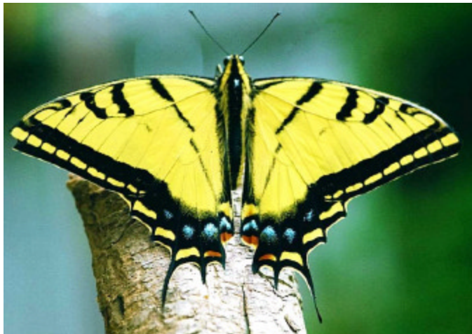
Fig. 14. Papilio multicaudatus