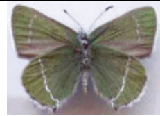
Fig. 11. C. sheridanii