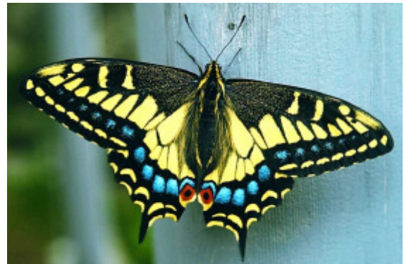
Fig. 15. Papilio zelicaon