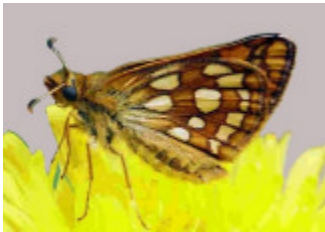
Fig. 9. Carterocephalus palaemon