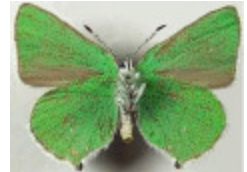
Fig. 12. C. affinis