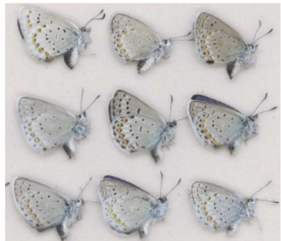
Fig. 17. Plebejus anna atrapraetextus and P. anna phenotypes from Shorts Creek canyon.

Figs. 8-10 and 13-15 photos by C. Guppy. Figs. 11-12 photos and 16-17 scan by N. Kondla.