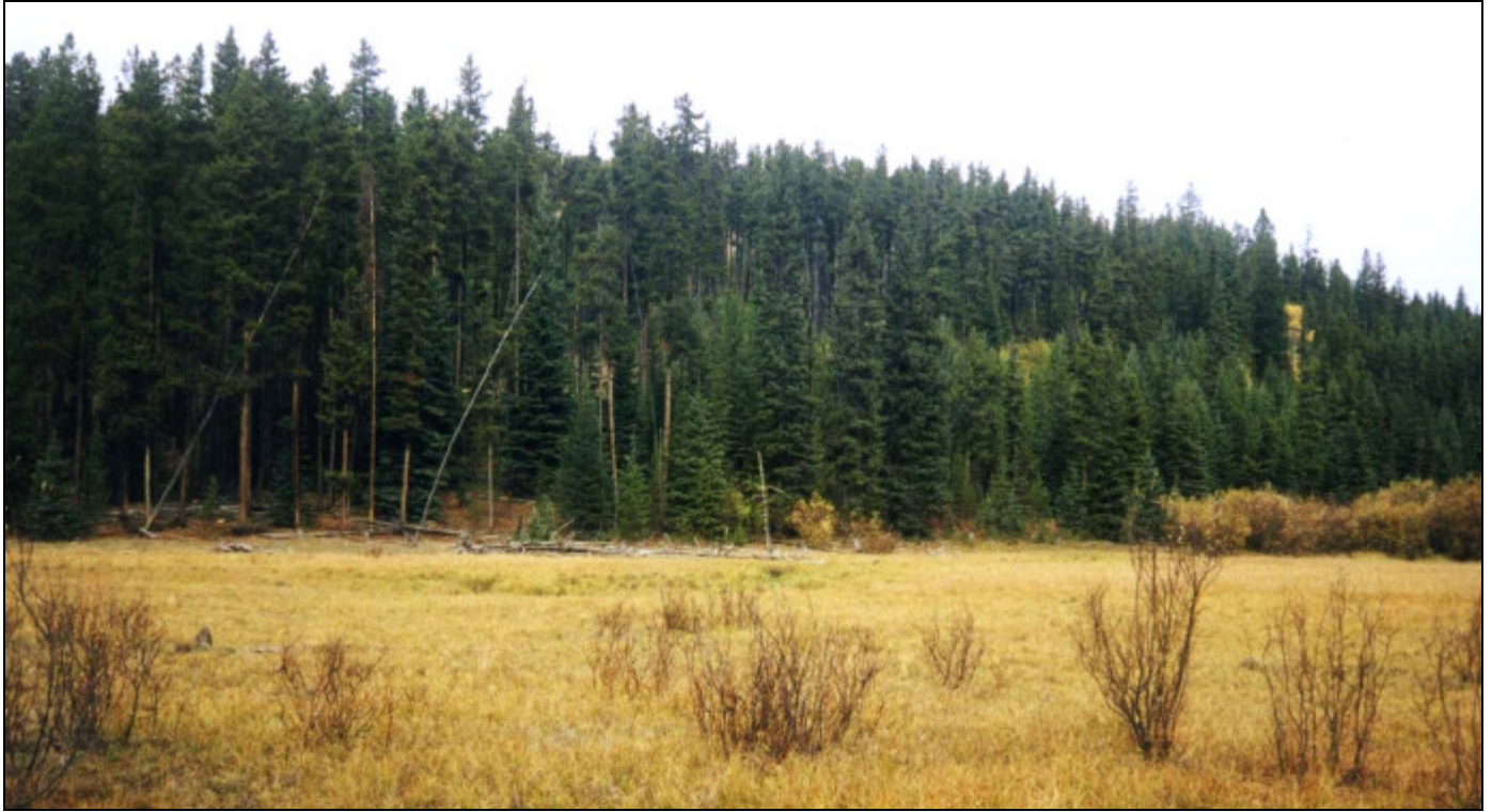
Figure 6. King Edward Lake area with a fen in the foreground and typical forest habitat in the background.