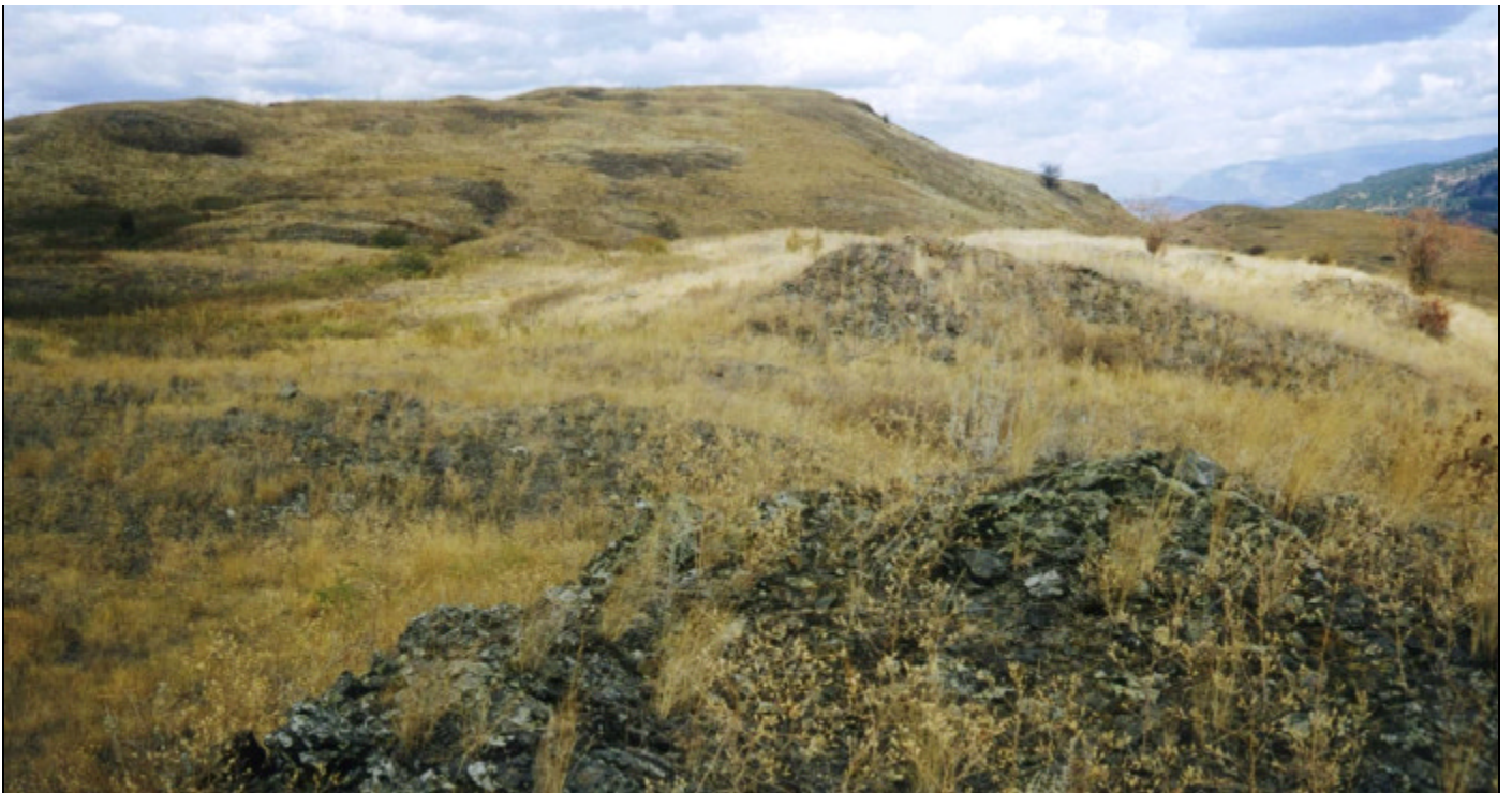
Figure 3. Goose Lake area just northwest of Vernon. Moderate elevation open grassland and rock outcrop habitat.