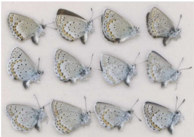
Fig. 16. Plebejus anna mostly atrapraetextus phenotypes. These and Fig. 17 specimens Leg. Threatful.