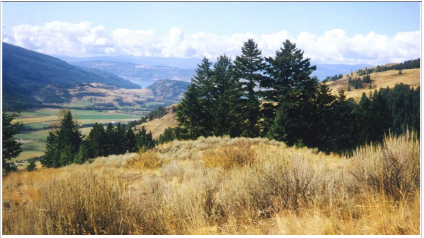
Figure 2. View from Vernon Hill looking southwest towards Kalamalka Lake.