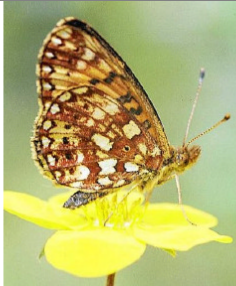
Fig. 10. Boloria myrina