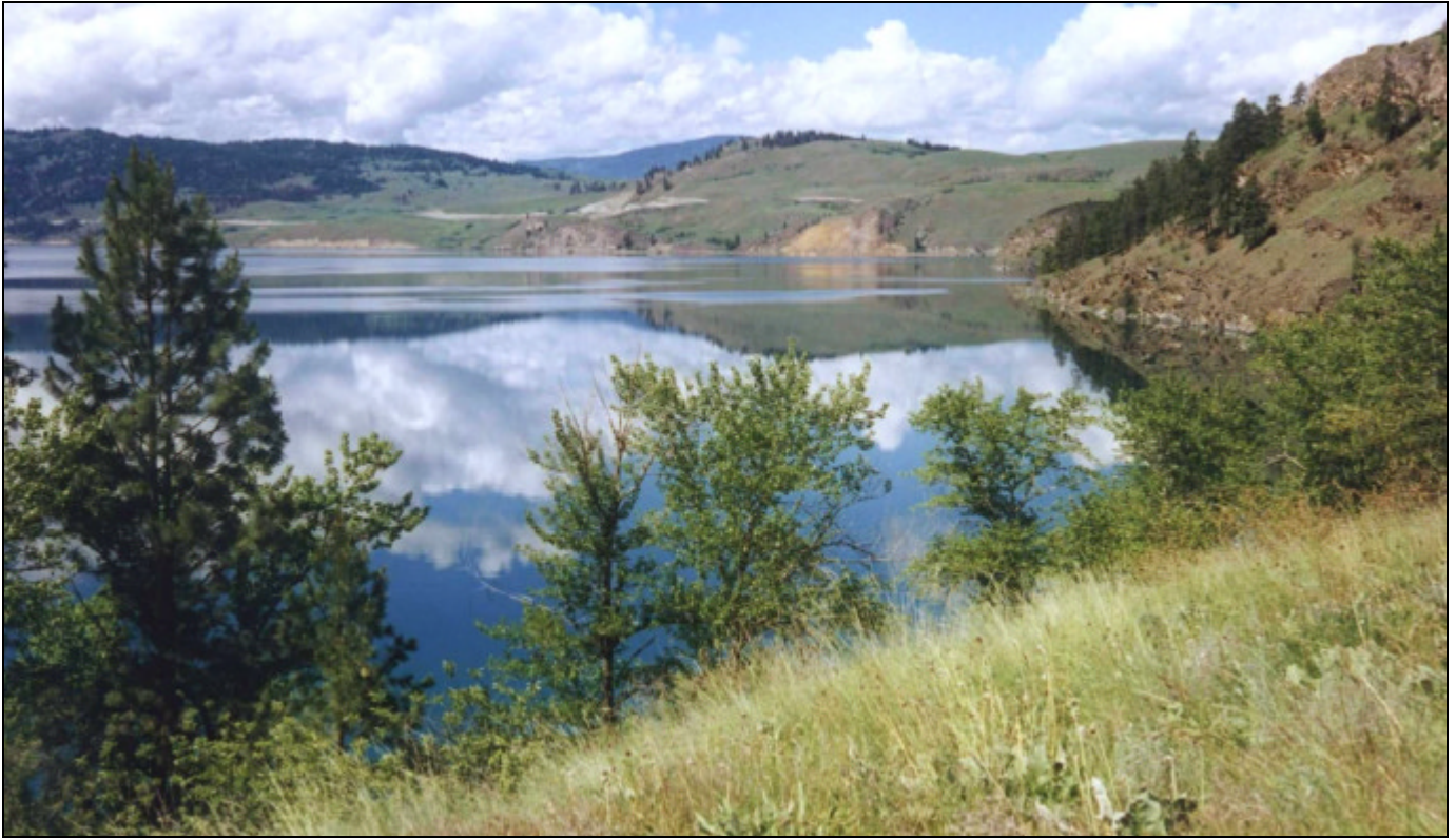
Figure 4. Kalamalka Lake Provincial Park.