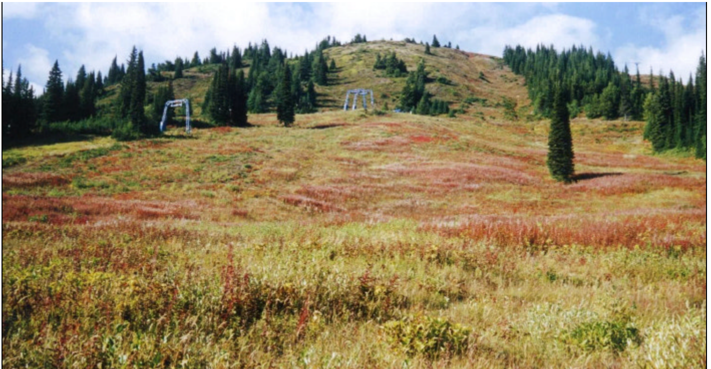
Figure 7. Ski hill clearing on Silver Star Mountain with adjacent subalpine forest.