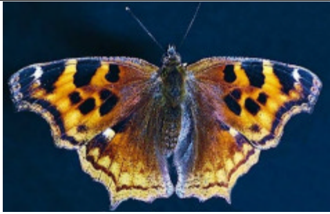
Fig. 8. Polygonia l-album