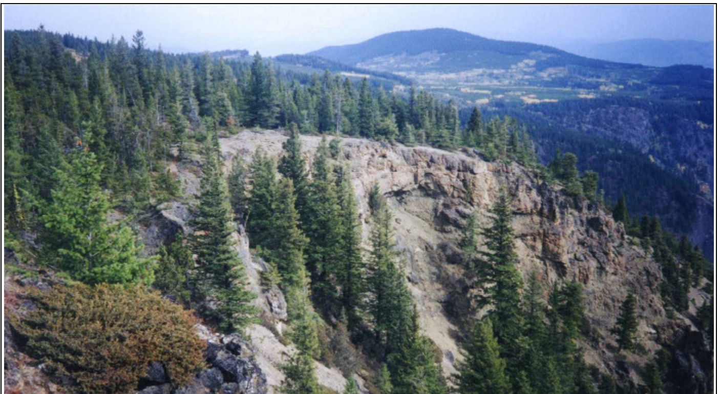
Figure 5. Shorts Creek canyon, north rim looking towards the northeast.