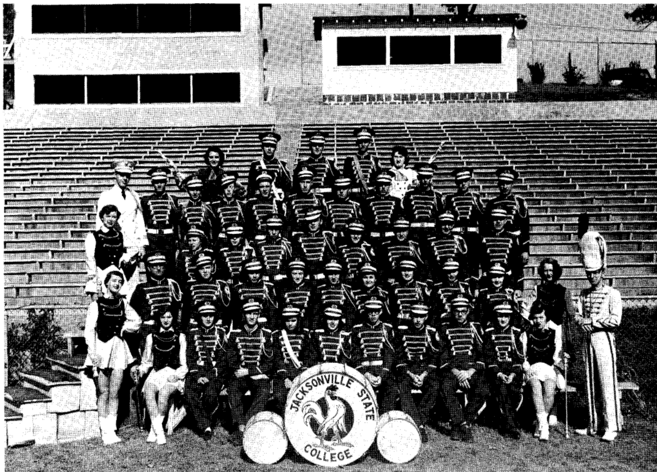
The Jacksonville State College band, 1952. The stadium and the band have changed over the years.

These funds were handled by the Scholarships and