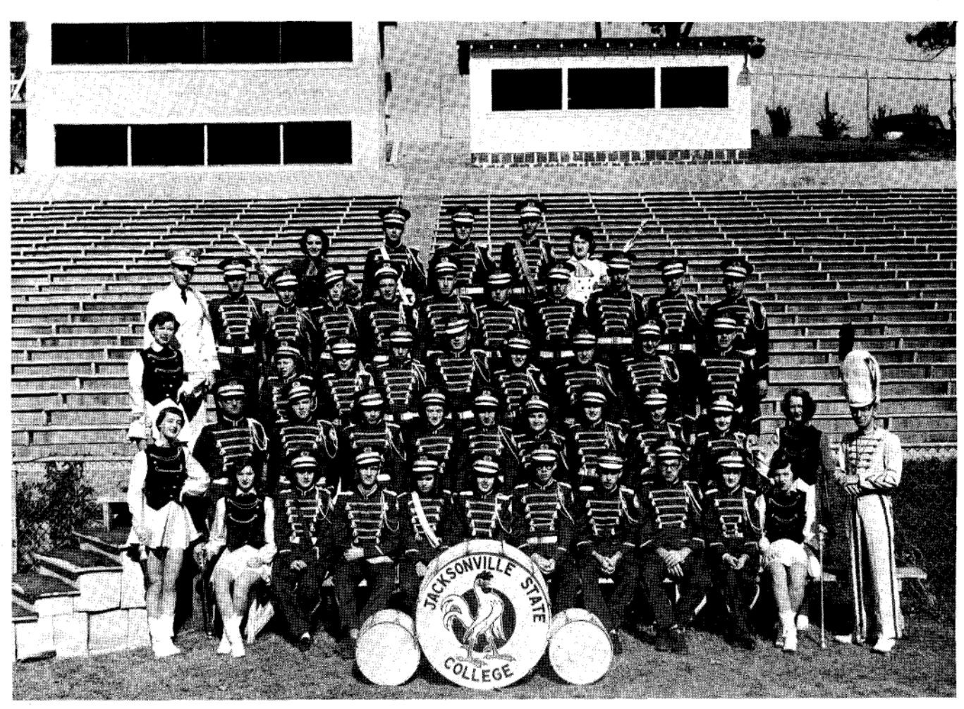
The Jacksonville State College band, 1952. The stadium and the band have changed over the years.

These funds were handled by the Scholarships and