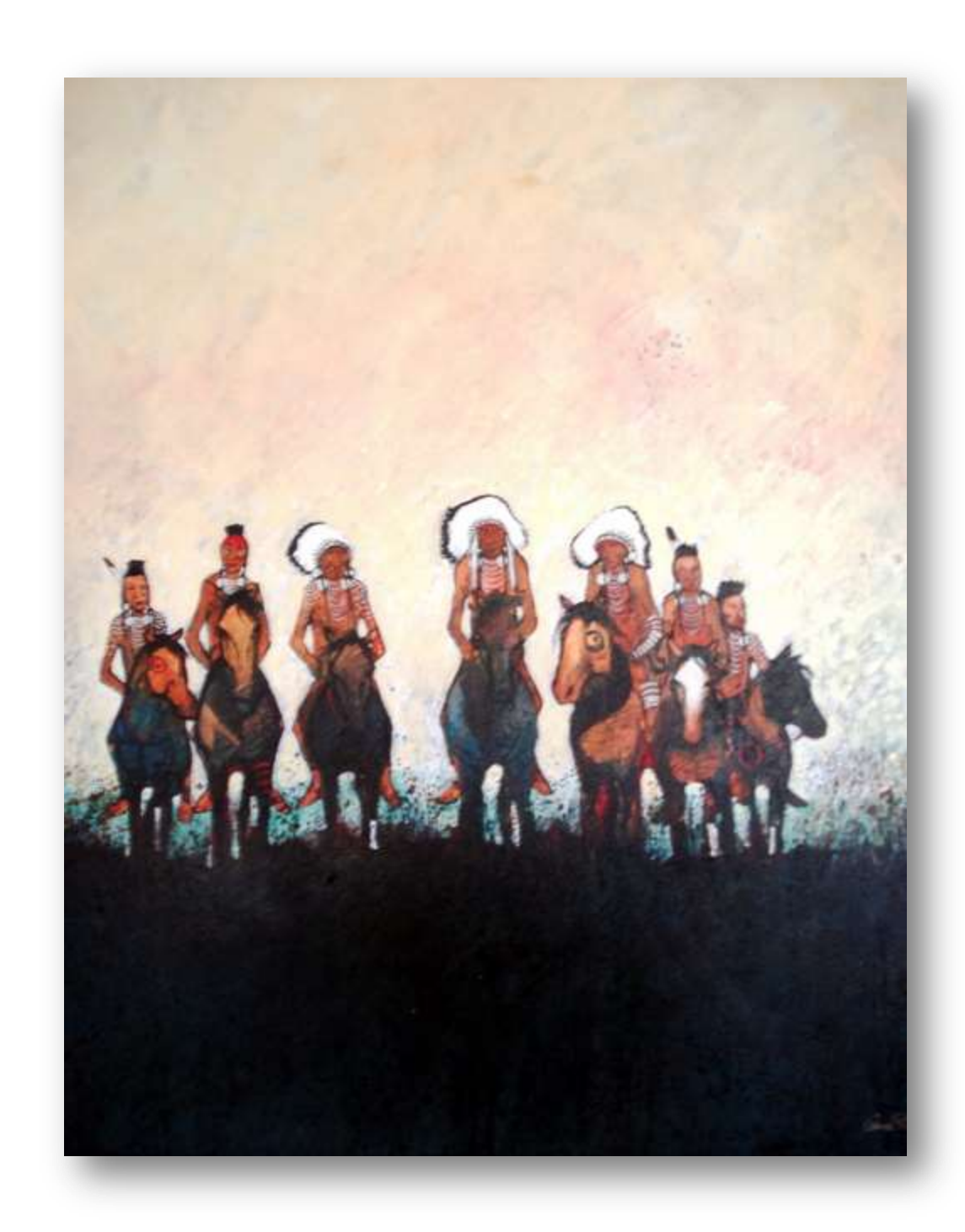
LITTLE BIG HORN COLLEGE