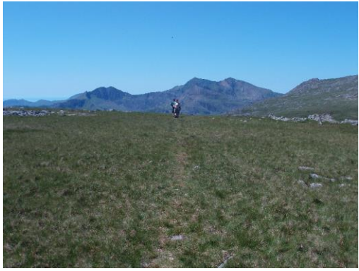
Views south-west to the Snowdon massif