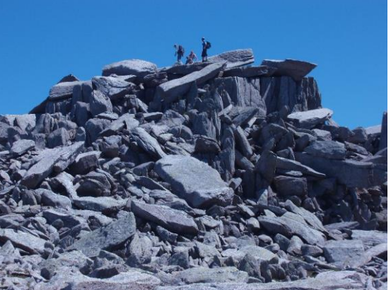
Scramble over the 'Castle of the Winds', Glyder Fach