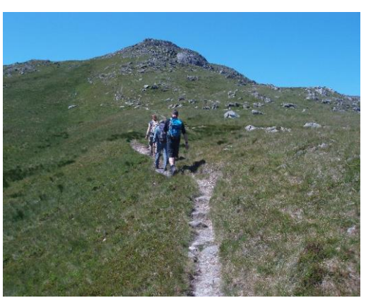
Approaching Y Foel Goch

The going became gradually more of a pull up on to the minor top of Y Foel Goch, followed soon after by the long, steep eastern flank of Glyder Fach. Dramatic views of Tryfan with its Heather Terrace to the right can be enjoyed during the climb, before topping out on to the extensive loose, flat rocky top. Once the top plateaux has been gained, the mood becomes more relaxed as the local features are examined; an obligatory gravity-defying photo on the Cantilever stone; a scramble over the 'Castle of the Winds'; finally a leisurely amble to the highest point of Glyder Fawr. There then follows a rather unpleasant long, steep, loose and dusty decent to the water of Llyn y Cwn, compensated for by extensive views of the line of hills stretching ahead. There followed a welcome respite at the Llyn in the building midday heat. Needing no encouragement, Ron and Hanna soon plunged into and swam in the cool waters of the placid lake, which sit in a high col above the Devil's Kitchen, above Cym Idwal.