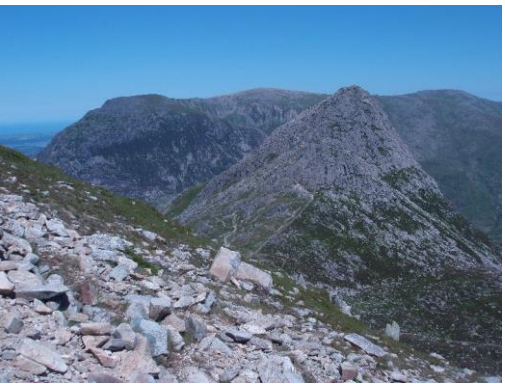
Looking north to Tryfan, Carneddau beyond