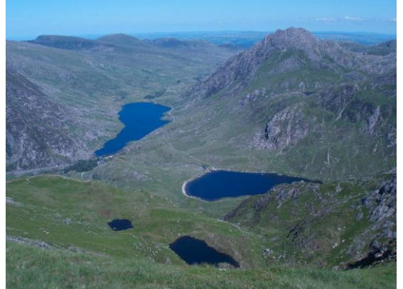
View down to Llyn Idwal and Llyn Ogwen, from Y Garn.