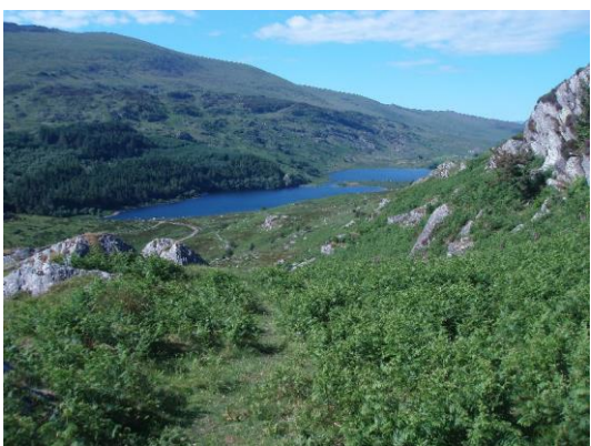
View towards Llynnau Mymbyr

On this particular morning, conditions could hardly have looked more promising as the four of us left the car at the rear of Joe Brown's shop at Capel and headed up the rocky ridge end of Cefn y Capel with improving views of the twin lakes of Llynnau Mymbyr, then westerly, by the gently ascending grassy slopes of Bwlch Goleuni with fine vistas in the clear morning air, south-west towards the Snowdon massif and the skyline ridge of Crib Goch.