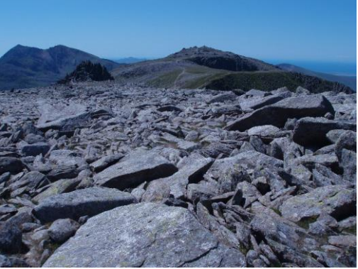
Glyder plateaux – looking west towards Glyder Fawr

After leisurely refreshments we were on our way again, ascending steeply the slopes of Y Garn in fierce sun. We soon topped out and were enjoying the extensive panorama down into Idwal and Nant Ffrancon. Then follows a drop down to a further col and a further climb onto Foel goch, which may be avoided via a traverse path across its western slopes. Dropping steeply to the next col, alternative routes forward are presented; you could continue north-west over Mynydd Perfedd and Carnedd y Filliast, then descend to the upper power station lake of Marchlyn Mawr. We chose the more sporting line, swinging west to ascend Elidir Fawr (the closest high mountain to the Hut). From its rough rocky summit ridge we picked out the small path that descends to the much lower Elidir Fach where we encountered a goat herd and atmospheric sunset views across the Menai Strait to the Isle of Anglesey.