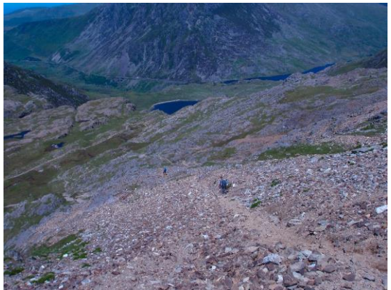
Steep, loose descent from Glyder Fawr