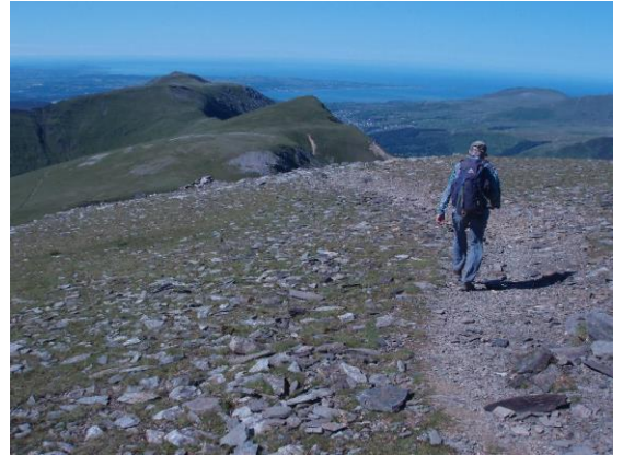
Heading north from Y Garn towards Foel Goch