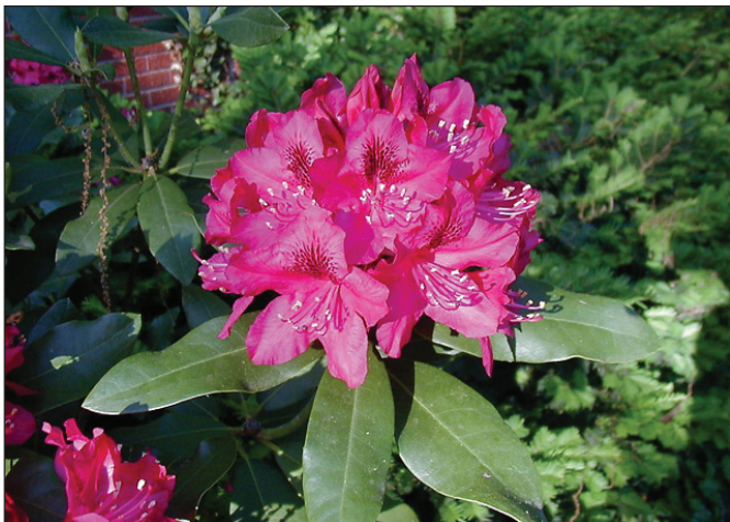
Figure 3. Rhododendron variety Nova Zembla in bloom.

There are many beautiful rhododendrons. However, some are not reliably cold hardy or heat tolerant in our area. In general, more varieties may be grown in the milder climate of southern Missouri. The following selected varieties are some of the most reliable, although not always the most beautiful.