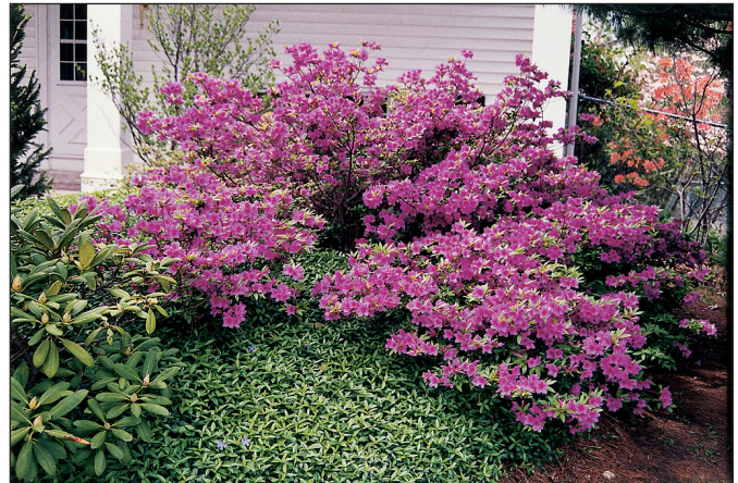
Figure 1. Azaleas and rhododendrons have many landscape uses. Shown here are azalea variety Herbert in full bloom along with the large foliage of rhododendron Roseum Elegans in lower left.

Shade. Many people think of azaleas and rhododendrons as shade lovers. Yet dense shade is not satisfactory. Filtered sunlight is ideal, but morning sunlight with shade after