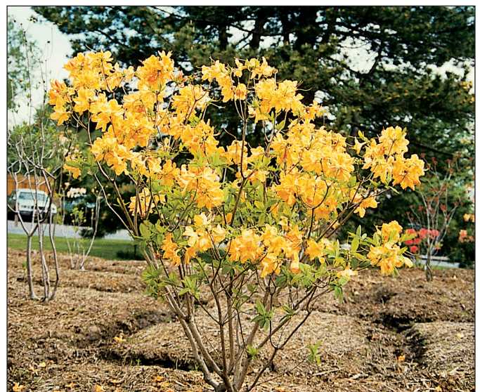
Figure 5. Deciduous azaleas drop all their leaves in winter and flower before leaves fully develop. Unlike the evergreen varieties, they can be found in orange and yellow.

In areas where the evergreen azaleas are marginal, deciduous azaleas might best be selected (Figure 5). They are more cold hardy and provide a mass of color in spring. Different species vary widely in hardiness, however. Those normally found in nurseries will normally be the ones best suited to the area. Remember that there are no bargains in azaleas and rhododendrons. Choose only vigorous plants of good varieties. Beginners should choose some of the old standards and later try some of the newer introductions. Deciduous azalea varieties are as follows.