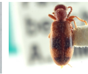
CNC COLEO 00252245 [Dorsal] Anthicus cervinus BIN URI: BOLD:AAH2753