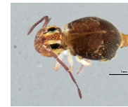
TDWG-0539 [Dorsal] Bourlettiellidae BIN URI: BOLD:AAAN4907