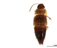
BIOUG25606-G12 [Dorsal] Tachyporus BIN URI: BOLD:AAM9619