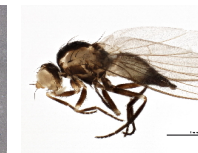
BIOUG04140-D12 [Lateral] Agromyzidae BIN URI: BOLD:AAU9505