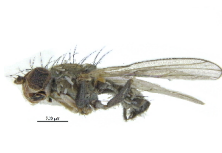
BIOUG24833-G06 [Lateral] Pelomyia occidentalis BIN URI: BOLD:ABA8614