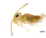
BIOUG02130-H02 [Lateral] Bourlettiella BIN URI: BOLD:ACV5609