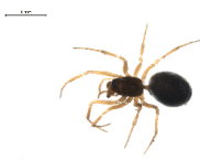
BIOUG02782-G05 [Dorsal] Erigone alertris BIN URI: BOLD:AAD1746