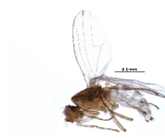
BIOUG06710-C11 [Lateral] Drosophila BIN URI: BOLD:ACI7818