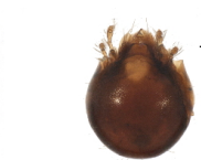
BIOUG31110-G07 [Dorsal] Trichoribates BIN URI: BOLD:ADE0783