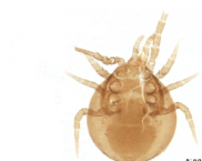
BIOUG16112-A11 [Dorsal] Phytoseiidae BIN URI: BOLD:ACP9397