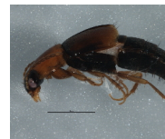
BIOUG05509-G10 [Lateral] Tachyporus BIN URI: BOLD:AAAN9511