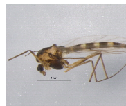
BIOUG05515-B03 [Lateral] Chironomus maturus BIN URI: BOLD:AAB4657