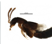
BIOUG25584-C07 [Lateral] Staphylinidae BIN URI: BOLD:ACX9078