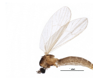
BIOUG25568-H01 [Lateral] Cheilotrichia cinerascens BIN URI: BOLD:ABV4106