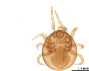
BIOUG25629-A01 [Dorsal] Phytoseiidae BIN URI: BOLD:ACY2204