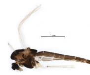
BIOUG22467-G05 [Lateral] Phaenopsectra BIN URI: BOLD:AAM6287