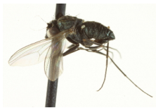
CNC DIPTERA 163654 [Lateral] Medetera sp. SEB5 BIN URI: BOLD:ACA1124