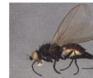
BIOUG16116-A02 [Lateral] Chromatomyia BIN URI: BOLD:ACP9372