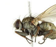
CCDB-12827-H07 [Lateral] Coenosia tigrina BIN URI: BOLD:AAB5609