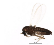
BIOUG01337-H06 [Lateral] Smittia BIN URI: BOLD:AAG1019