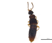
BIOUG16044-A01 [Dorsal] Amischa decipiens BIN URI: BOLD:ABA6362