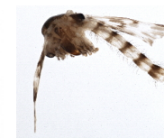
BIOUG05644-A07 [Lateral] Psectrotanypus sp. ES01 BIN URI: BOLD:AAG0314