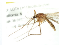
BIOUG01818-A04 [Lateral] Culiseta inornata BIN URI: BOLD:AAC9132