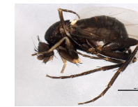
BIOUG01459-D09 [Lateral] Conicera BIN URI: BOLD:AAG3236