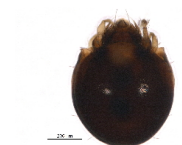
BIOUG11770-E05 [Dorsal] Trichoribates BIN URI: BOLD:ACL2370