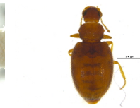
BIOUG03515-C08 [Dorsal] Melanophthalma BIN URI: BOLD:AAP7026