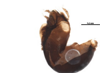
BIOUG22049-B03 [Dorsal] Ceratozetidae BIN URI: BOLD:ACU5511