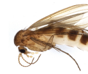
BIOUG06564-C11 [Lateral] Mycetophila BIN URI: BOLD:ACJ0451