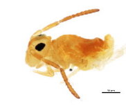
BIOUG04016-H04 [Lateral] Bourlettiella BIN URI: BOLD:ACC0359