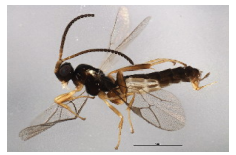
ASGLE-0285 [Lateral] Hymenoptera BIN URI: BOLD:AAP6689