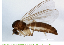
BIOUG05931-H01 [Lateral] Mycetophiliidae BIN URI: BOLD:ACG5774