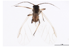
NIBGE APH-00163 [Dorsal] Rhopalosiphum padi BIN URI: BOLD:AAA9899