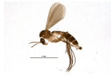
BIOUG04859-H07 [Lateral] Exechia BIN URI: BOLD:AAQ3544

Thricops albasalis BIN URI: BOLD:AAD2373