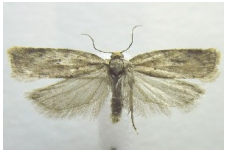
MDH000895 [Dorsal] Acleris semiannula BIN URI: BOLD:AAB4304