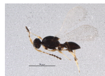
BIOUG06549-D04 [Lateral] Platygastriinae BIN URI: BOLD:ACI7747