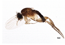
BIOUG02979-G05 [Lateral] Megaselia BIN URI: BOLD:AAN8679