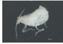
10BBCHEM-0562 [Lateral] Chaitophorus stvensis BIN URI: BOLD:AAH2877