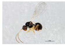
10BBCHY-0237 [Lateral] Charipinae BIN URI: BOLD:AAR5718