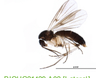
BIOUG21429-A02 [Lateral] Mycetophilinae BIN URI: BOLD:AAM8992