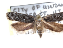
CCDB-24283-G09 [Dorsal] Anacamptis niveopulvella BIN URI: BOLD:AAC2309