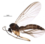
BIOUG20435-C01 [Lateral] Boletina BIN URI: BOLD:ABA3065