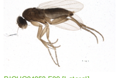
BIOUG04053-F09 [Lateral] Megaselia variana BIN URI: BOLD:AAZ6701