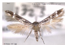
NorBOL LepVM135 [Dorsal] Mompha stumppennella BIN URI: BOLD:AAD0701