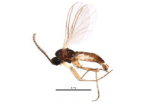
BIOUG01915-F08 [Lateral] Sciaridae BIN URI: BOLD:AAM9235