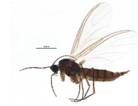
BIOUG09014-C05 [Lateral] Lycoriella BIN URI: BOLD:AAL7874