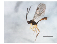
BIOUG04528-A11 [Lateral] Plectiscidea BIN URI: BOLD:ACF8995