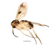
BIOUG01402-G02 [Lateral] Mycetophiliidae BIN URI: BOLD:AAG4931

Thricops albasalis BIN URI: BOLD:AAD2373