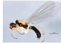
10BBCDIP-1425 [Lateral] Psilidae BIN URI: BOLD:AAP7687