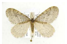
CNLEP00082494 [Dorsal] Operophtera bruceata BIN URI: BOLD:AAA2999