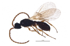
BIOUG09342-A01 [Lateral] Diapriidae BIN URI: BOLD:ACL1455