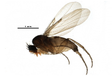
BIOUG26490-B10 [Lateral] Megaselia BIN URI: BOLD:ACZ4279