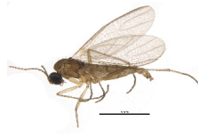
BIOUG18754-C10 [Lateral] Sciaridae BIN URI: BOLD:ACS8037