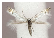
CNLEP00029461 [Dorsal] Phyllocnistis sp. BIN URI: BOLD:AAF6337