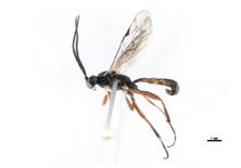
07PROBE-23705 [Lateral] Cryptinae BIN URI: BOLD:AAD0970