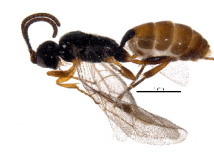
BIOUG31140-F11 [Lateral] Cryptinae BIN URI: BOLD:ADE1169