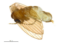
BIOUG14582-B09 [Lateral] Psychodidae BIN URI: BOLD:AAF9320