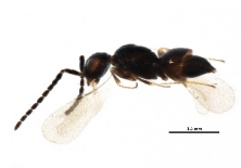
BIOUG21320-C07 [Lateral] Megaspilidae BIN URI: BOLD:ACV0580