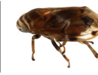
BIOUG00901-D02 [Lateral] Clastoptera obtusa BIN URI: BOLD:AAG8823