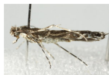
10BBCLP-2125 [Lateral] Micruarpteryx salicifoliella BIN URI: BOLD:AAD5801