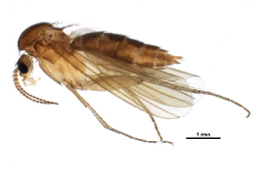
BIOUG05324-C03 [Lateral] Mycetophila BIN URI: BOLD:AAG4872

Lisopcephala erythrocerca BIN URI: BOLD:AAG1704