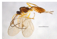
BIOUG04737-D08 [Lateral] Orthocentrinae BIN URI: BOLD:ACE1273