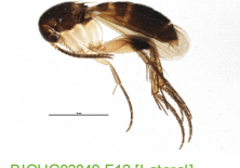
BIOUG03849-F12 [Lateral] Sceptonia BIN URI: BOLD:ABV3032