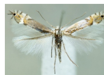
MM25284 [Dorsal] Phyllocnistis labyrinthella BIN URI: BOLD:ACX5473