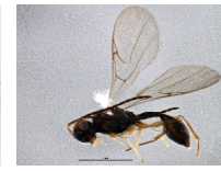
BIOUG04659-H06 [Lateral] Diapriidae BIN URI: BOLD:ACD0542