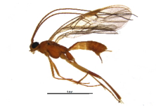
BIOUG06887-H04 [Lateral] Homolobus BIN URI: BOLD:ACI8851