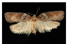
CGWC-3911 [Dorsal] Acleris celiaria BIN URI: BOLD:AAB6218