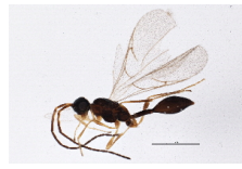
BIOUG03621-E11 [Lateral] Diapriidae BIN URI: BOLD:ACC5658