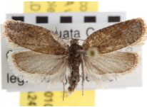
CNCLEP00101768 [Dorsal] Acleris minuta BIN URI: BOLD:AAE3758