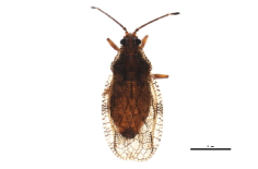
BIOUG00906-D08 [Dorsal] Physatocheila variegata BIN URI: BOLD:ACD0489