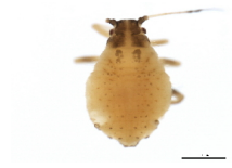
BIOUG00947-F08 [Dorsal] Chaitophorus neglectus BIN URI: BOLD:AAB4394