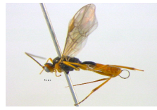
BIOUG04267-H01 [Lateral] Meteorus ictericus BIN URI: BOLD:AAZ6797