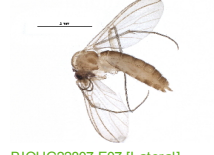
BIOUG22807-E07 [Lateral] Mycomya affinis BIN URI: BOLD:AAH3524