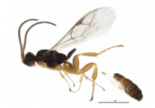
10PHMAL-3230 [Lateral] Orthocentrus BIN URI: BOLD:AAU8218