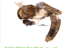
BIOUG31140-H02 [Lateral] Mycetophiliidae BIN URI: BOLD:ADE3338