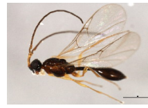
10BBCHY-2266 [Lateral] Diapriidae BIN URI: BOLD:ABX5571