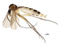
BIOUG05228-E11 [Lateral] Alodia BIN URI: BOLD:AAG4936