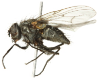
10BBCDIP-2971 [Lateral] Helina annosa BIN URI: BOLD:AAK4683