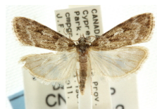
CNLEP00087632 [Dorsal] Scoparia biplagiialis BIN URI: BOLD:AAA1518