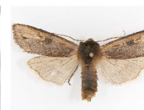
CGWC-4120 [Dorsal] Xylena cineritia BIN URI: BOLD:ABZ7519