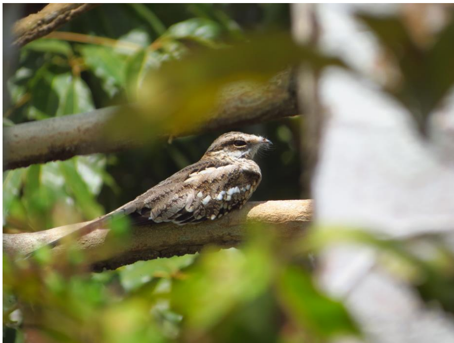
Ladder-tailed Nightjar

We had the Manaus tour in the afternoon and group from Prescott headed to the airport.