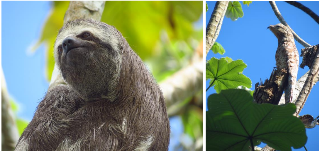
Three-toed Sloth and Great Potoo

We encountered a Black-tailed Trogon, several Hoatzins, Zimmer's, Straightbilled and Striped Woodcreepers, and a nest of Wattled Jacanas.