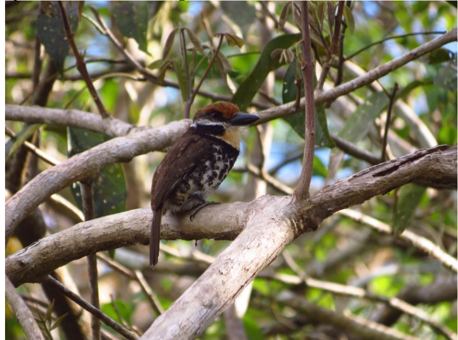
Spotted Puffbird (photo by MR)

Little Woodpecker (photo by MR) In the afternoon we canoed around Lago Arrozal and had stunning views of Spotted Puffbird. That night, we sailed to the Rio Amazonas.