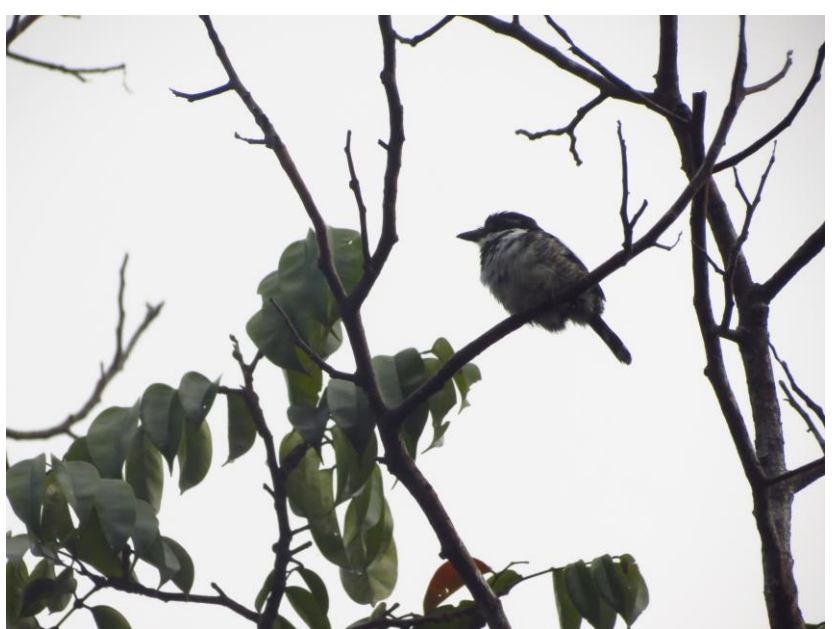
Pied Puffbird

Rosi and Edicarlos chopped through a fallen tree so we could continue up the igarape.