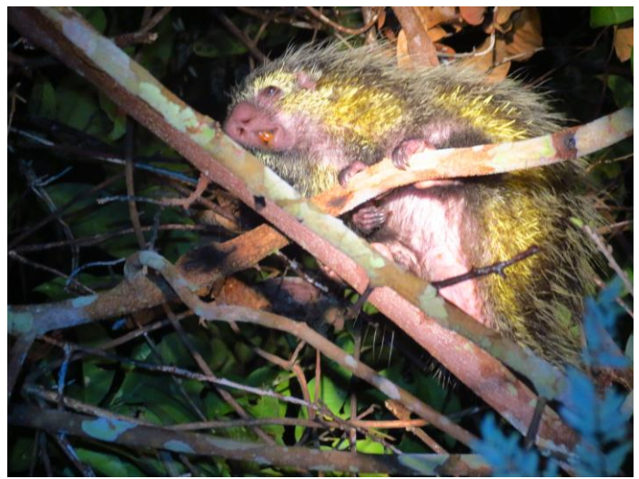
Black-tailed Hairy Dwarf Porcupine

15 May- We went up the Rio Cuieiras to look for the Zigzag Heron nest. We got to see loads of Dusky Parrots, a few Red Fan Parrots, Spangled Cotingas and Red Howler Monkeys in the early morning. We encountered some feeding flocks along the way with Chestnut-rumped Woodcreeper, Black-eared Fairy, Cinereous Antshrike and Wing-barred Piprites. We also had great looks at Green-and-rufous Kingfisher and some Cream-colored Woodpeckers responding to our whistle.