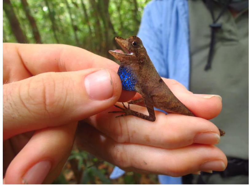
Blue-lipped Forest Anole Anolis bombiceps

After watching the swarm, we walked the trail and saw a Zimmer's Tody-tyrant. We also caught a Blue-lipped Forest Anole.