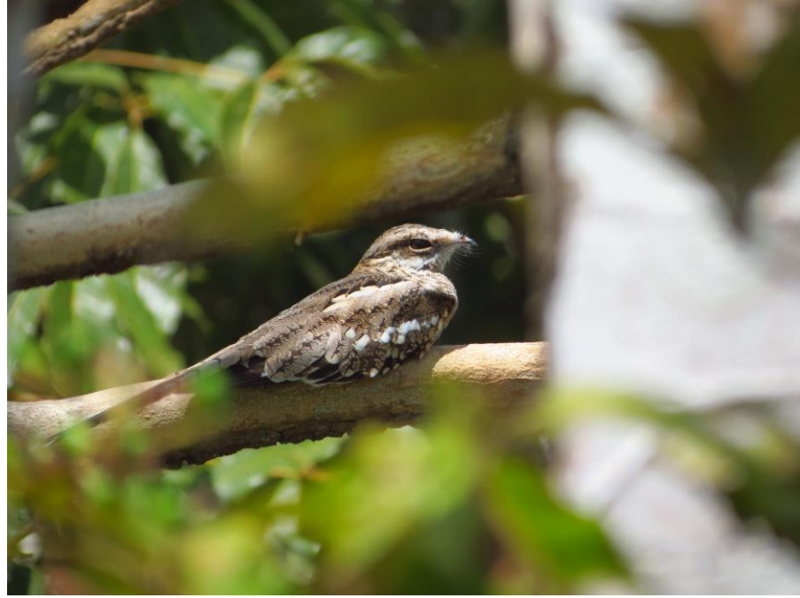
Ladder-tailed Nightjar

We had the Manaus tour in the afternoon and group from Prescott headed to the airport.