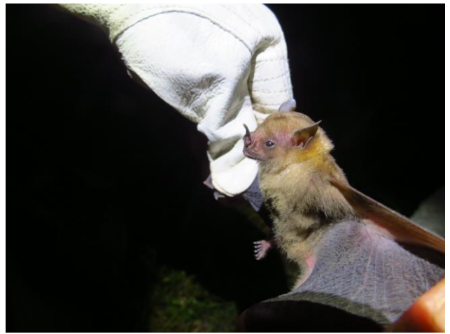
Yellow-shouldered Bat

In the afternoon we explored the Varzea on left bank Abacaxis. We found some Blackish Antbirds, Green-rumped Parrotlets, and Green-tailed Jacamars.