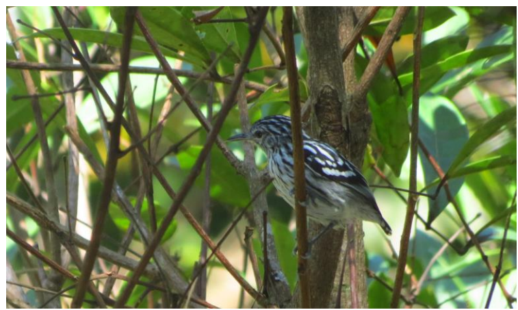
Amazonian Streaked Antwren

22 May- In the morning we explored the várzea along the Parana Araria close to the city of Maues. Highlights were Amazonian Black Tyrant, Amazonian Streaked Antwren, and Klages's Antwren.