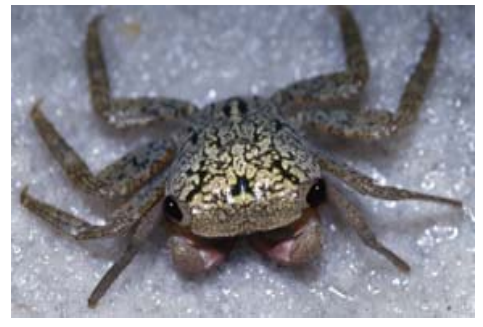
Mangrove Tree Crab Aratus pisonii Brown or black with mottling & spots