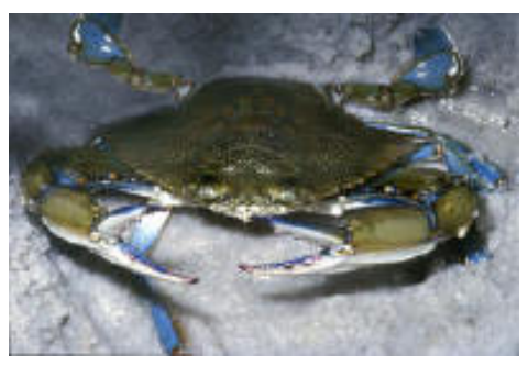
Blue Crab Callinectes sapidus Greenish body with blue claws & legs