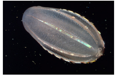
Comb Jelly Mnemiopsis sp. Clear with rows of sparkling lines