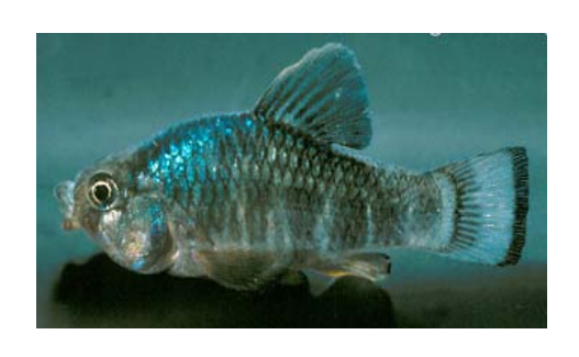
Sheepshead Minnow (male L, female R) Cyprinodon variegates Dark stripes and dark eye stripe

Female: Black spot on dorsal fin Male: Black band on tail, blue on head and back when breeding