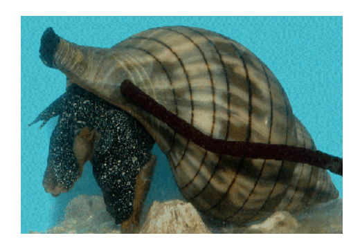
Banded Tulip Fasciolaria hunteria Shell tan with dark spiral lines & blotches