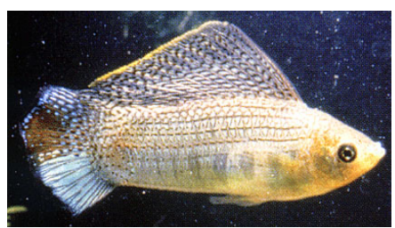
Sailfin Molly (male) Poecilia latipinna Sail-like fin, orange, orange/blue tail