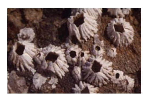
Barnacle Gray or white hard outer shell

Manatee County Natural Resources Department U.S. E.P.A - Gulf of Mexico Program Tampa Bay Estuary Program