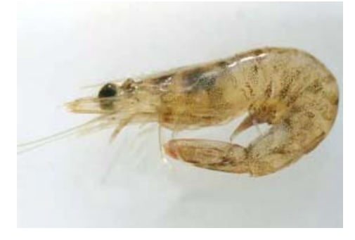
Pink Shrimp Penaeus duorarum Pinkish or orange tint to body