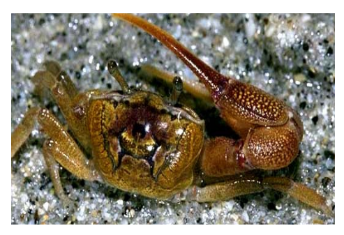
Fiddler Crab (Male) Uca sp. Red, brown, gray, pink to purple