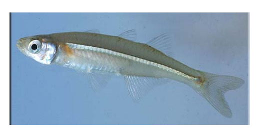
Tidewater Silverside Menidia peninsulae Greenish-yellow above, silver body stripe