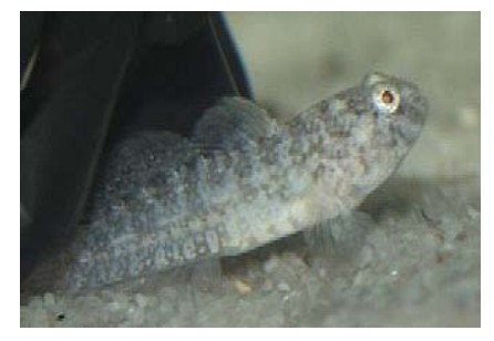
Code Goby Gobiosoma robustum Eyes near top of head, brown/white