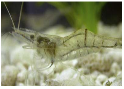
Grass Shrimp Palaemonenetes sp. Small & nearly transparent