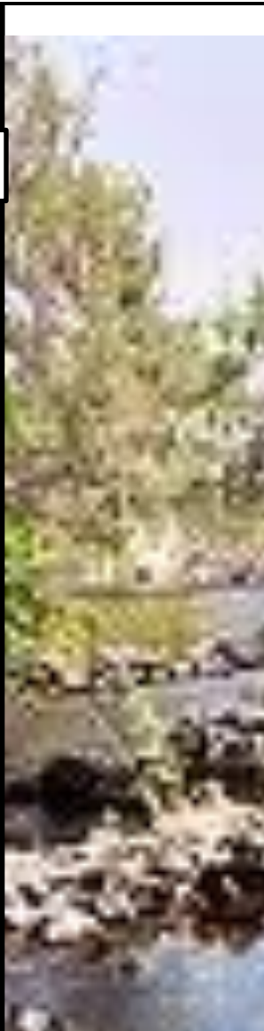
ACHLIMAWI ALSO FISH HERE IT'S CALLED THE RAT FARM ROAD