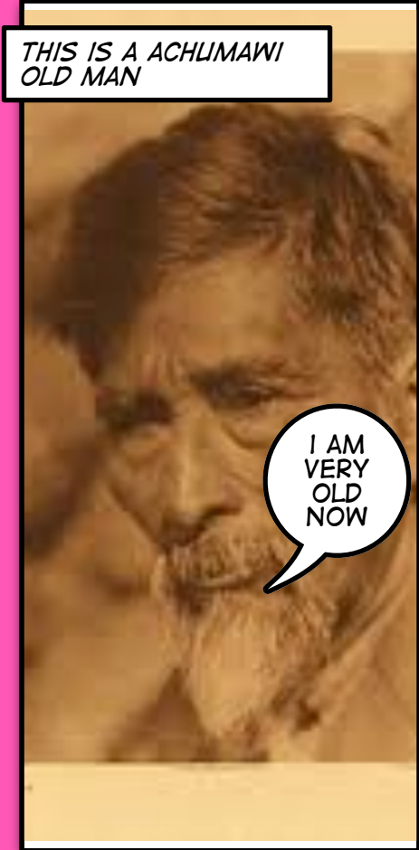
THIS IS A ACHUMAWI OLD MAN