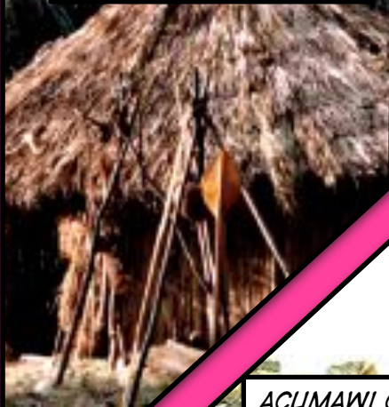
THIS IS A ACHUMAWI HOUSE