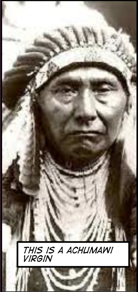
THIS IS A ACHUMAWI VIRGIN