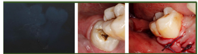
Figure 3 A: Long cone Periapical of mesioangular impacted LR8; B: Mesioangular LR8 in situ pre-operatively; C: Mucoperiosteal flap replaced following surgical removal of LR8. Mesial relieving incision closed with simple interrupted sutures and surgical and cross-mattress suturing of LR8 socket.