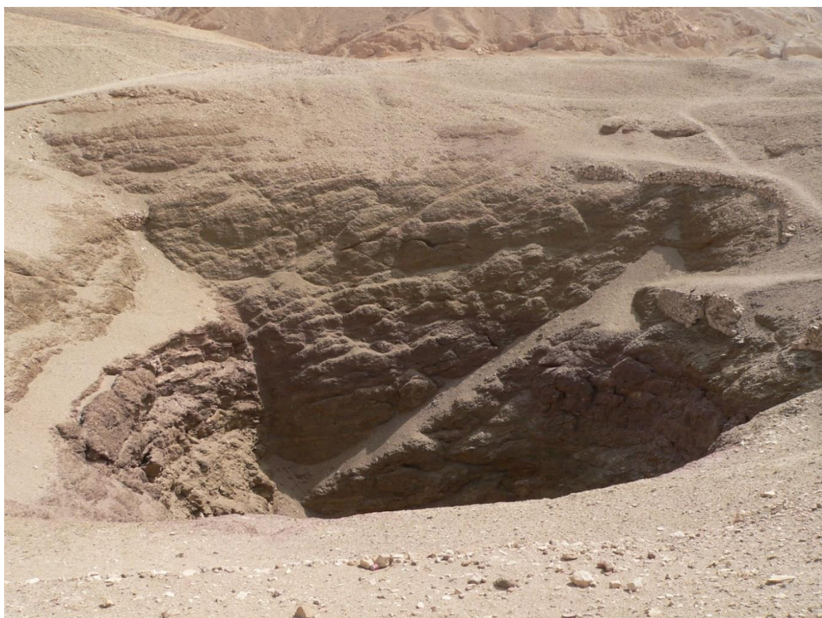
Figure 4, The Great Pit at Deir el-Medina, Photo: Troels Myrup/Creative Commons

But looking at the same two sources, and the original excavation notes by Bruyère, Driaux (2011: 130-141) draws a completely different conclusion. She supports Ventura's conclusion that the two documents describe the Great Pit, but believes the well-diggers did strike water. She points to a Coptic period well close by, dug to a depth of 55 meters, which reached moisture. She also takes up the notebook entry from Bruyère (who, as mentioned above, believed the pit was Ptolemaic) that he did in fact find abundant water when he reached the limestone at the bottom of the pit, something she says was not included in his published report. She says the construction of the Great Pit is very similar to that of the well at Q48.4 near the Amarna village. However, she concludes that we do not know if the quantity of water found would have been sufficient for the local population.