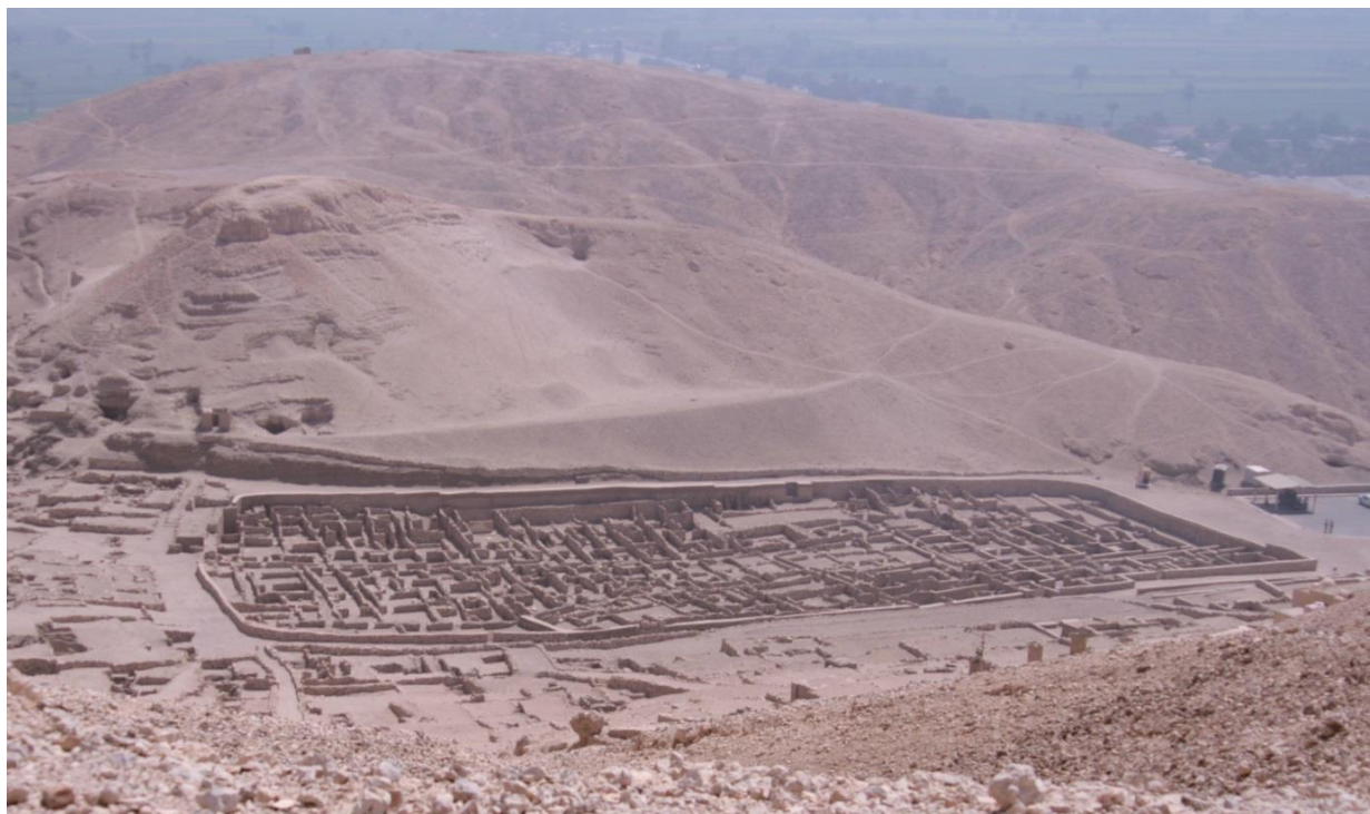
Figure 1, Deir el-Medina, Photo: Steve F-E-Cameron/Creative Commons

The workers who built the tombs in the Valley of the Kings lived for many generations with their families in a village that today we call Deir el-Medina ( Figure 1 ). During the Egyptian New Kingdom, it was called ‘St M3’t’, ‘The Place of Truth’ (Peters 2001: 356). The original village seems to have been abandoned under Akhenaten, when the royal tombs were built near his new capital of Amarna, farther north (Häggman 2002: 60). However, with the end of the Amarna period and the return of the kings to Thebes, the village was reestablished, apparently under Horemheb (Demaree, 2016: 75-77).