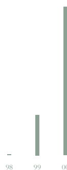
EBITDA (in millions)