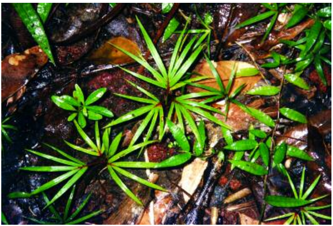
16. Young plants under forest canopy, at the foot of an adult specimen of Acanthophoenix rubra in the Jardin des Epices in Saint-Philippe.

exotic birds in Réunion, seed dispersal of A . rubra is quite limited.