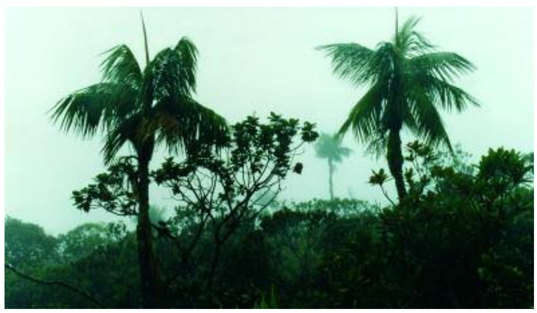
18. A wild population of Acanthophoenix crinita in Hauts de Bois Blanc (altitude 1200 m).

agronomique pour le développement) and Frédéric Normand in 1992. The experiment was done on samples of 300 units, either fruits or seeds. All samples were subjected to different treatments before sowing. The seed containers were wrapped in microporous black plastic film in order to retain optimal moisture and temperature conditions. The first seedlings appeared three months later, but the germination rate, after 250 days, remained rather poor.