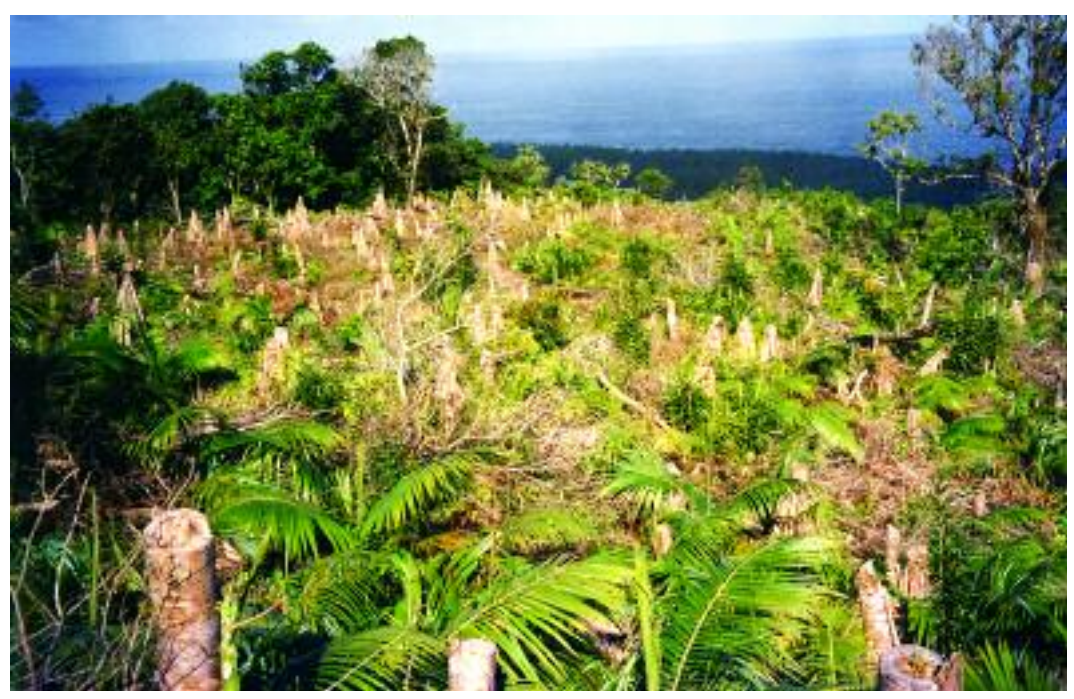
20. A new plantation of Acanthophoenix rubra in Basse Vallée (alt.300 m) on land previously planted with Pandanus utilis whose stumps are still visible.

Pierre to Saint-Denis, with possible incursions in Cirque de Cilaos and Cirque de Mafate. In Cirque de Cilaos, a village named Ilet Palmistes Rouges is located on the edge of the megathermic semi-dry zone. During the dry months, the lack of rain is made worse because of the presence of a poor soil that does not retain the water. The village name refers to a red palmiste population, of which nothing remains. The local conditions do not allow A. rubra to grow and the "missing" palm may have been A. rousselii. It would also be advisable to search for the hypothetical presence of A. rousselii toward Aurère, in the Cirque de Mafate, where a wild population of Dictyosperma album var. album remains in an out of reach location.