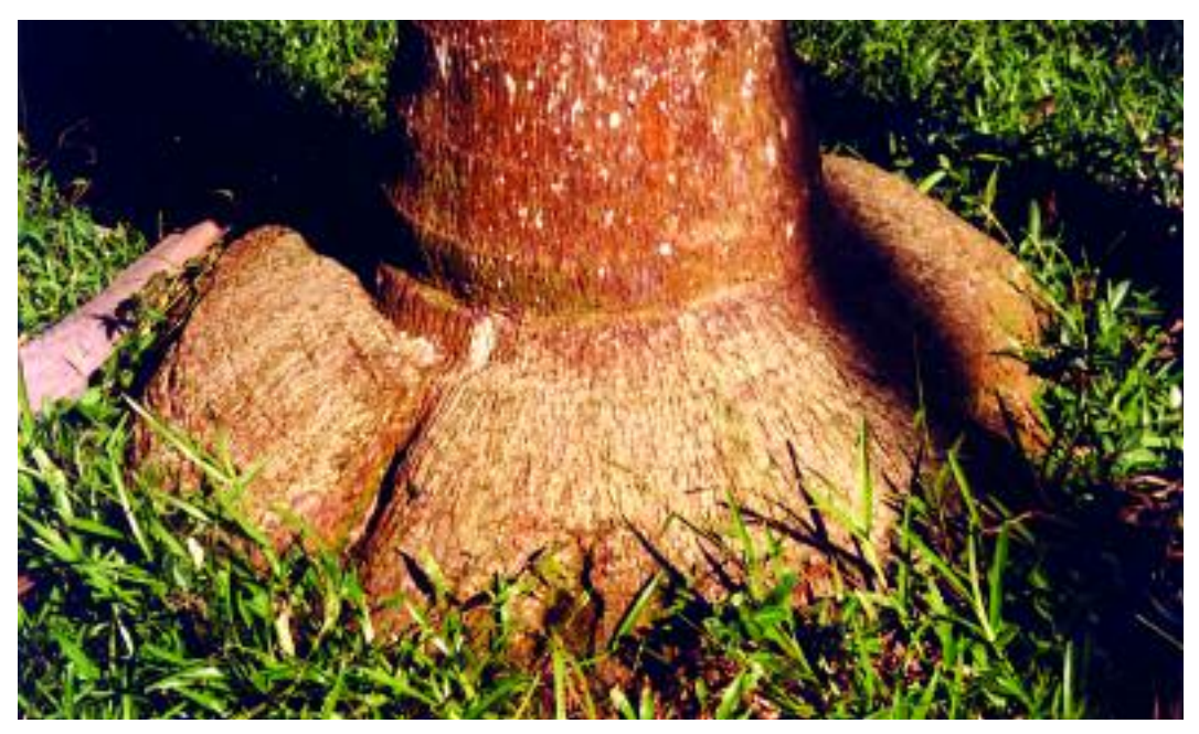
3. Acanthophoenix rubra: stem base shaped like an elephant's foot on an old specimen at Anse des Cascades.

Cadet some 30 years ago, but with his untimely death this third species of Acanthophoenix was forgotten for decades.