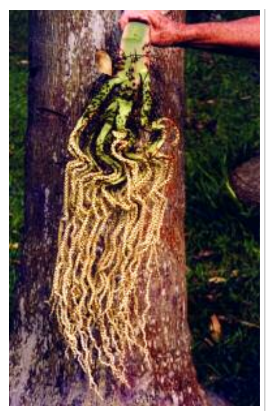
10 (above). Acanthophoenix rubra immature infrutescence broken off by a gust of wind at Anse des Cascades. 11 (below). Acanthophoenix crinita: rachilla section with staminate flowers and pearshaped pistillate flowers ( \times 4.5).

base (Fig. 3). The older the specimen, the more swollen the stem base; although it appears that the swelling is more accentuated in Acanthophoenix rubra . This characteristic allows for a larger root system to be in contact with the ground and may give more stability to the palm, an adaptation that may help it to resist cyclone-force winds.