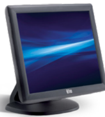
1715L – 17"