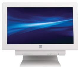
19CM3 – 19" and 22CM3 – 22"

Intel 1.66GHz Atom Dual-Core D510 2GB (upgradeable to 4GB) 320GB Windows 7 AccuTouch, IntelliTouch, IntelliTouch Zero-Bezel For medical applications. Also available with Intel 3.0GHz Core 2 Duo E8400.