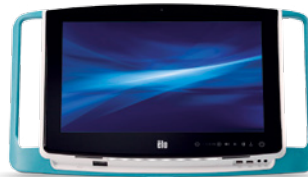
VuPoint M-Series – 19"

Processor Memory Hard drive Operating systems Touch technologies Comments