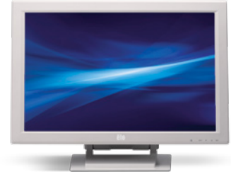
2401LM – 24"

Color White Contrast ratio 1000:1 Brightness (panel) 300 nits Viewing angle 170°/160° Touch technologies AccuTouch, IntelliTouch, IntelliTouch Pro Comments For medical applications; Also available in 15" (1519LM); Speakers