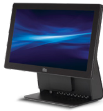
15E2 – 15"