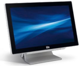
19CM2 – 19" and 22CM2 – 22"

Processor Memory Hard drive Operating systems Touch technologies