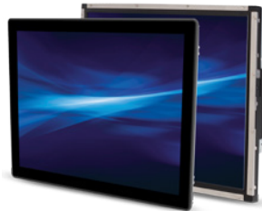
1937L and 1930L – 19"