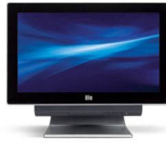
19C5 - 19" and 22C5 - 22"