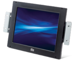
1247L – 12"