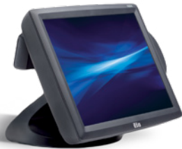
1529L – 15"