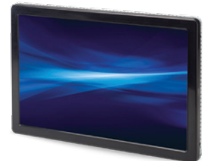
2239L - 22"