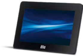
0700L – 7"