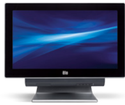
19C2 – 19" and 22C2 – 22"

Intel 2.5GHz Celeron Dual-Core G540 2GB DDR3 (upgradeable to 16GB) 320GB No OS, Windows 7 AccuTouch, IntelliTouch Optional MSR, fingerprint reader, rear display, barcode scanner, 2nd HDD, 7-inch rear-facing touch LCD