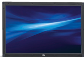
1938L – 19"