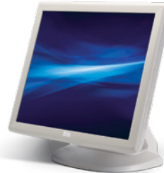
1928L – 19"