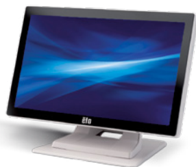
1919LM – 19"

Color Black Contrast ratio 1000:1 Brightness (panel) 250 nits Viewing angle 170°/160° Touch technologies IntelliTouch, IntelliTouch Zero-Bezel, IntelliTouch Pro Comments Wide aspect (16:9); Optional MSR and webcam; Speakers