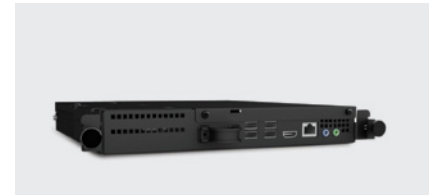
7001L – 70"