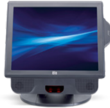
1729L – 17"