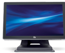
1519L – 15"