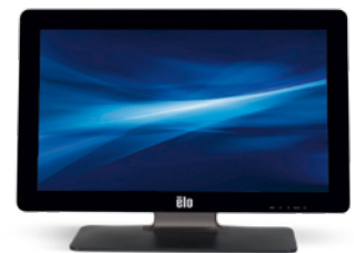
2201L – 22"

Color Grey Contrast ratio 1000:1 Brightness (panel) 300 nits Viewing angle 160°/155° Touch technologies AccuTouch, IntelliTouch Comments