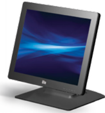
1523L – 15"