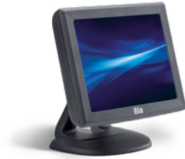
1215L – 12"