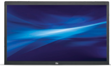
2440L – 24"