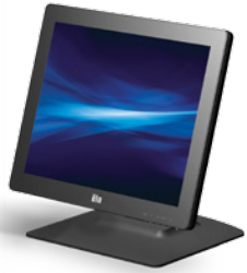
1723L – 17"