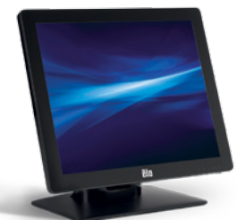
1717L – 17"