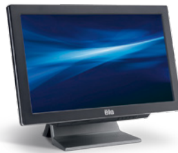
19C3 – 19" and 22C3 – 22"