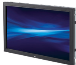
1940L – 19"