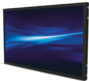
4243L – 42"