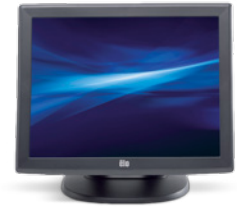
1515L – 15"