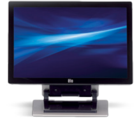
1900L – 19"

Color Black or white Contrast ratio 800:1 Brightness (panel) 250 nits Viewing angle 170°/160° Touch technologies IntelliTouch Zero-Bezel Comments Optional MSR, RFID reader, customer display, webcam