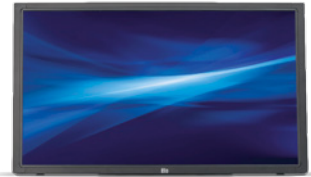
2240L – 22"