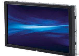
1541L – 15"