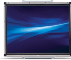
1537L – 15"