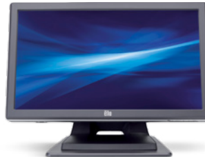
1919L – 19"