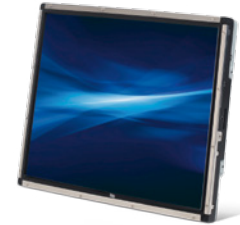
1739L – 17"