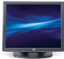
1915L – 19"

Color Grey or beige Contrast ratio 1000:1 Brightness (panel) 250 nits Viewing angle 160°/160° Touch technologies IntelliTouch Comments Speakers; Wide-aspect (16:10); Also available in 22" (2200L)