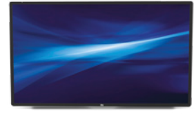
3201L – 32"