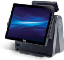
15D1 – 15"

Processor Memory Hard drive Operating systems Touch technologies Comments