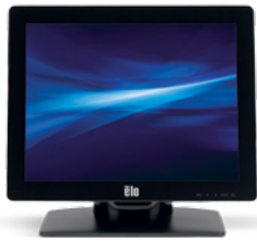
1517L – 15"