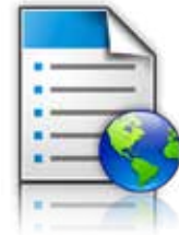
Forms and Favorites

Display Customization: Display a customized, scrolling slideshow on the color touch screen to communicate important messages to users while the printer is in sleep mode.