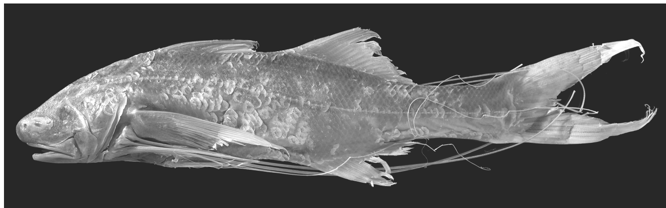
Fig. 1. Polynemus bidentatus , UMMZ 213346, holotype, 153.4 mm SL, My Tho Province, Vietnam.

Body oblong, moderately compressed anteriorly, progressively more compressed posteriorly. Nape and anterior body not highly arched, body depth shallow. Head large, length slightly greater than body depth. Scales covering entire body and head, except for lips and adipose eyelid, and body;