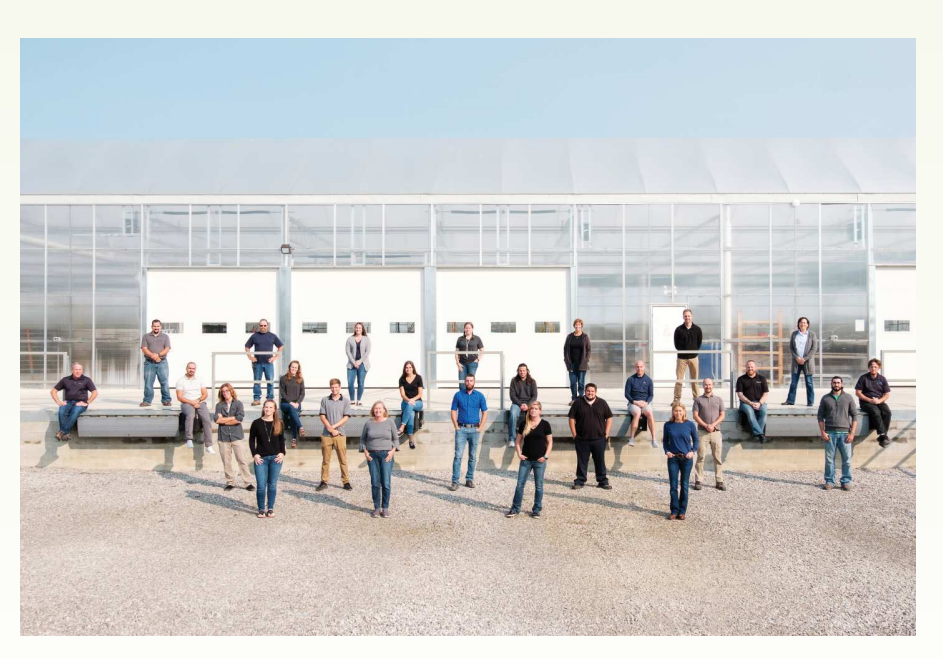
Our fun and expert team has more than 274 years of combined horticultural experience. We are here to help you!

September 10, 2021 Come tour our nursery and meet our team!