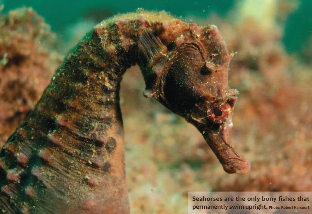
Seahorses are the only bony fishes that permanently swim upright.