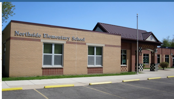
Northside Elementary School

MHS students may earn high school and college credit at the same time. The dual enrollment program provides the opportunity for high school students to jump-start their college education by enrolling in college-level courses, while still attending high school. Juniors and seniors at Morrison High School may participate in career and technical education training, held at the Whiteside Area Career Center in Sterling, IL. Students are transported to the center to participate in work-based programs from auto and computer technology, digital media arts, criminal justice, and health occupations to name a few.