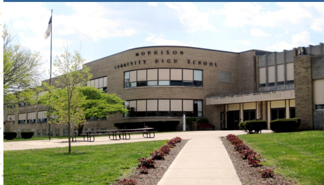
Morrison High School