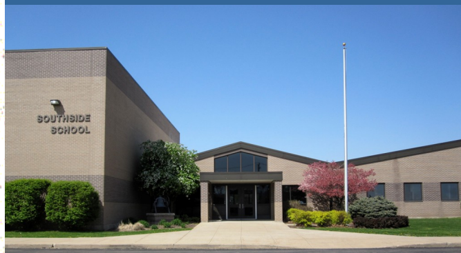
Southside Elementary School