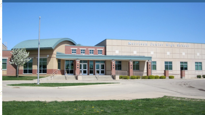
Morrison Junior High School