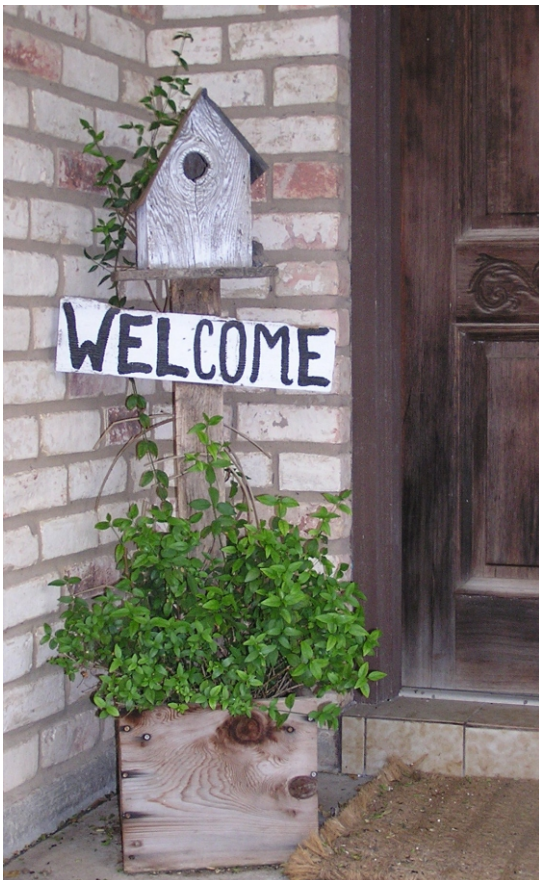
David's milkberry wraps its sprawling stems around this wooden planter beside the author's front door.