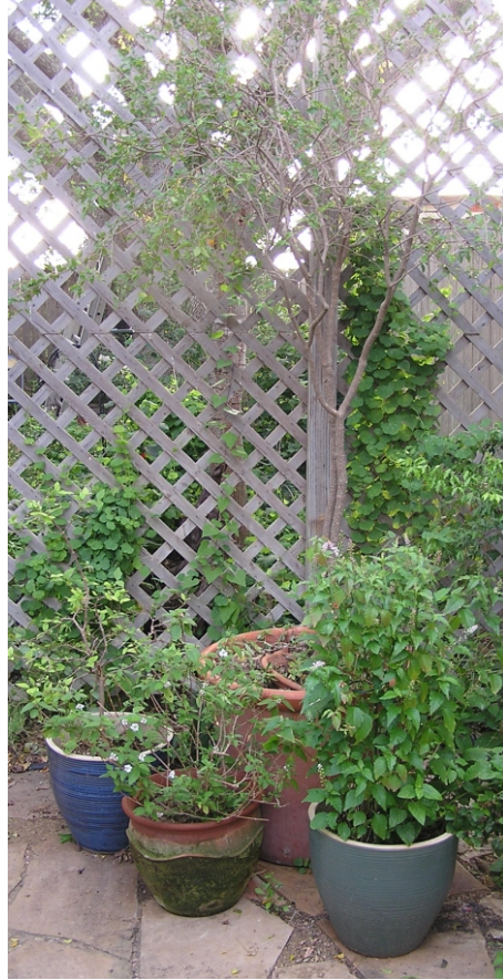
This grouping of Barbados Cherry, center back in large pot and to the back left; Velvet Lantana, center front, and Pigeonberry, right, are grouped to complement each other and bring color to this patio corner.