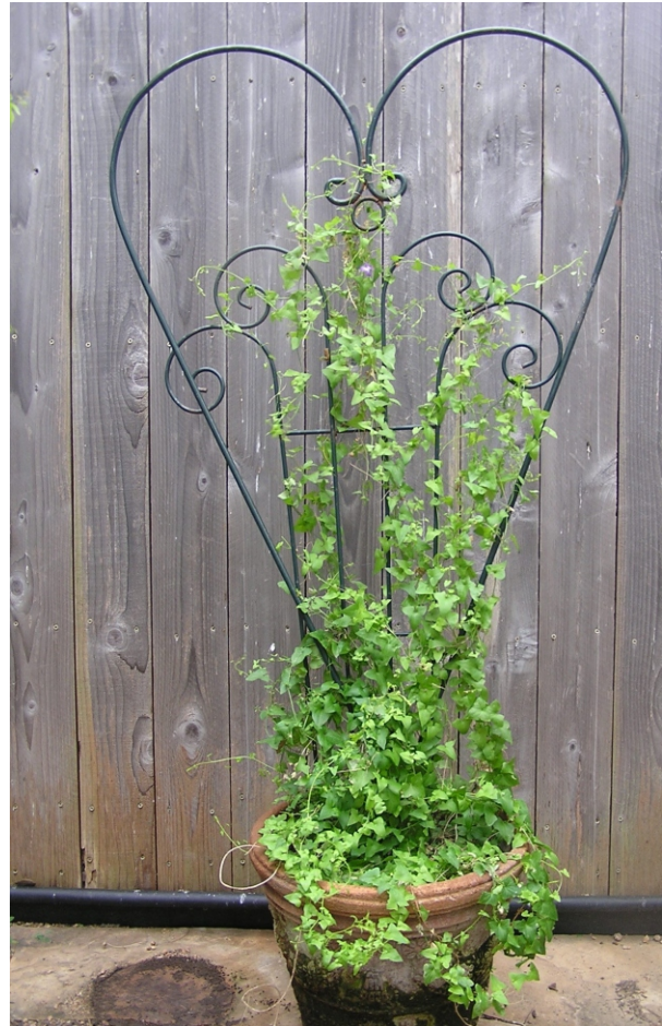
The Snapdragon vine above, and the close-up below, showing the beautiful bluish flower, is located on a patio where it is protected from wind and afternoon sun. The photo below shows the same plant in early fall when it is at its fullest.