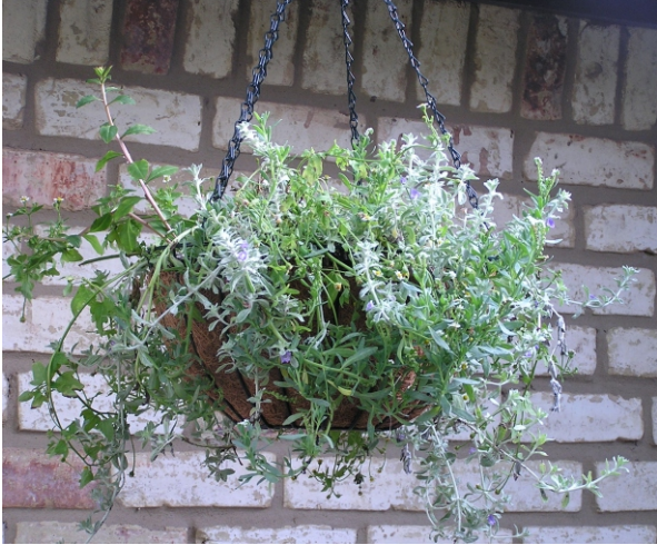
Woolly Stemodia, Rock Daisy, and Heliotrope above combine to make the above hanging basket stunning.