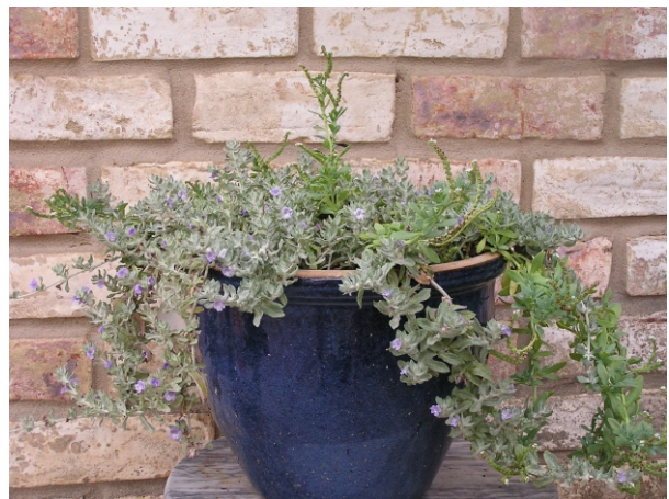
The cobalt blue of this ceramic pot and the faint, white blooms and green foliage of both Curled leaf and Seaside Heliotrope, complement the lavender blooms and grey-green foliage of Snake Herb.