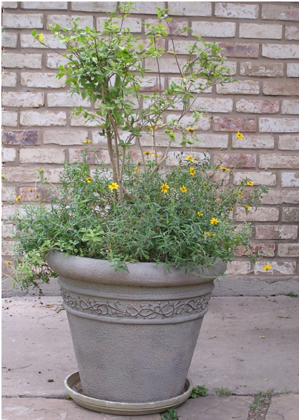
Wedelia is an excellent choice to fill in under a Barbados Cherry that is being trained as a small tree in this large pot. Snake Herb that is just starting to drape over the edge of the pot will help to soften the pot's edge. This type of combination is known as a Thriller, Filler, Spiller planting.