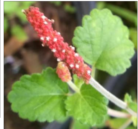
Below: Yellow blooms of Senna lindheimeriana , PDST 237. Prefers low, wet places. Coral blooms of Indigofera miniata , PDST 264. Host for Cassius Blue, Reakirt’s Blue and Funereal Dusky Wing. (Both plants are Legumes.)

These are a few of the photos Matt posted on September 7. Some are not noticeable in the wild except after good rain. Container growing provides the advantage of keeping them well-watered year-round. Barry Nall pointed out in a presentation for NPP: these “edge plants” are in constant threat from herbicide, mowing and traffic. Several serve as hostplants for known critters, probably for unknown ones as well.