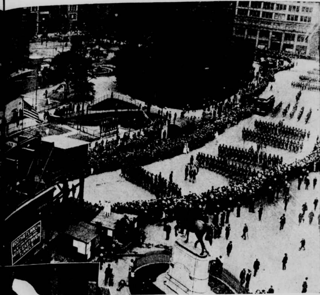
All branches of America's fighting forces turned out last week to parade for recruits. Here is a view of infantry passing the landship Recruit, at Union Square.