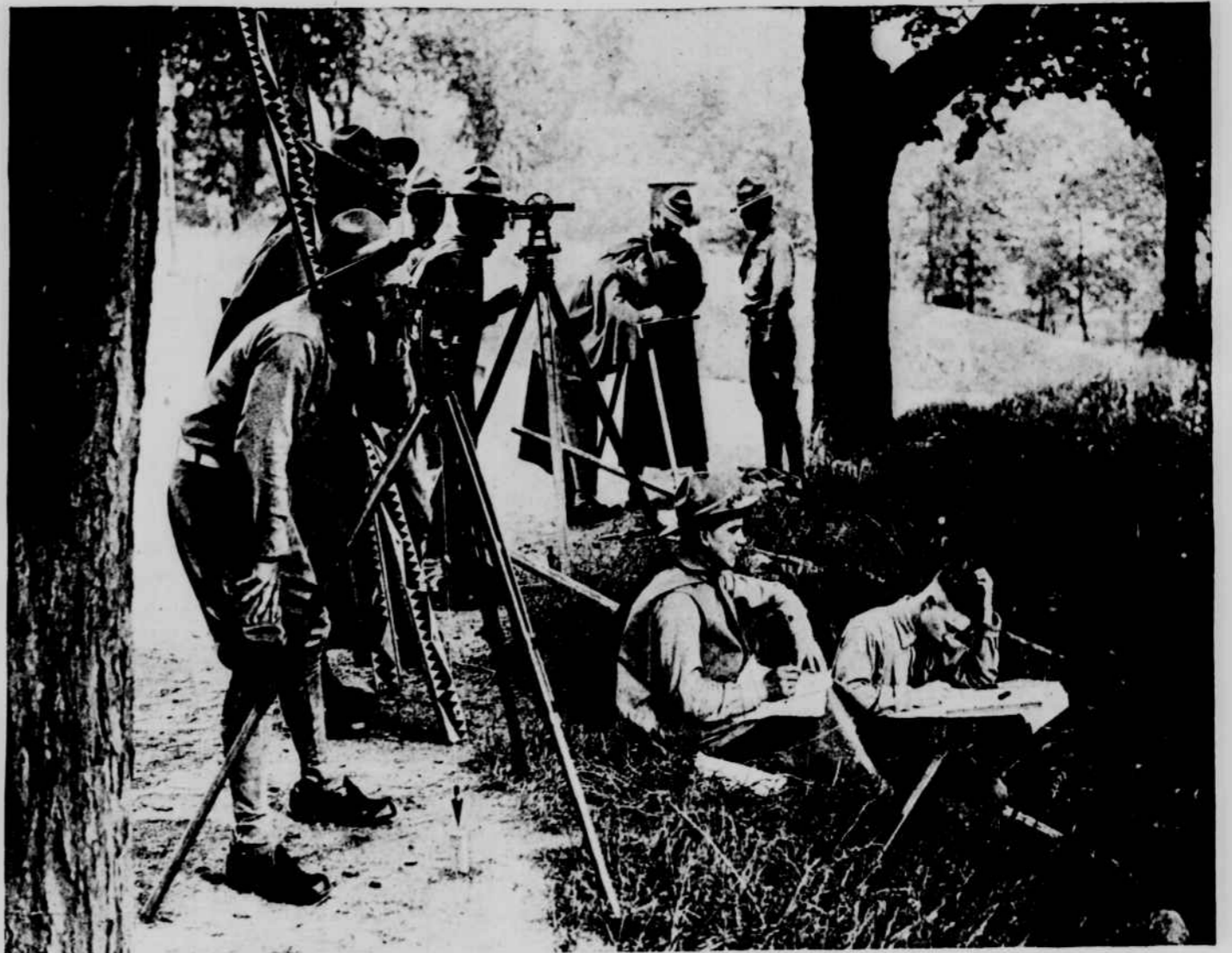
Cadets from West Point in camp, where their training is being rushed to graduate the next class in August, nearly a year ahead of time.