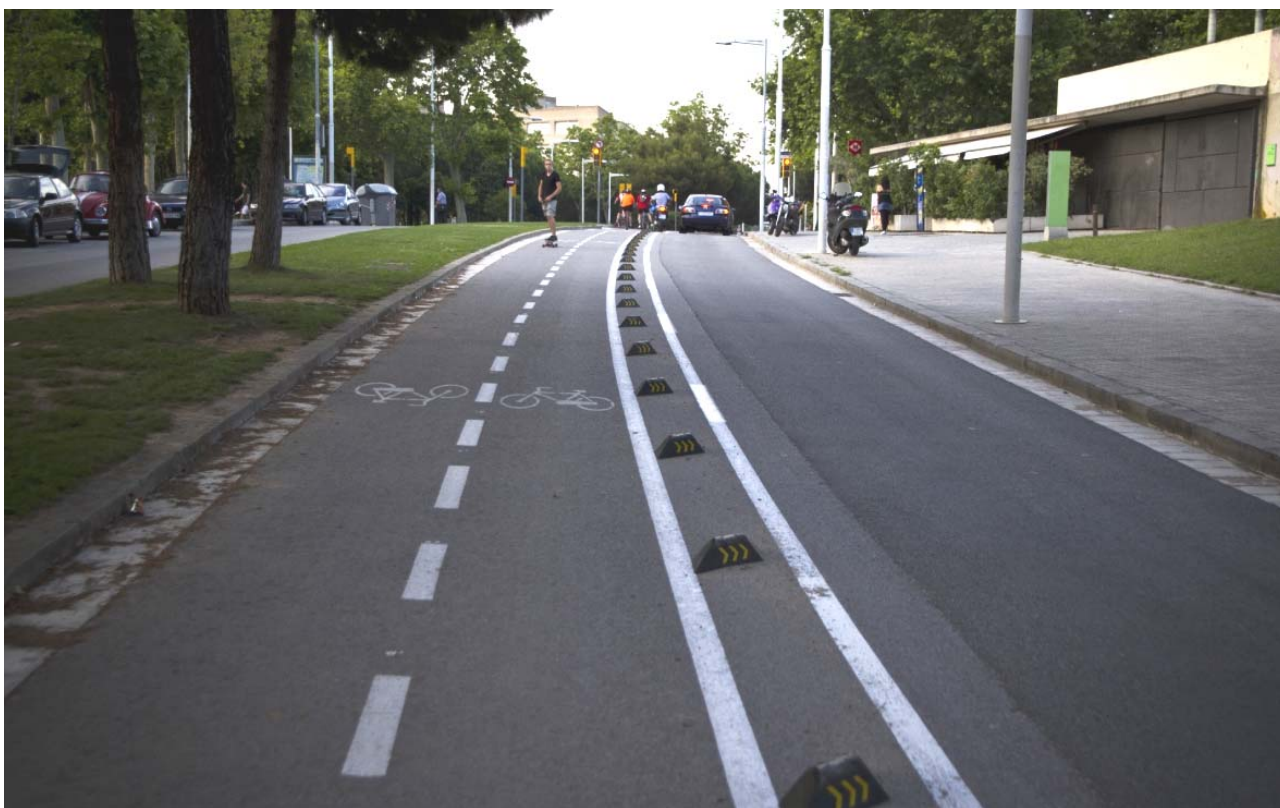
Example of semi-segregation using cats eyes in Barcelona