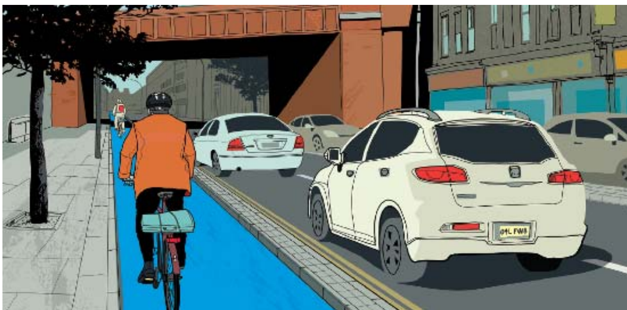
Proposals for the Cycle Superhighway extension to Stratford