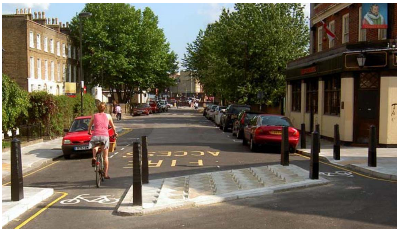
An example of filtered cycle permeability in London