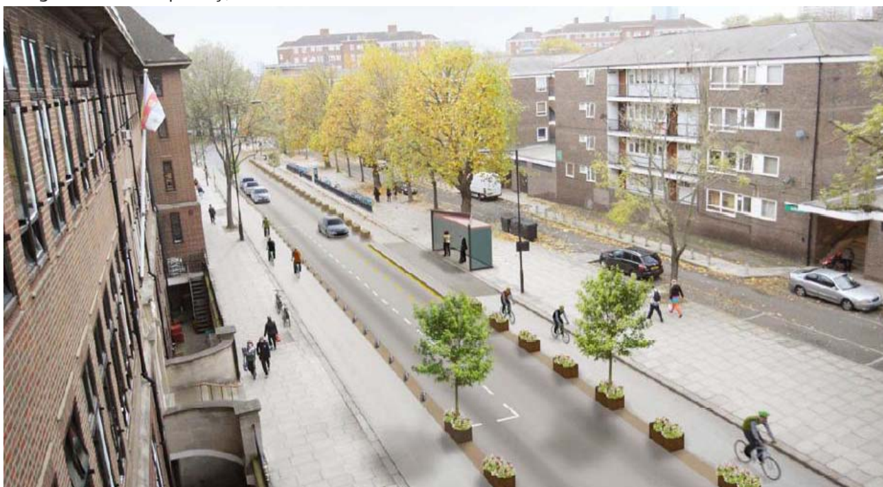
Visualisation of Royal College Street, Camden, an example of semi-segregation in London

Where there is conflict between modes (which there often isn't) we will try to make a clear choice, not an unsatisfactory compromise. We will segregate where possible, though elsewhere we will seek other ways to deliver safe and attractive cycle routes. Timid, half-hearted improvements are out – we will do things at least adequately, or not at all.