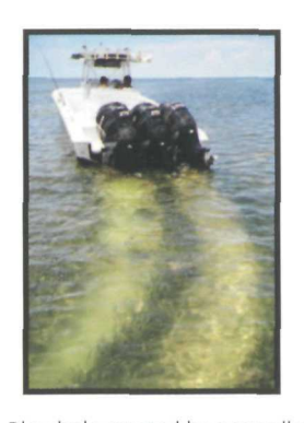
Blowhole created by a propller

Seagrass habitat is declining. Seagrasses grow in shallow coastal waters and can be damaged by boaters with wakes, anchors, propellers and fishing equipment that disturb and scar the seabed. Scaring exposes the seagrass roots which allows waves and currents to erode the seabed, resulting in the loss of seagrasss habitat.