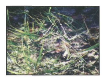
Manatee Grass (Syringodium filiforme)