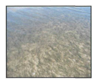
Shoal Grass (Halodule wrightii)