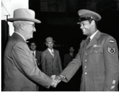
In 1948, President Truman issued Executive Order 9981, ending segregation in the military.

On February 2, 1948, President Truman took great political risk by presenting a daring civil rights speech to a joint session of Congress. Based on the committee's findings, he asked Congress to support a civil rights package that included federal protection against lynching, better protection of the right to vote, and a permanent Fair Employment Practices Commission.