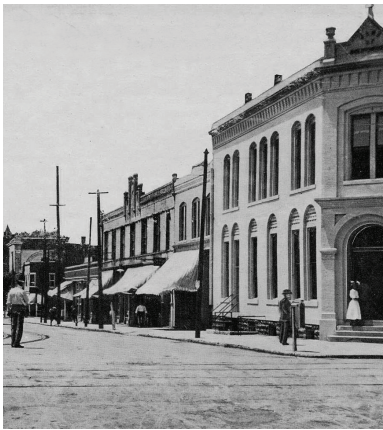
The Independence town square in the early 1900s. Truman grew up in a time of segregation in rural Missouri.

Harry Truman’s civil rights views as President surprised many because they seemed to contradict his upbringing. Truman grew up in a former slave state where his small-town, rural surroundings included segregation and subordination for many of its citizens.