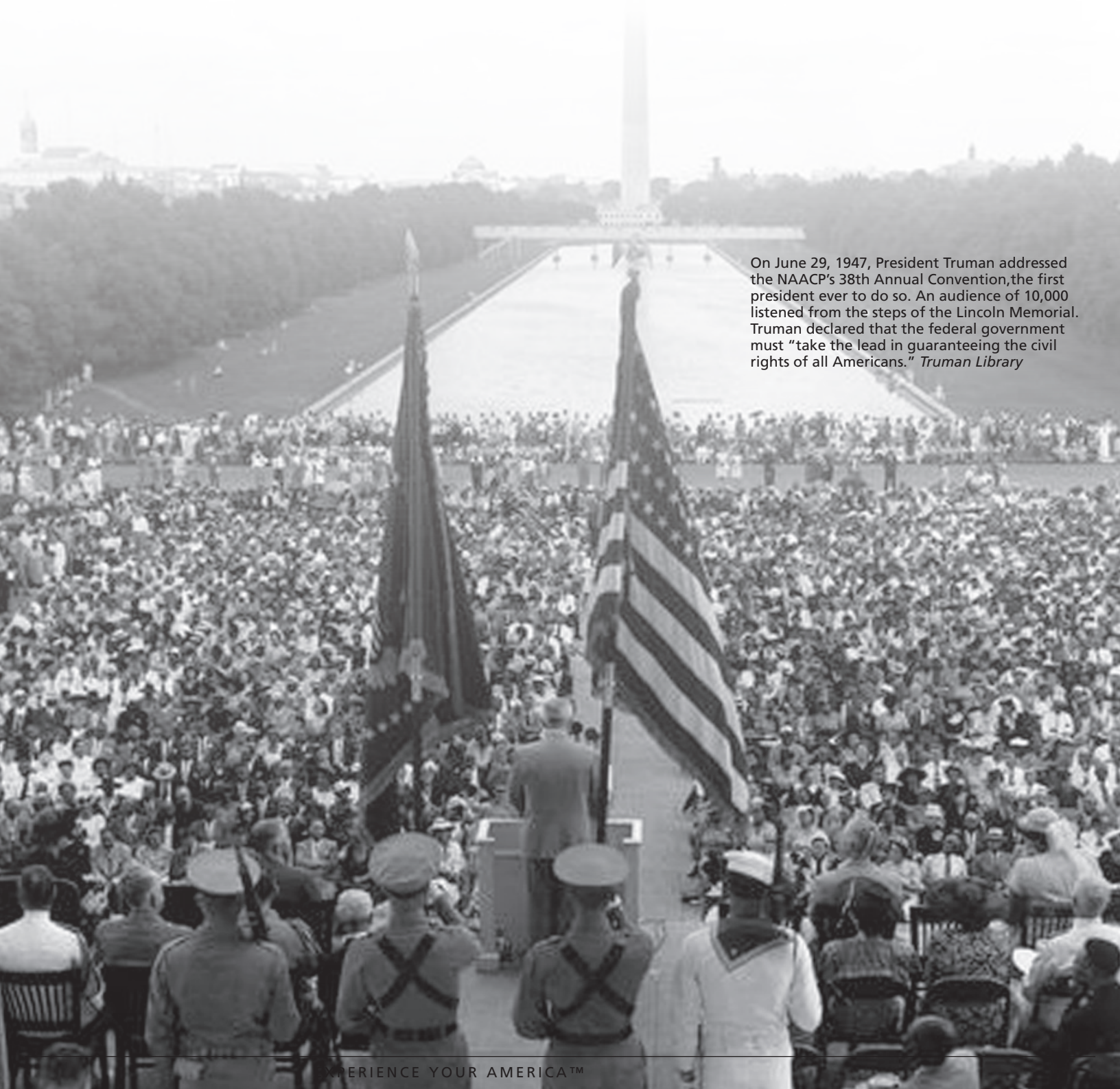
On June 29, 1947, President Truman addressed the NAACP's 38th Annual Convention, the first president ever to do so. An audience of 10,000 listened from the steps of the Lincoln Memorial. Truman declared that the federal government must "take the lead in guaranteeing the civil rights of all Americans."

Although Truman never entirely overcame all of his personal prejudices, his heartfelt sense of fairness and his deeply-rooted faith in the US Constitution made him the first modern president to champion civil rights, paving the way for the legislative successes of the 1960s.