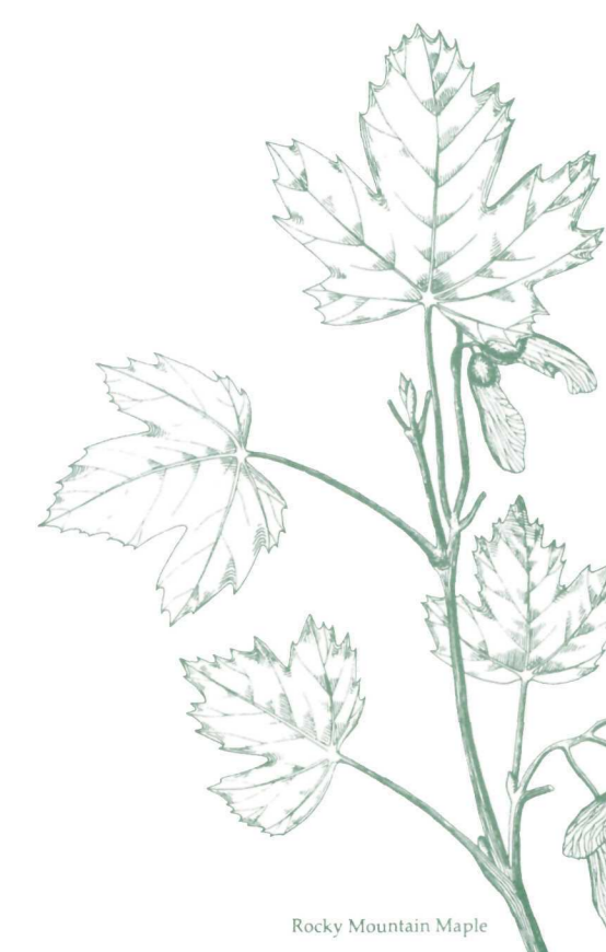
Rocky Mountain Maple