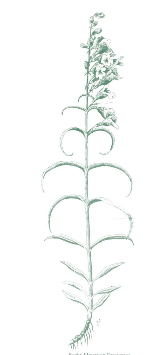
Rocky Mountain Penstemon