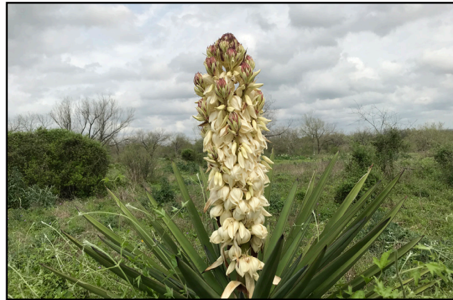
Spanish dagger, Yucca treculeana