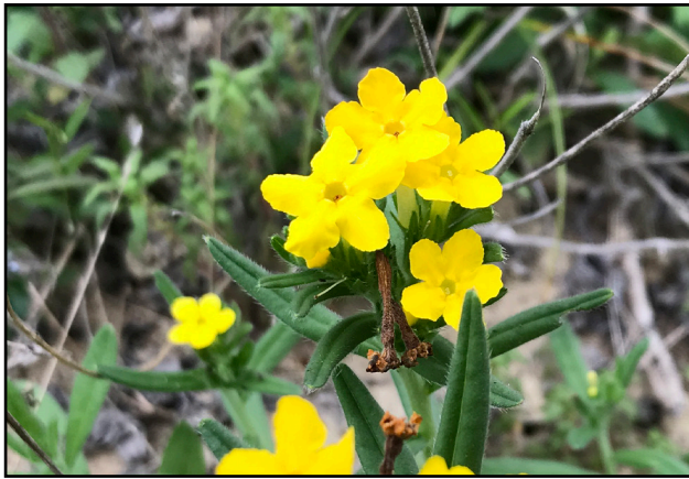
Hairy puccoon, Lithospermum carolinense