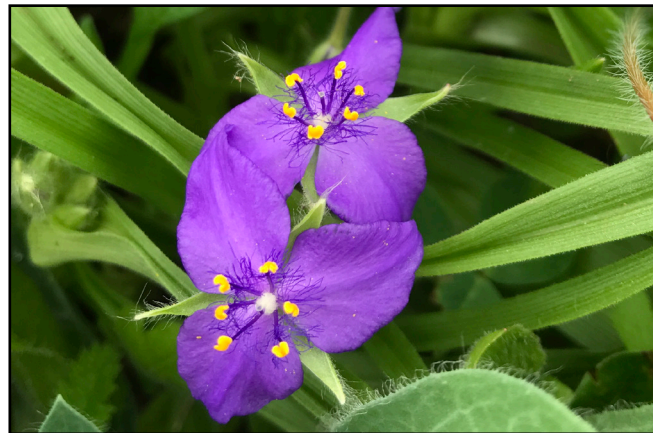
Spiderwort, Tradescantia sp.