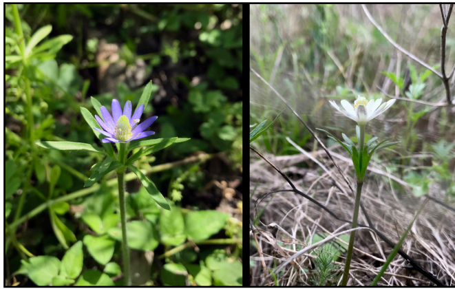
Tenpetal thimbleweed, Anemone berlandieri