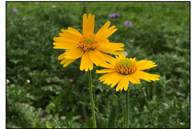
Huisache daisy, Amblyolepis setigera