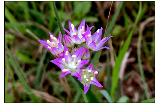
Wild onion, Allium sp.