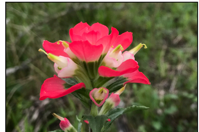
Texas indian paintbrush, Castilleja indivisa