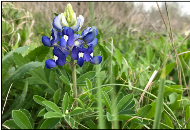
Texas bluebonnet, Lupinus texensis