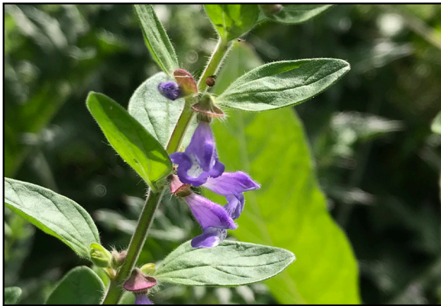
Annual skullcap, Scutellaria drummondii