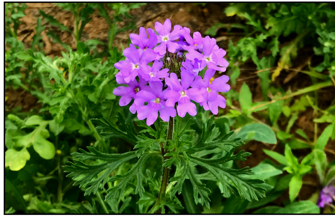
Prairie verbena, Glandularia bipinnatifida