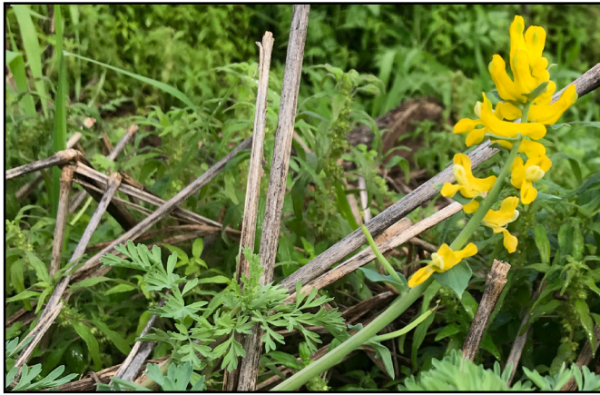
Scrambled eggs, Corydalis sp.