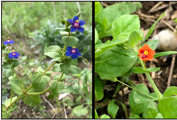
Scarlet pimpernel, Anagallis arvensis (exotic)