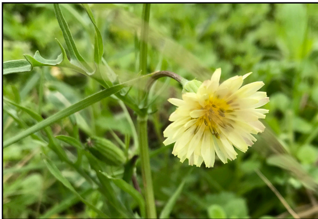
False dandelion, Pyrrhopappus pauciflorus