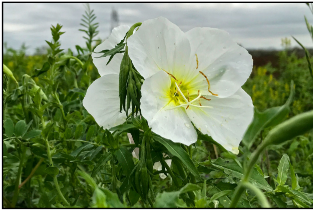
Showy evening primrose, Oenothera speciosa