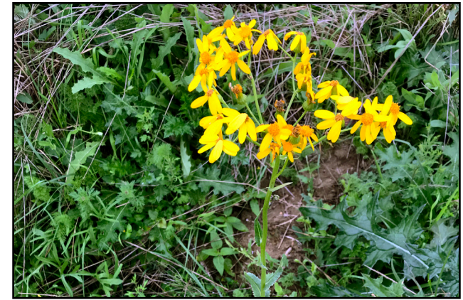
Texas groundsel, Senecio ampullaceus