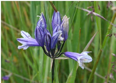
Large-flowered Triteleia ( Triteleia grandiflora var. howellii )

Notes: Viewed in abundance on the upper reaches of the main trail to the Young Hill summit. The green leaves are speckled much as the coat of a fawn. Faint perfume. Flowers are usually single.