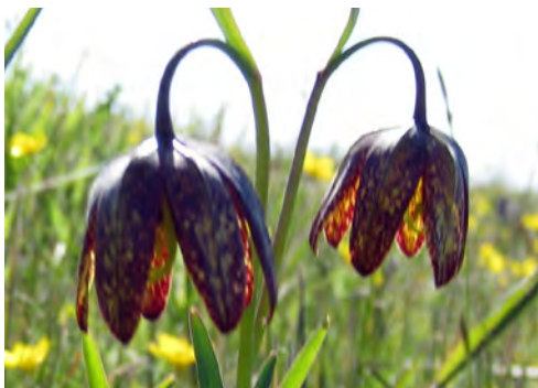
Checker or Chocolate Lily ( Fritillaria affinis )

Notes: Not always first to bloom, locals view its arrival as the first sign of spring. Cultivated as an important food source by Native Americans.