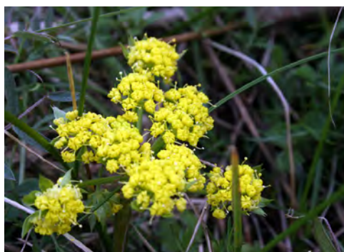
Spring Gold ( Lomatium utriculatum )

Notes: These star-like flowers are quite distinctive with their unevenly shaped petals. The stem bears up to 14 flowers. The five petals are bright white.