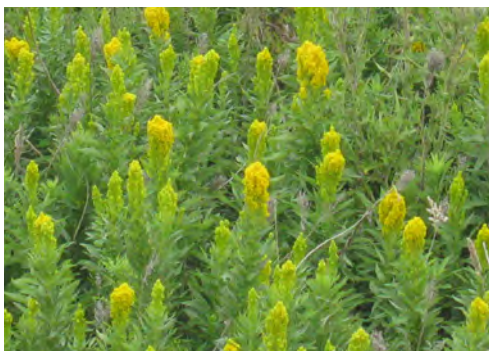
Rough Canada or Meadow Goldenrod ( Solidago canadensis var. salebrosa )

Notes: Littoralis means "of the beach," therefore these purple and white, pea-like flowers are found low to the ground on seaside bluffs, especially near Grandma's Cove at American Camp.