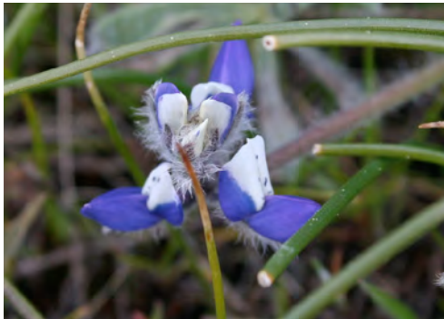
Miniature or Bicolor Lupine ( Lupinus bicolor )

Notes: Blue-eyed grass is not really a grass but is actually an Iris. While most Irises prefer wet lands, this one is native to prairie grasslands such as American Camp.