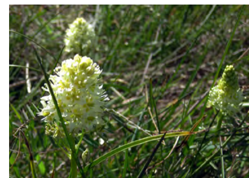
Death Camas ( Zigadenus venenosus var. venenosus )

Notes: Yellow blooms carpet meadows and rocky outcrops in early spring. The dark green leaves are soft and feathery, much like a carrot. Also known as Fine-leaved Desert Parsley.