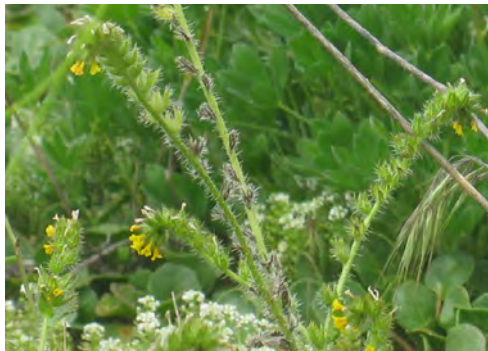
Menzies' Fiddleneck ( Amsinckia menziesi )

Notes: Once thought to deplete or "wolf" soil minerals; hence the genus derived from the Latin lupus or "wolf." It actually enhances soil fertility by fixing nitrogen into a useful form.