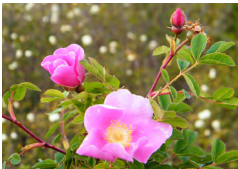
Nootka Rose ( Rosa nutkana var. nutkana )

Notes: Listed as threatened, the park is participating in a recovery plan at American Camp using plants propagated from San Juan Island populations.