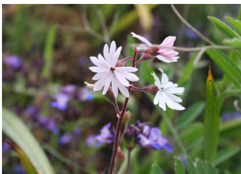
Small-flower Woodland Star ( Lithophragma parviflorum )

Notes: The bulbs were highly prized by Northwest Indians for their creamy potato or baked pear taste. Blooms much later than Common Camas.