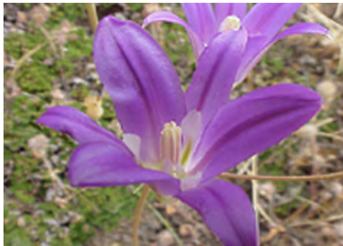
Crown or Harvest Brodiaea ( Brodiaea coronaria )

Notes: Solitary and two to three feet tall, this delicate plant features deep blue trumpet flowers. The bulbs were a food source