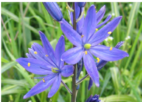
Large or Great Camas ( Camassia leichtlinii )

Notes: With bold, pink flowers, it may very well be the most striking of the prairie wildflowers. Also known as Broad-leaved Shooting star. Common on Young Hill.