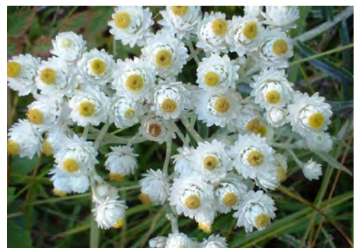
Pearly Everlasting ( Anaphalis margaritacea )

Notes: Pepperweed flourishes in disturbed areas. Flowers have no noticeable scent. Also known as Miner's Pepperwort.