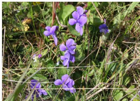
Hookedspur or Blue Violet ( Viola adunca var. adunca )

Notes: A staple food source for Native Americans. Leaves taste like celery, and the seeds were used in stews, teas, and tobacco. Also called Barestem Desert Parsley.