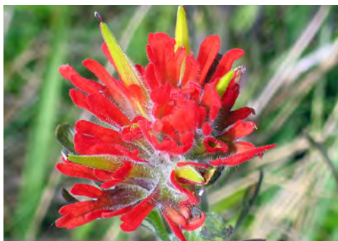
Harsh (Indian) Paintbrush ( Castilleja hispida )

Notes: The rinds of the hips (buds) are edible, but bitter. The seeds are irritating when taken whole.