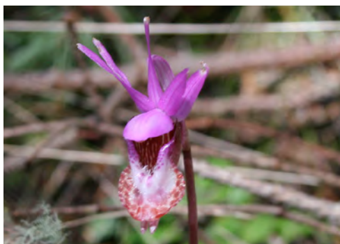
Fairy Slipper ( Calypso bulbosa )

Notes: Goldenrod flowers have been used as a source of permanent dye.