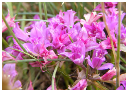
Taper-tip or Hooker's Onion ( Allium acuminatum )

Notes: Orchid family. Named after the sea nymph, Calypso. Found on Bell Point, Young Hill, and Mitchell Hill.