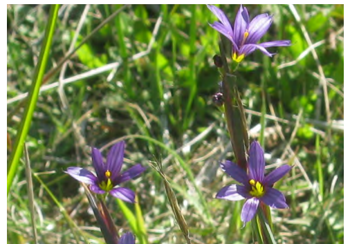
Idaho Blue-eyed Grass ( Sisyrinchium idahoense )

Notes: Violets are popular with nectar-seeking butterflies. The most common of the San Juan species.