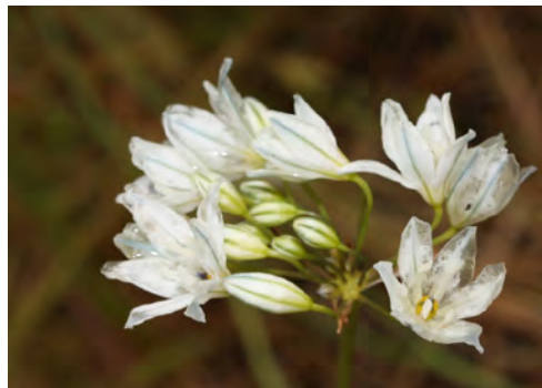
Hyacinth Brodiaea ( Triteleia hyacinthina )

Notes: At one time, coastal tribes gathered these bulbs as a food item.