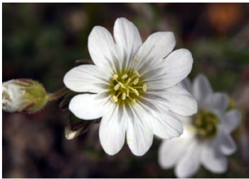
Field or Native Chickweed ( Cerastium arvense )