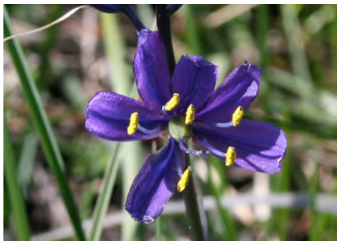
Common Camas ( Camassia quamash )

For more information, visit our website at www.nps.gov/sajh , or write: Superintendent, San Juan Island NHP, PO Box 429, Friday Harbor, WA 98250