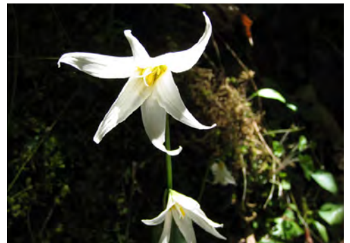
Giant White Fawn Lily ( Erythronium oregonum )

Notes: You'll have to get down on your hands and knees and look carefully for these tiny blooms. Found especially on recently burned areas.