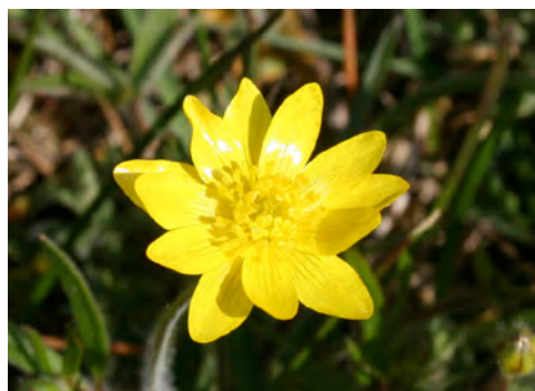
California Buttercup ( Ranunculus californicus )

Notes: Coastal Native Americans valued the large, succulent bulbs which when cooked, taste like bitter rice.