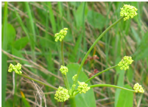
Barestem Biscuitroot ( Lomatium nudicaule )

Habitat: Rocky hillsides, meadows and bluffs. Notes: Get close to see the ornate, deeply notched petals on these tiny blooms. This perennial is an important nectar plant for butterflies. The fruit capsule contains tiny brown seeds.