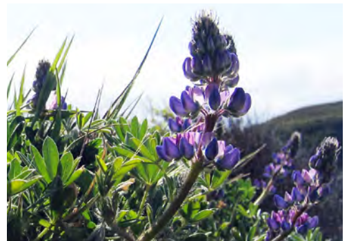
Seashore Lupine ( Lupinus littoralis )

Notes: Solitary and stately, these clusters of white bells seem too regal to be commonly found in roadside ditches as well as on the American Camp prairie.