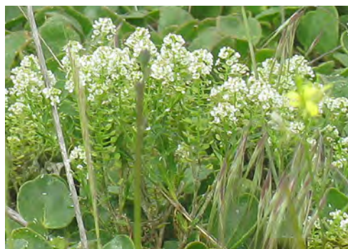
Common Pepperweed ( Lepidium densiflorum )

Notes: There are over 200 species of Indian Paintbrush in western North America. At San Juan Island NHP, the Paintbrush is found only at English Camp.