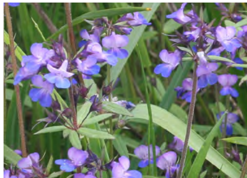
Small-flowered Blue-eyed Mary ( Collinsia parviflora var. parviflora )

Notes: The stem closely resembles the neck of a fiddle, unrolling as the yellow blooms emerge from the bottom up. Be aware: the leaves and seeds are toxic.