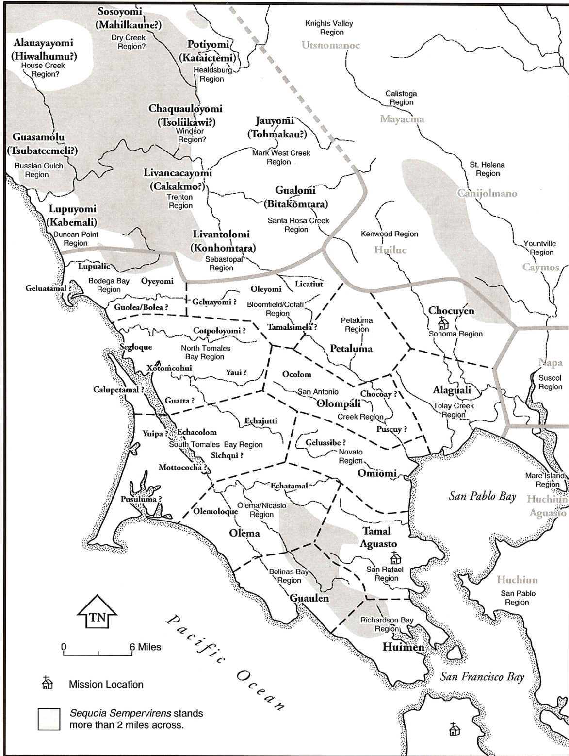
Figure 1. Coast Miwok and Pomo Communities within the Zone of Franciscan Mission Disruption, their Probable Locations and Possible Boundaries.