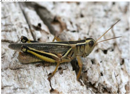
Twostriped grasshopper (Melanoplus bivittatus).