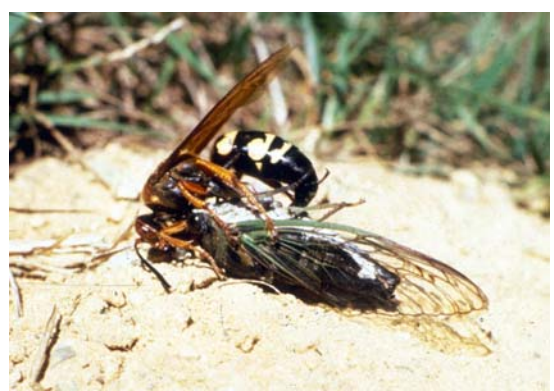
Cicada killer wasps ( Sphecius spp.) are the largest hunting wasps and specialize in hunting dog-day cicadas.

bees, hunting wasps are responsible for most of the small holes dug into the soil. Other species nest in small cavities in rocks or wood or excavate the pith from plants and nest n stems. A few, notably the black-and-yellow mud dauber, make nests of mud.