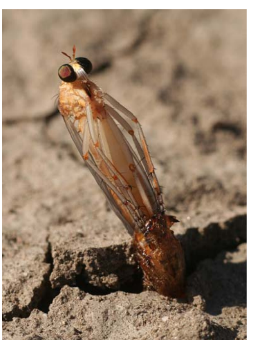
Diogmites angustipennis emerging from is pupal case.