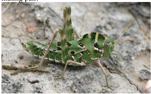
Great crested grasshopper ( Tropidolophus formosus ).