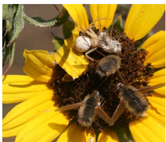
Systoechus sp. bee flies at flower. A Mismuena sp. of crab spider is feeding on one at the top of the photo.

However, despite their appearance the habits of bee flies are very different from bees. Although adults take nectar from plants, the larvae of many species apparently develop as predators of ground nesting bees and wasps. Bee flies may be seen hovering about the tunnel entrance where these insects nest, and the adults drop their eggs nearby. Upon hatch, the bee fly larvae migrate in search of the developing bee larvae below ground, which they consume.