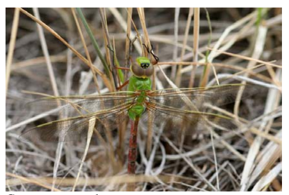
Common green darner.