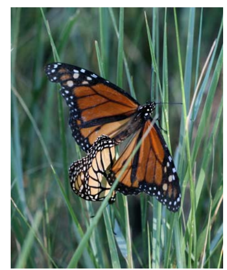
Mating pair of monarch butterflies.