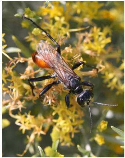
Podalonia valida, a hunting wasp that specializes in hairy caterpillars, such as the saltmarsh caterpillar.