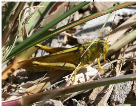
Green bird grasshopper (Schistocerca lineata).