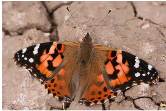
The painted lady is an annual migrant into the state. Larvae most often are found feeding on leaves of thistles, sunflowers, or mallow family plants.