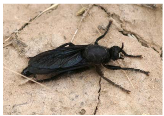
Ospriocerus minos, female/

The tip of the abdomen on females tapers to a fine point and is used to insert eggs into soil cracks or other sites where their young develop. Larvae of robber flies dwell in the soil or decaying wood and are predators, but the ecology of the immature stages is poorly known. The abdomen of male robber flies is tipped with bulbous claspers used for grasping females during mating and paired robber flies may be commonly seen.