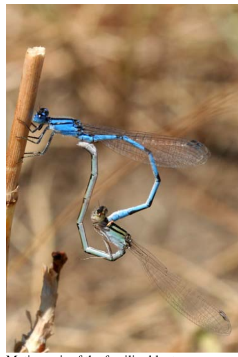
Mating pair of the familiar bluet ( Enallagma civile ) in the "wheel position".

Immature stages have a long and skinny body and 3 fan-like gills protruding from the hind end. The larvae are predators of small insects and other arthropods that they grab with their extensible lower jaw. Most species crawl about for prey, searching amongst underwater plants and other submerged debris.