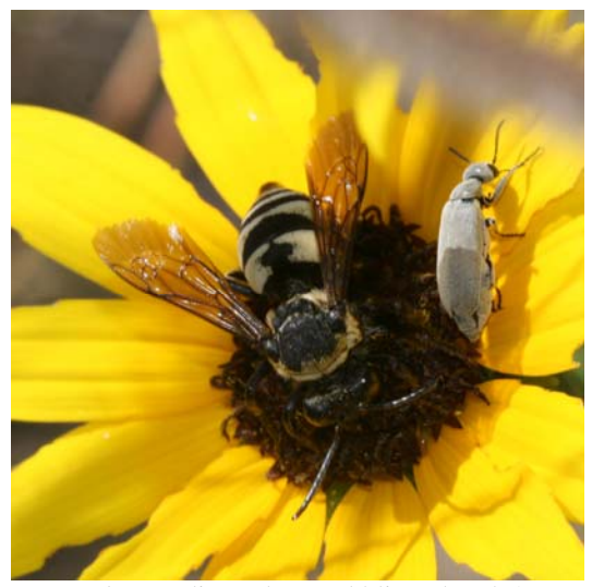
Triepeolus sp. digger bee and blister beetle/

These are a type of solitary bee that do not produce a colony (as do bumble bees). Instead each female establishes and maintains her own nest. However, they are quite particular about selection of nesting sites and multiple bees may sometimes be seen nesting in a small area where conditions of soil texture, slope and orientation are favorable. Females are capable of producing a mildly painful sting, but they are not aggressive and will sting only if confined against the skin.