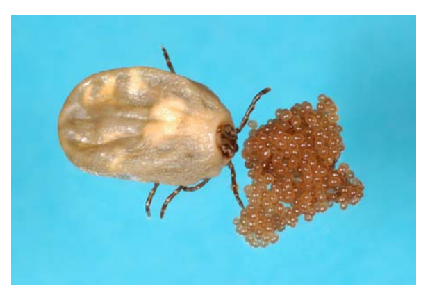
Engorged adult female tick laying eggs.

Humans may also incidentally acquire adult Rocky Mountain wood ticks although they are not a favored host. Seasonal activity is primarily from March or April for adults, peaking in June or July when high temperatures cause most to go dormant. In some areas of Colorado the Rocky Mountain wood tick is involved in the transmission of some pathogens, including those involved in Colorado tick fever, and Rocky Mountain spotted fever. (Ticks present at the Site are not involved in transmission of Lyme disease.)