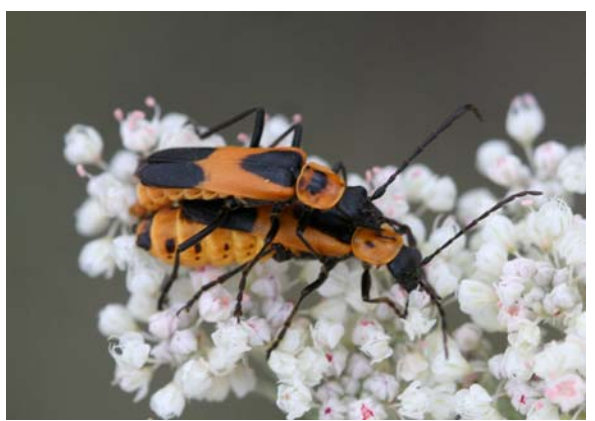
Mating pair of the soldier beetle Chaulignathous basalis.