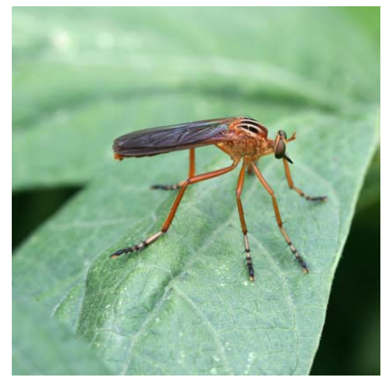
Diogmites angustipennis, male/