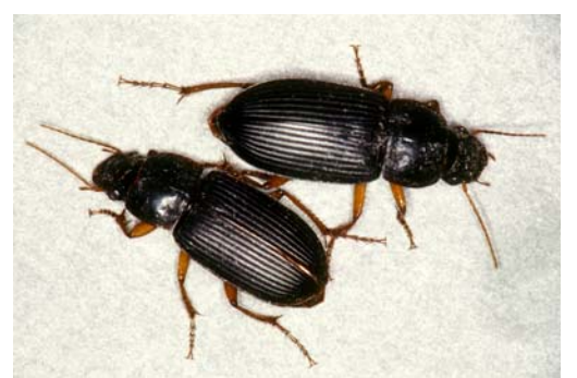
Harpalus pensylvanicus.