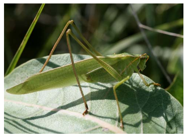
Texas bush katydid, Scudderia texensis.

Katydids are the "longhorned grasshoppers", with much longer antennae and often more delicate legs than the ubiguitous shorthorned grasshoppers (Acrididae family) that dominate. Katydids are more commonly found in areas of dense vegetation with low growing shrubs. However, they are rarely seen as they are primarily active at night and may be well camouflaged.