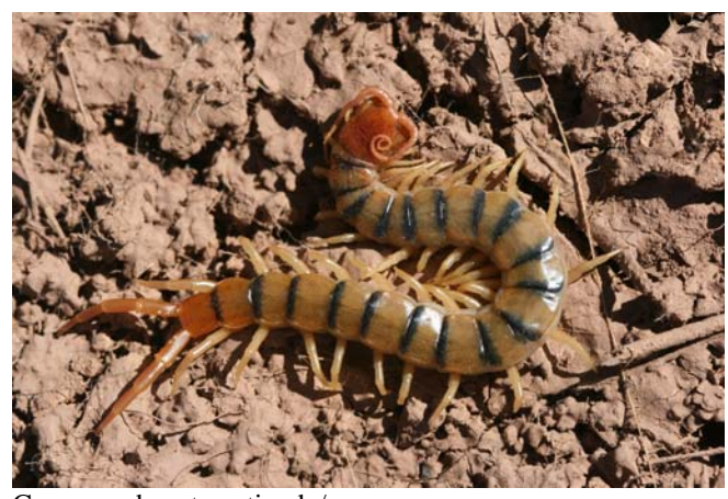
Common desert centipede/

The common desert centipede is a nocturnal predator, feeding on any arthropods that it can capture. Prey is captured by use of a pair of specialized front legs (maxillipeds) equipped with a poison gland to stun and kill. Larger, older stages may even occasionally capture and kill