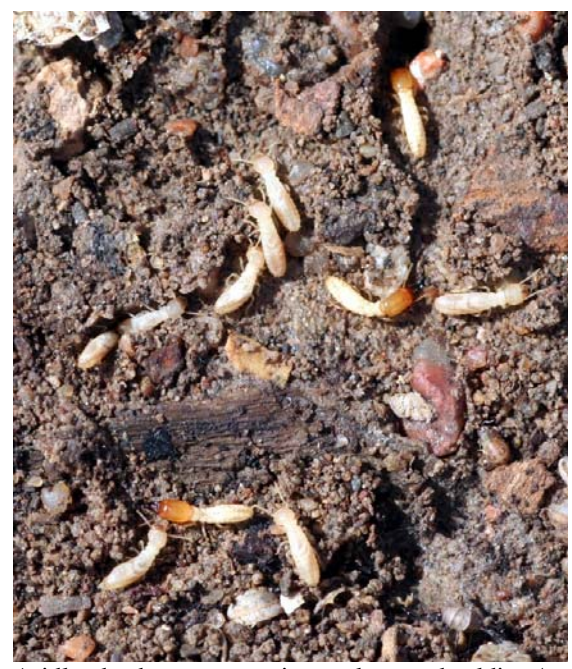
Aridland subterrean termite workers and soldiers/

The aridland subterranean termite produces a belowground nest that may be deeply buried, below frost line, in a site of suitable moisture. The pale foraging workers may tunnel several dozen meters from the nest to locate plant material but always stay in close contact with soil and never travel exposed above ground. Typically a small foraging