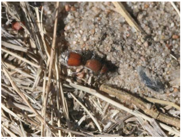
Velvet ant (Dasymutilla sp.), female/

Velvet ants develop as parasites of solitary bees and wasps that nest in soil. Females enter the burrow of the host insects and lay eggs among the developing young; the velvet ant larvae consume the young bees/wasps.