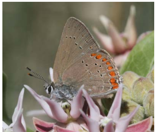
The gray hairstreak ( Strymon melinus ). Larvae feed on many different plants, particularly legumes and mallows.