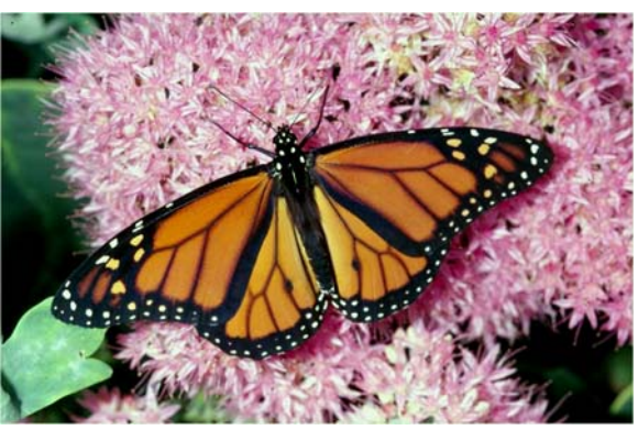
Monarch butterfly.

The monarch is only a temporary resident at SAND, as it is elsewhere in the US. New populations arise annually from migrants arriving in late spring. In late summer they make a return pilgrimage to a small area in south central Mexico which serves as the overwintering site for all the Monarchs that are found east of the Rocky Mountains. There they settle in forested areas of the Monarch Butterfly Biosphere Reserve, located in the mountains of Michoacan and Mexico states, where they stay dormant during the winter months. Because of its ubiquitous presence in summer, SAND has started supporting Monarch Watch by encouraging staff and volunteers to tag monarchs every summer during their southward migration.