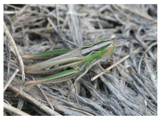
Velvetstriped grasshopper ( Eritettix simplex ), a species that overwinters as a nymph.

green species with arching crests behind the head. The most brightly colored is the pictured grasshopper ( Dactylotum bicolor ), also known as the "barber pole grasshopper", which is patterned with black, white and orange-red.