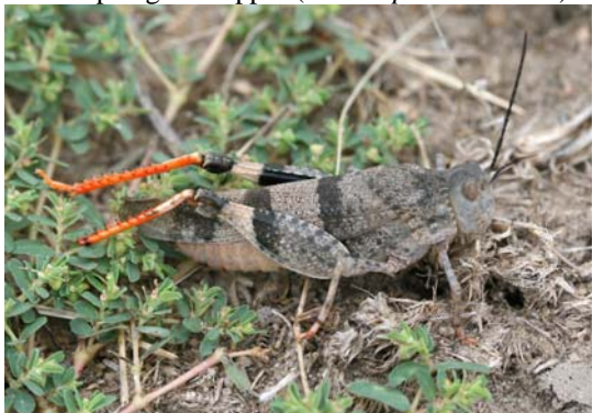
Threebanded range grasshopper ( Hadrotettix trifasciatus ).