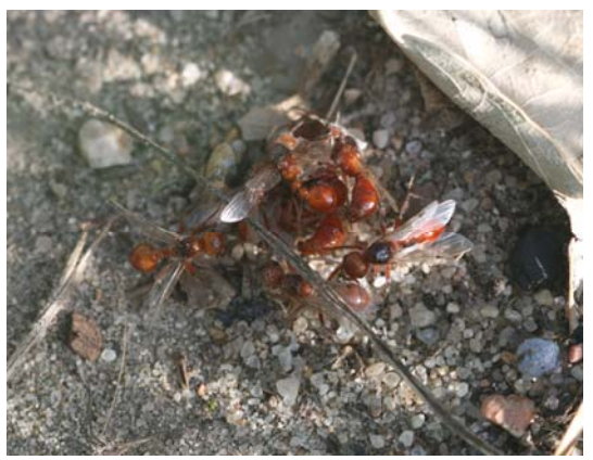
Mating ball of winged harvester ants/