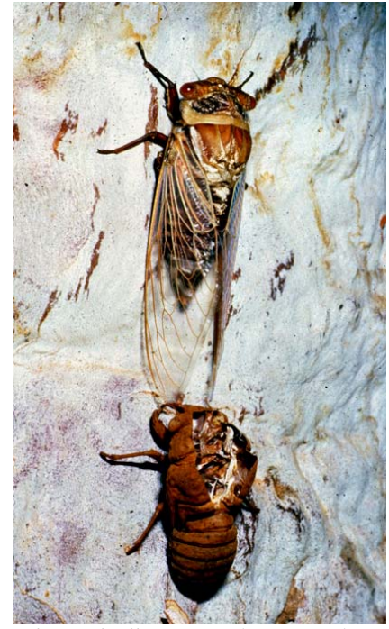
Tibicen dealbata recently emerged from nymphal skin.

Adults typically live in the canopy of trees for a few weeks. The males produce loud songs, a droning buzz that is typical of the 'dog-days' of midsummer. Cicada singing is used to attract females that, after mating, will insert eggs into twigs.