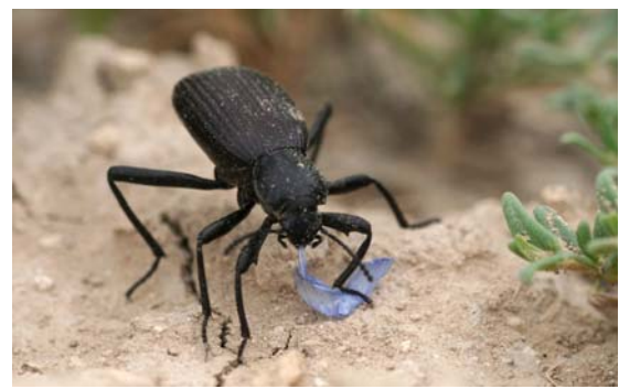
Eleodes hispilabris feeding on a fallen flower petal.

The most common group of darkling beetles are of the genus Eleodes with at