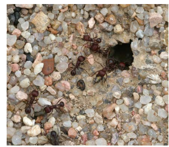
Harvester ants at nest entrance/

The great majority of the colony includes wingless workers and harvester ant workers are of uniform size. Winged forms are reproductive males and females that make up a small fraction of the