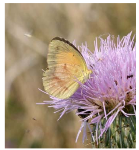
The dainty sulfur ( Nathalis iole ). Larvae feed on low growing plants of the aster family.