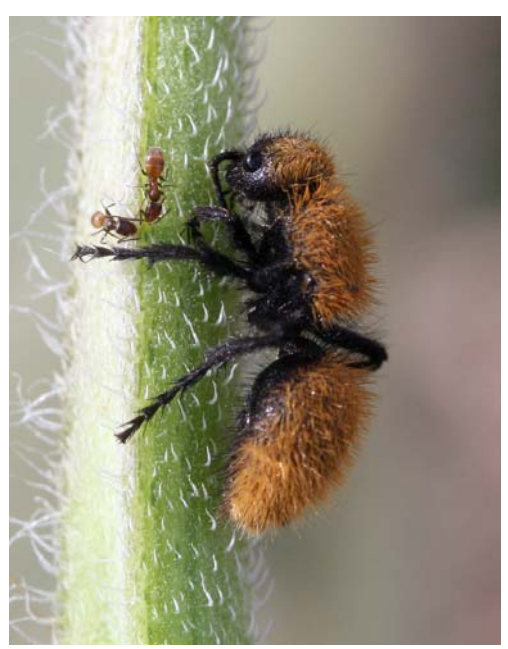
Velvet ant ( Dasymutilla sp.), female. Two ants are also in this picture.

Velvet ant females are wingless wasps that often may be spied crawling rapidly across the soil or over low growing plants. Typically they are hairy bodied and brightly colored with orange, yellow or red. The winged males have a quite different appearance and are most often seen resting on plants or feeding on nectar from flowers. At least 26 species of velvet ants occur on the Site.