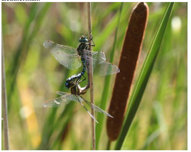
Mating pair of blue-eyed darners.