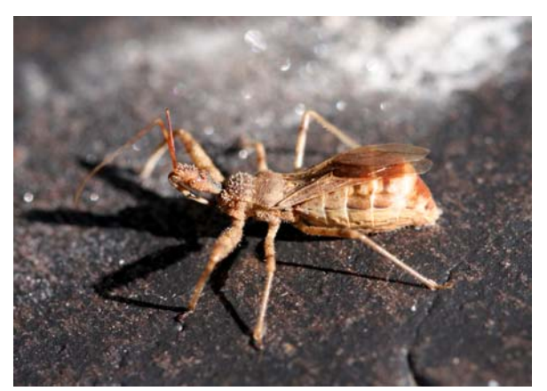
Spined assassin bug.

spp.), which may be found camouflaged among flowers in mid-late summer.