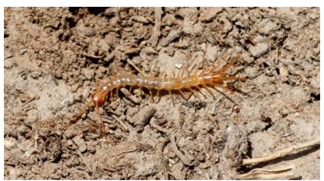
Immature stage of the common desert centipede/

Eggs of the desert centipede are laid in cavities hollowed out under a rock, in decayed wood or other sheltered sites. After egglaying, the female winds around the eggs until the young have hatched. She continues to guard them until they have molted repeatedly and dispersed. The common desert centipede is long-lived, living for 4 years or more.