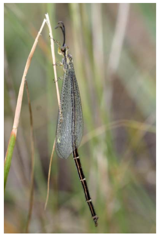
Female antlion adult, Brachynemurus sp.