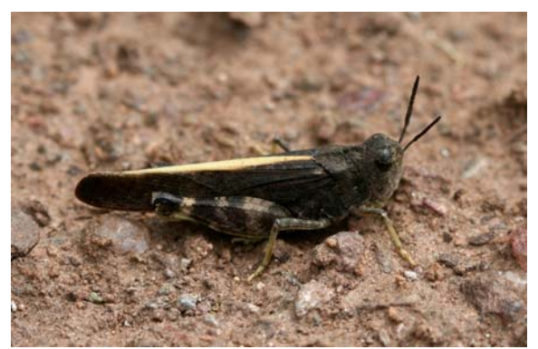
Specklewinged rangeland grasshopper ( Arphia conspersa ), a species that spends winter in the nymphal stage

plants and are found in localized patches where these plants grow.