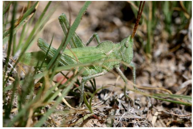
Green fool grasshopper (Acrolophitus hirtipes).

Grasshoppers lay their eggs in the soil, as small masses in the form of egg pods. Most species lay their eggs in summer and early fall, with eggs hatching the following spring. However, a few species of grasshoppers survive winter as nymphs: the velvetstriped grasshopper (Eritettix simplex), northern greenstriped grasshopper (Chortophaga viridifasciata) and specklewinged rangeland grasshopper (Arphia conspersa) are examples. In these species adults may be present in late