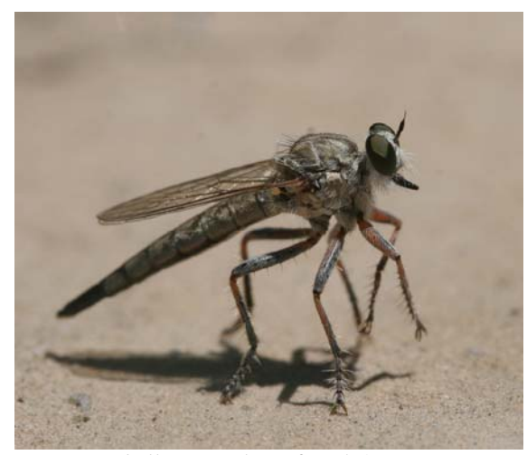
Proctacanthella cacopiloga, female/

Most robber flies are gray or brown with a very elongated abdomen. Adult robber flies are visual predators and possess large eyes. They are typically seen as