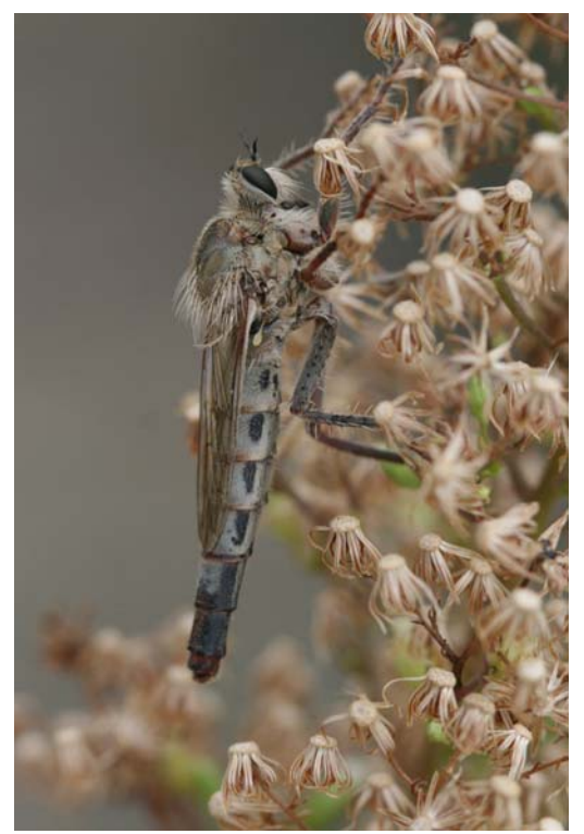
Scleropogon picticornis, female/