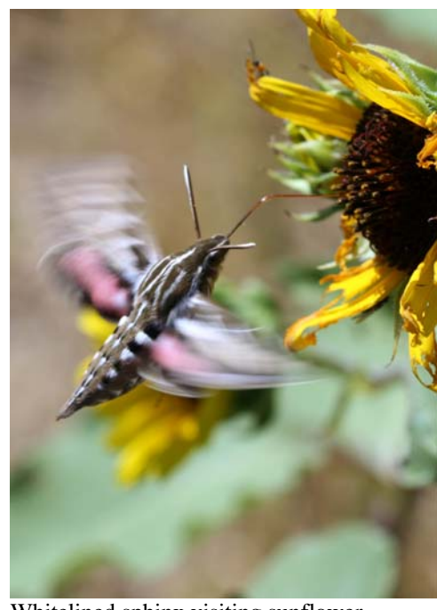
Whitelined sphinx visiting sunflower.

The caterpillar of the whitelined sphinx is highly variable in patterning; it is usually bright yellow green but some forms are bluish