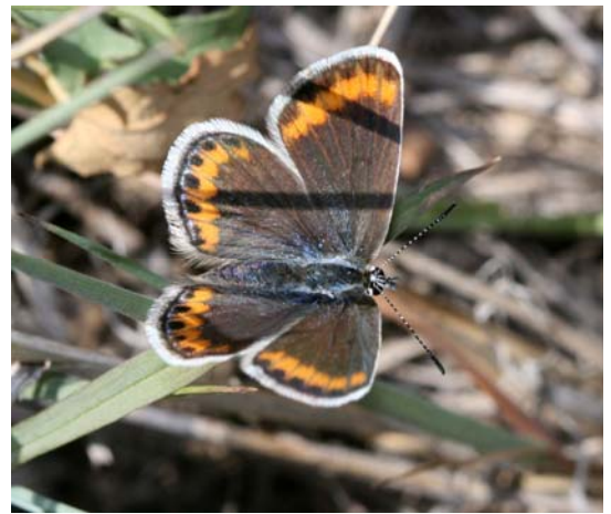
Male (top) and female (bottom) of the Melissa blue ( Plebejus melissa ), one of the most common butterflies at the Site. Larvae feed on various legumes.