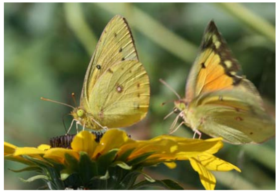
The alfalfa butterfly ( Colias eurytheme ) is the most common yellow-colored butterfly. Caterpillars feed on various legumes.