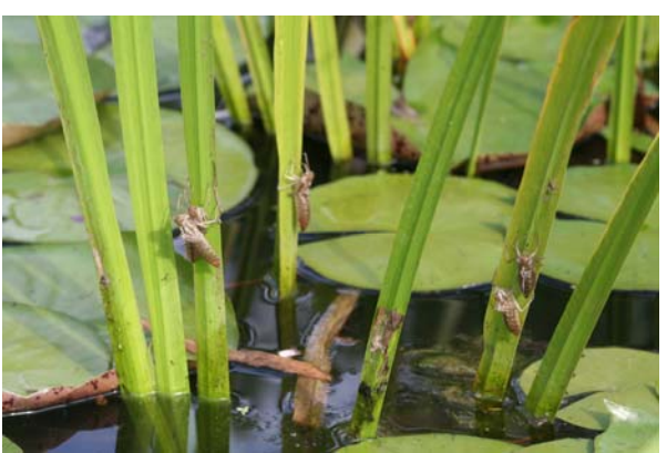
Nymphal skins of the common green darner following adult emergence.