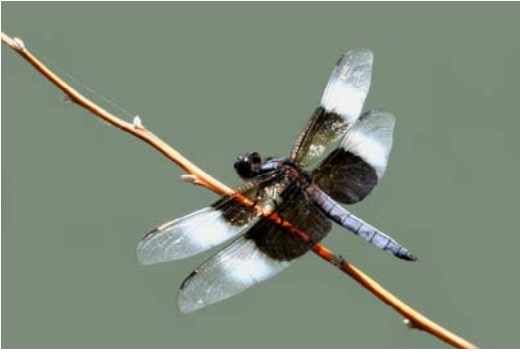
Top: Twelve-spotted skimmer. Bottom: Widow skimmer.

( Libellula composita ) is a localized species of eastern Colorado and regionally uncommon. The desert whitetail ( Plathemis subornata ) is considered a western species associated with desert alkaline pools, ponds and slow streams and its presence at the SCMHS constitutes an unusually eastern record.