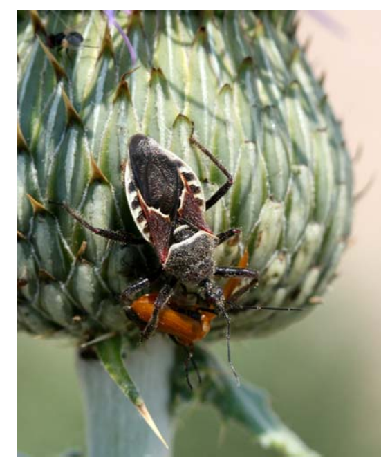
Bee assassin feeding on blister beetle.

Assassin bugs are distinguished by an elongated head, tipped with a short beak used for piercing prey. With most species the front legs are slightly more developed, modified for grasping insects. About 5 species have been recorded from the Site. In addition to the bee assassin, among the more commonly encountered is the spined assassin bug ( Sinea diadema ), a predator of caterpillars, and ambush bugs ( Phymata