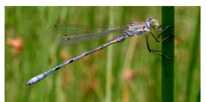
Lyre-tipped spreadwing.

A commonly noted behavior among damselflies and dragonflies involves their mating. Often damselflies are paired, with claspers at the tip of the male's abdomen grasping the female behind the head. Mating occurs when the female then curls her abdomen to contact the sperm pouch for egg fertilization ('wheel position'). However, even after mating the male typically continues to clasp the female and they fly in tandem, a practice that prevents subsequent mating.