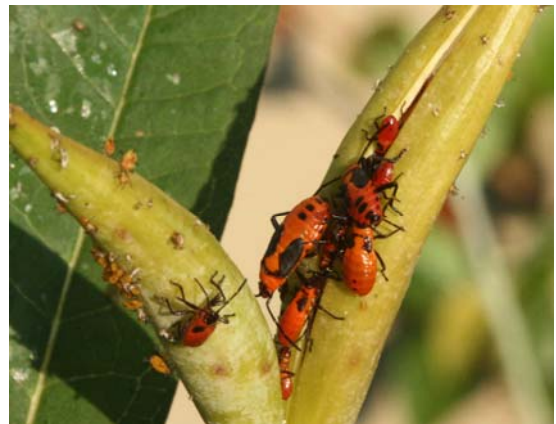
Larger milkweed bug adults (top) and nymphs (bottom).