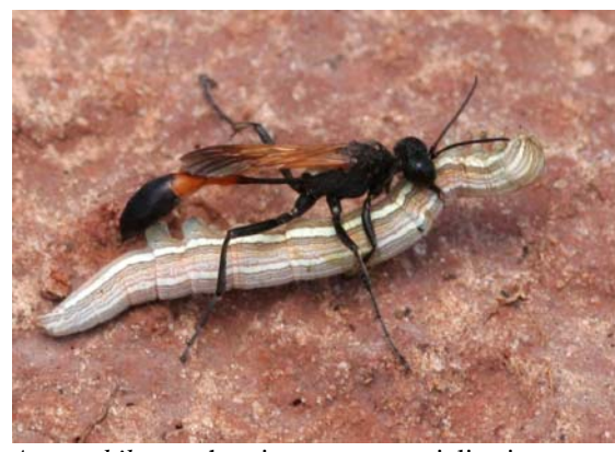
Ammophila spp. hunting wasps specialize in capture of naked caterpillars. Six species of Ammophila wasps occur at SAND.

Hunting wasps nests may be constructed in various locations. Most species nest in soil and, along with the various ground nesting