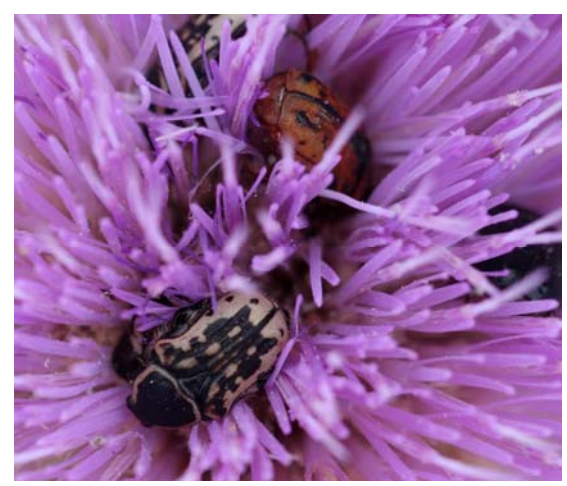
Common flower scarabs (Euphoria kernii).

Scarab beetles comprise a conspicuous component of Sand Creek Massacre National Historic Site's beetle fauna and at least 27 species are present. Adults tend to be rather large beetles, with a heavy body form. Their front legs are thick and conspicuously spiny and are used for digging Most scarabs are black or brown and are night active; many are attracted to night-time lights. Others are brightly patterned and colored, including those associated with flowers.