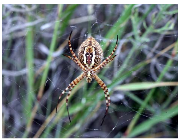
Banded garden spider, underside view/

mating in late summer the female will lay a large egg sac and dies at the end of the growing season. Overwintering occurs as the egg stage with the young spiderlings hatching and dispersing the following spring.