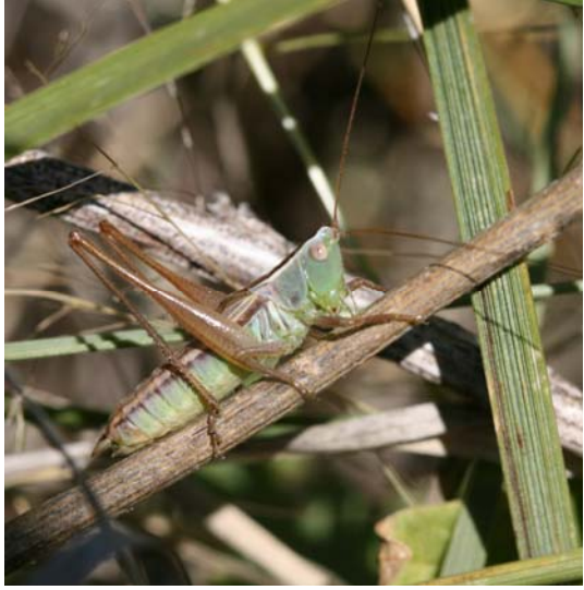
Female (top) and male (bottom) of Conocephalus katydids.