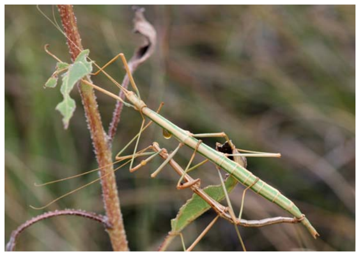
Mating pair of the prairie walkingstick. A droplet of defensive fluid is present on the prothorax of the female.

Winter is spent in the egg stage, with eggs dropped by the females during late