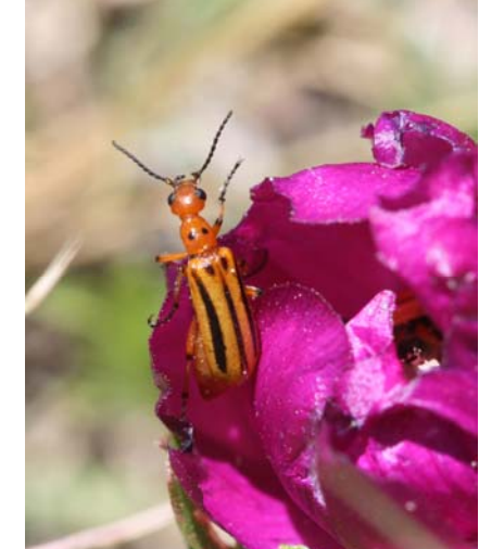
The discovery of Pyrota discoidea at the SCMHS constituted a new state record for this species.

About 14 species of blister beetles have been found on Sand Creek Massacre National Historic Site. The collection of P. discoidea at Sand Creek Massacre National Historic Site represented a new state record