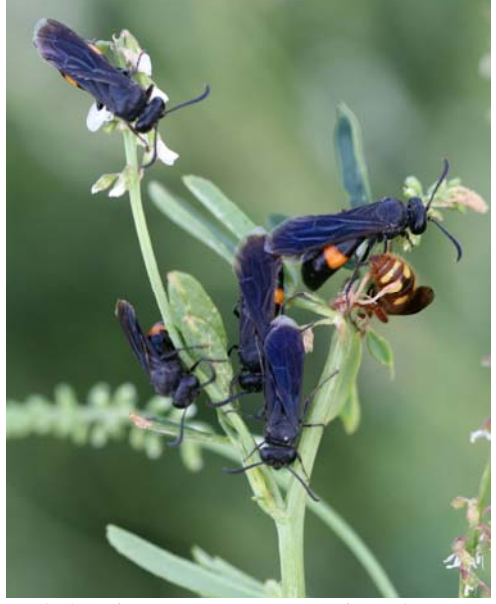
Male hunting wasps may sometimes be seen resting overnight in groups, know as a lek. This lek consists primarily of Stizoides renicinctus.