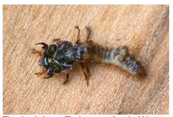
Tiger beetle larva. The larvae are found within tunnels they construct in soil and they feed on passing insects.