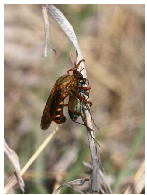
Sarcopogon combustus female feeding on tiger beetle/