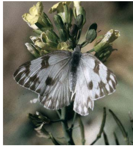
The checkered white ( Pontia protodice ). Larvae feed on various mustard family plants.