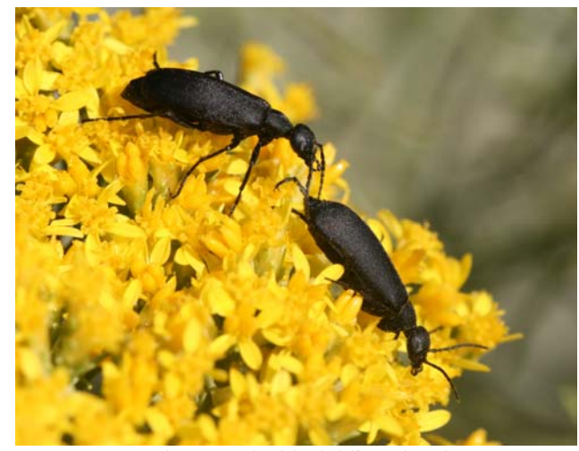
Epicauta pensylvanica, the black blister beetle.

Blister beetles are moderate to large size beetles most often seen at flowers and sometimes found feeding on leaves of legume family plants. Unlike most beetles, the wing covers of the blister beetles are relatively soft and flexible, and a wide head with a short "neck" separate them from the other common families of beetles with soft wing covers that occur at the Site - Cantharidae (soldier beetles),