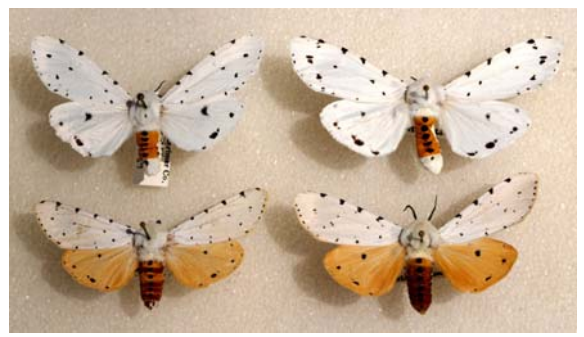
Adults of the saltmarsh caterpillar, the Acrea moth. Males are at the top, females below.

found wandering on plants or across the soil surface. They may be found almost everywhere as the caterpillars have a very wide range of host plants on which they may feed.