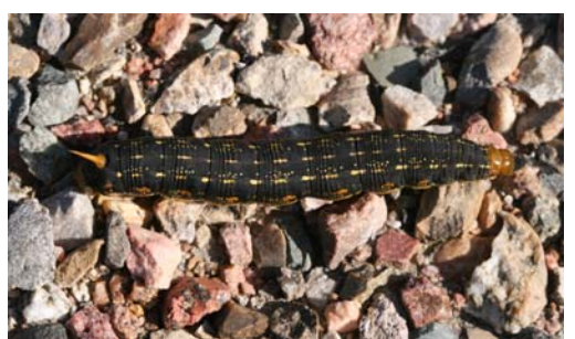
Full grown caterpillars of the whitelined sphinx showing range of coloration.

The whitelined sphinx is a member of the moth family Sphingidae, variously known as "sphinx moths" or "hawk moths" with caterpillars collectively called "hornworms". Also common at SAND is the fivespotted hawkmoth ( Manduca quinquemaculata ), the larvae of which are known as the tomato hornworm. Caterpillars of this species feed on plants in the nightshade family. Like most moths in the family, the fivespotted hawkmoth flies only at night and is not seen in the day.