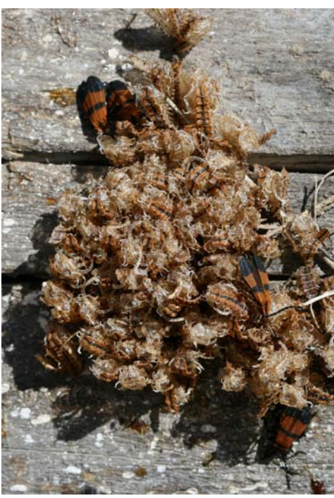
Pupal skins and adults of the netwinged beetle Calopteron reticulatus exposed under a log.

The life history of these common insects is poorly understood. The larvae are predators of other insects and occasionally my be found crawling across the soil or exposed when turning over a piece of wood.