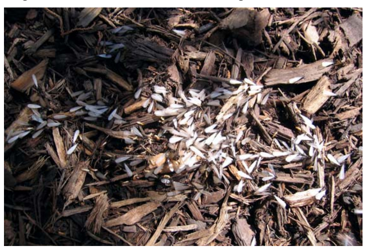
Winged stages of subterranean termites emerging for mating flight.

group will be seen with some soldier caste termites, which can be distinguished by their large brown head. Soldiers serve to guard the workers from predators, such as ants.