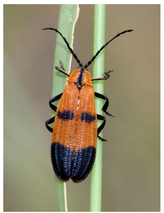
The netwinged beetle, Calopteron reticulatus.