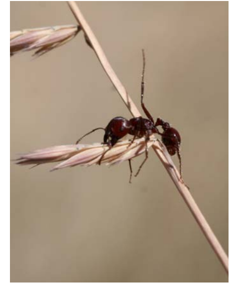
Harvester ant collecting seeds/

The harvester ant is capable of producing a very painful sting. However, the stinger is blunt and may not be able to penetrate thicker skin. The species Pogonomyrmex occidentalis is the predominant harvester ant on the Sand Creek Massacre National Historic Site. At least 7 other species of ants also are present.