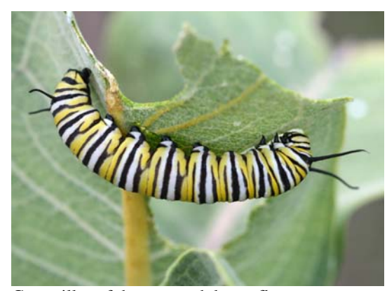
Caterpillar of the monarch butterfly.