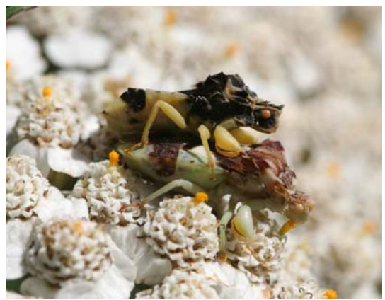
Mating pair of ambush bugs.