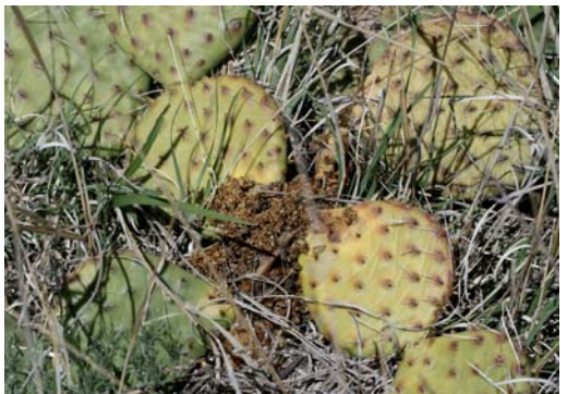
Prickly pear showing evidence of infestation by the blue cactus borer.

protected site in which to pupate. Adults are present in mid-summer and eggs are subsequently laid in the form of "egg stick" masses on the needles of the host plant.