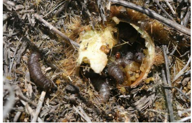
Blue cactus borer larvae at base of prickly pear.

The presence of the blue cactus borer is often indicated by the presence of yellowed, dying pads of prickly pear. These unusually colored caterpillars are a dark metallic blue. They are often found feeding in groups within the cactus pads.