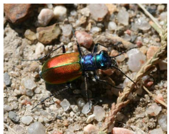
Top: Sidewalk tiger beetle. Bottom: Splendid tiger beetle.