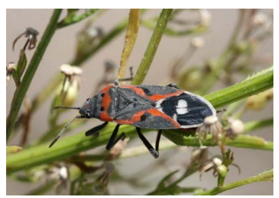
Small milkweed bug.

More widespread is the small milkweed bug ( Lygaeus kalmii ) a smaller species marked with black, red and white. Despite its common name, this insect has a very wide range of plants on which it feeds, including many of the common broadleaf weeds associated with agricultural areas of eastern Colorado.