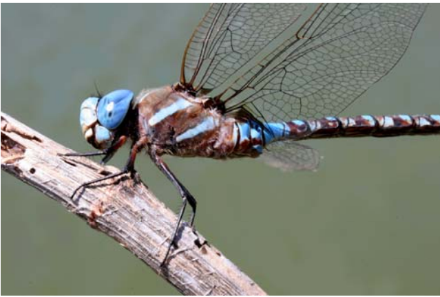
Blue-eyed darner, male.

Larvae have a streamlined body striped or spotted with green and brown. They are climbers that search for prey among the tangles of plant stems and dead plants. They typically have a life cycle that extends for more than a year, although it may be completed in a single year with warm temperatures and abundant prey.