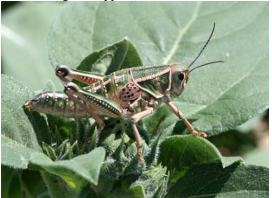
Plains lubber grasshopper (Brachystola magna).