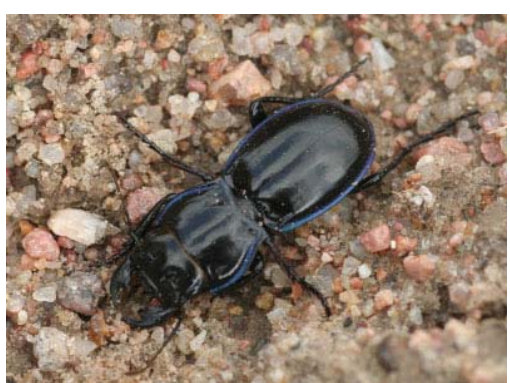
Pasimachus californicus (top); Pasimachus elongatus (bottom).