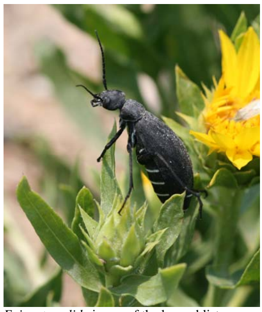
Epicauta valida is one of the larger blister beetles and is flightless.