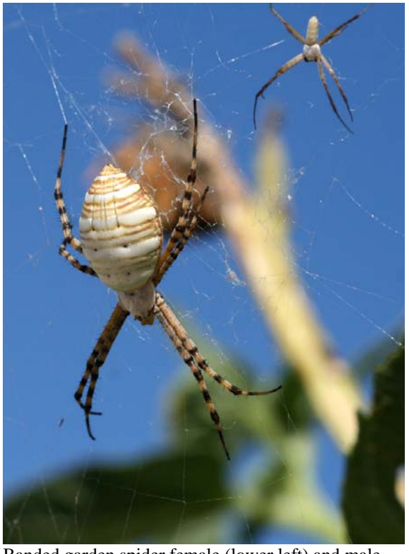
Banded garden spider female (lower left) and male (upper right)/

Males are much smaller than the females and may sometimes be found around the corners of a web. After