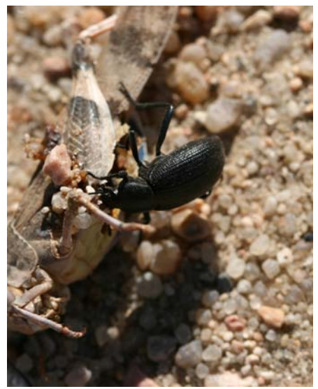
Eleodes carbonarius scavenging a dead grasshopper.

least six species locally represented. The larger species (e.g., E. hispilabris , E. suturalis ) can be greater than 2.5 cm long. However, more commonly encountered species (e.g., E. carbonarius obsoletus , E. extricatus ) are smaller. A distinctive species is E. fusiformis which has a distinctive elliptical shape.