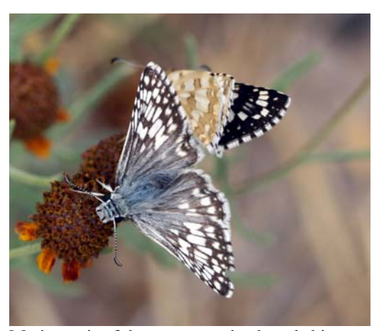
Mating pair of the common checkered skipper ( Pyrgus communis ). Larvae feed on various mallow family plants.