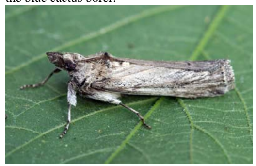
Adult of the blue cactus borer.