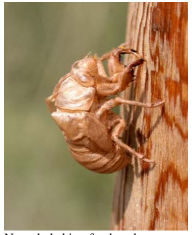
Nymphal skin of a dog-day cicada left after molting to the adult form.

Cicadas develop below ground, sucking sap from the roots of trees and shrubs. The larvae develop slowly and likely require two to five years to become full-grown. When they have finished feeding, they dig to the surface and crawl onto tree trunks, shrubs or other nearby surfaces. The winged adult then emerges through a split along the back. It is pale-colored at first and then darkens as the new exoskeleton hardens.