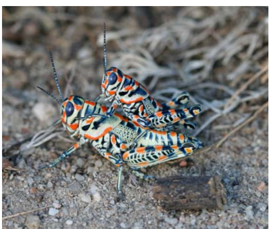
Pictured grasshopper ( Dactylotum bicolor ), mating pair.