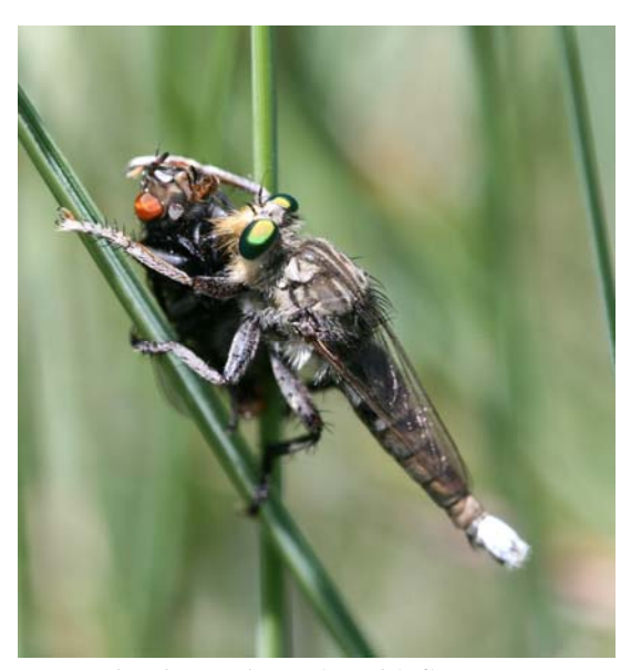
Promachus bastardii (male) with fly prey.