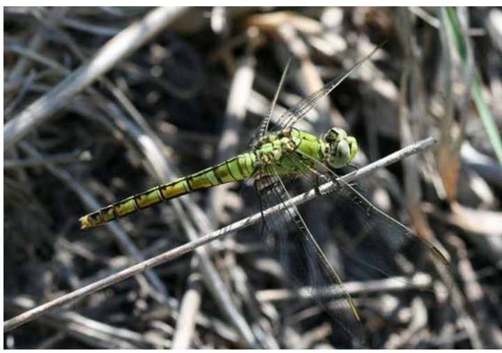
Erythemis simplicicollis, the eastern pondhawk.

( Libellula composita ) is a localized species of eastern Colorado and regionally uncommon. The desert whitetail ( Plathemis subornata ) is considered a western species associated with desert alkaline pools, ponds and slow streams and its presence at the SCMHS constitutes an unusually eastern record.