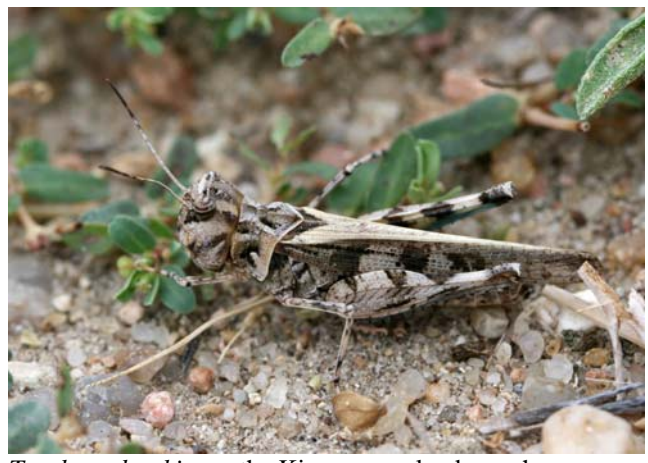
Trachyrachys kiowa, the Kiowa rangeland grasshopper.

Sand Creek Massacre National Historic Site with its varied grasslands supports a rich diversity of grasshoppers, with at least 60 species recorded. All feed on plants but each species has its own range of host plants on which it develops. Some have fairly general feeding habits and may be found widely distributed throughout the Site. Others have very specific associations with certain broadleaved