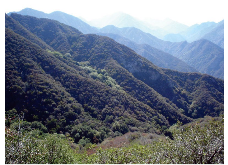
San Gabriel Mountains

٠ The San Gabriel Mountains are among the fastest growing mountains in the world. Forces from the San Andreas Fault to the north and a series of thrust faults on their south face are causing the San Gabriel Mountains to rise as much as 2 inches a year. This distinction makes the San Gabriel