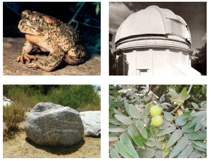
Clockwise, from top left: Arroyo Toad, U.S. Fish and Wildlife Photo; Mount Wilson Observatory; Southern California black walnut, NPS Photo; Augen gneiss boulder, western San Gabriel Mountains, NPS Photo

Data collected in the San Dimas Experimental Forest since 1933 represents some of the earliest and most comprehensive records from continuously monitored U.S. Forest Service experimental watersheds in the United States. In 1976, the United Nations Educational, Scientific and Cultural Organization's (UNESCO) Man and the Biosphere Program recognized the San Dimas Experimental Forest as a "Biosphere Reserve." The San Dimas Experimental Forest contains structures that are excellent examples of Forest Service architecture constructed and maintained through Depression-era relief programs, as well as a lysimeter facility that is the largest structure of its type ever built.