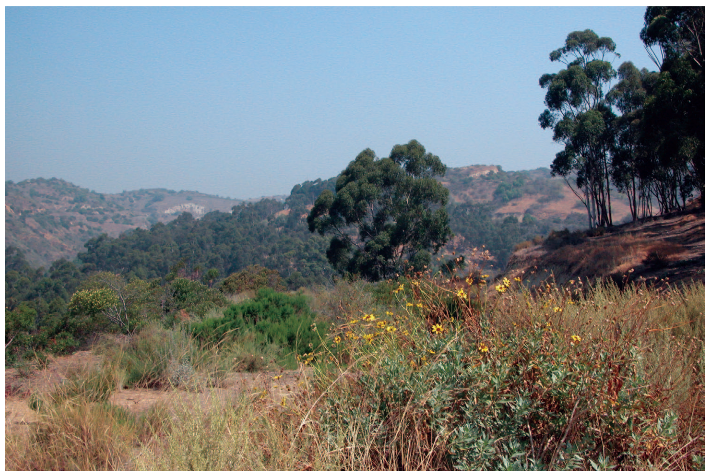
Puente Hills Habitat Preservation Authority Preserve

If Congress establishes a national park unit, the NPS would begin implementing the Congressional legislation. One of the first steps that the NPS would take would be to work with area partners on a management plan, including a broad vision for the park unit and more detailed guidance for implementation. This management plan would be completed with public involvement and appropriate environmental compliance.