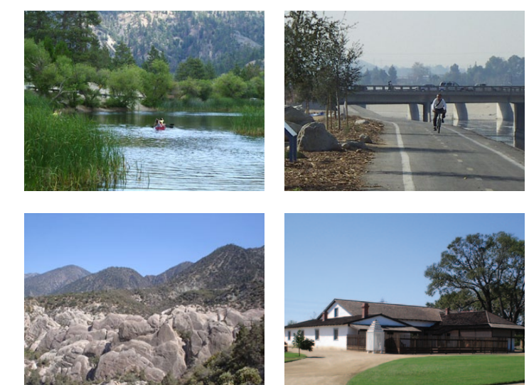
Clockwise, from top left: Jackson Lake; Lashbrook Park; Devils Punchbowl; Pio Pico State Historic Park

Use of the Service First authority would improve the customer service, effectiveness and efficiency of the NPS