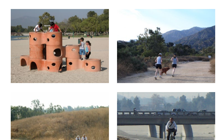
Clockwise, from top left: Santa Fe Dam Recreation Area, NPS Photo; Eaton Canyon, NPS Photo; San Gabriel River Trail, NPS Photo

The San Gabriel Mountains within the Angeles NF are also addressed in the selected alternative. However, no new designation would be applied to this area.