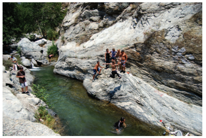
Children playing in the North Fork of the San Gabriel River

Alternative B, the San Gabriel Parks and Open Space Network, was initially presented to the public as an alternative management concept. Public review revealed a high level of dissatisfaction for this concept. Alternative B envisioned a network of public and private partners engaged in collaborative planning and information sharing, focused on open space, recreation, wildlife corridor, and interpretive opportunities. It did not include designation of a National Recreation Area. This alternative was dismissed for its inability to meet project objectives, as determined through agency and public input.