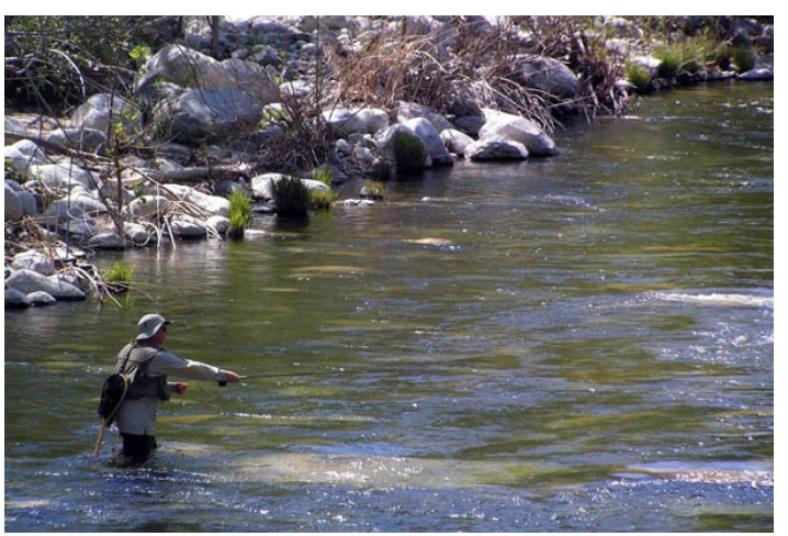
Fishing, West Fork of the San Gabriel River

The NPS would coordinate new partnerships and facilitate the development of more volunteer programs to assist in the maintenance of facilities, preservation/restoration