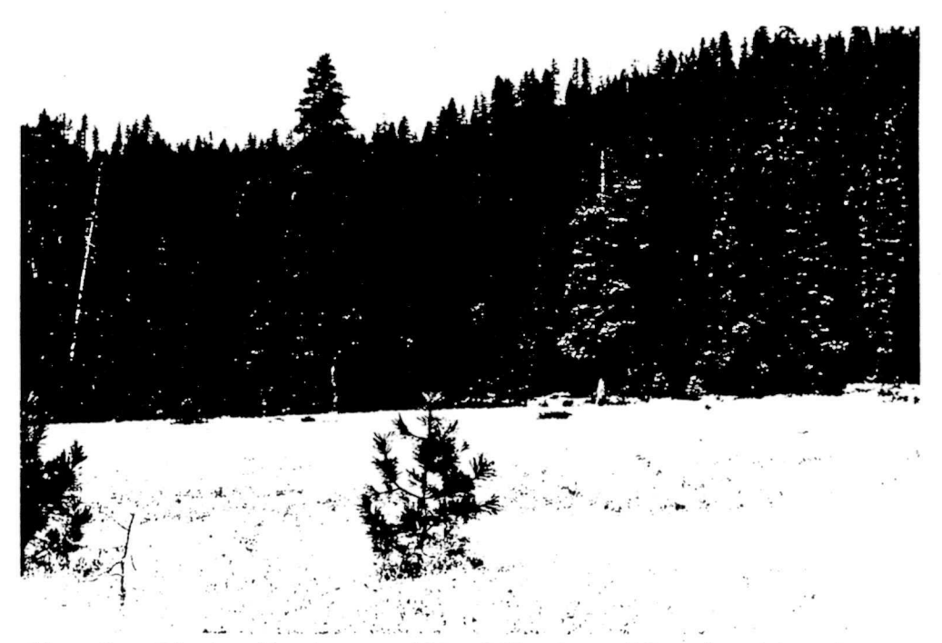
Fig. 2. Rigdon Meadows, T24S, R4E, Sec. 16. At this site Stephen and Zilphia Rigdon grazed their livestock, sold meals to travelers, and from 1871-96 logged data on users of the wagon road.