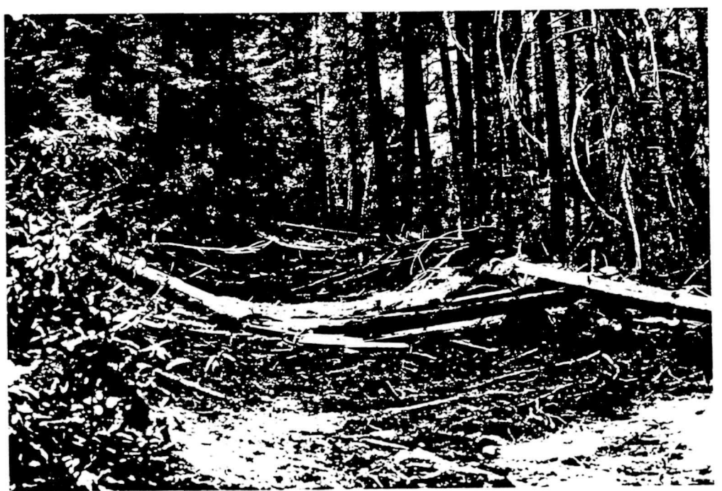
Fig. 3. A very well preserved section of the old grade of the OCMW Road ascends the western slope of the Cascades west of Beaver Marsh, T24S, R5E, Sec. 22.