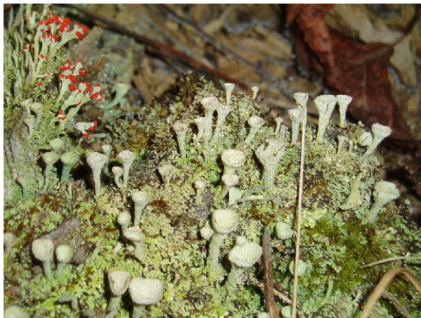
Cladonia cristatella (British Soldier) Cladonia grayi (Pixie Cup) lichens.