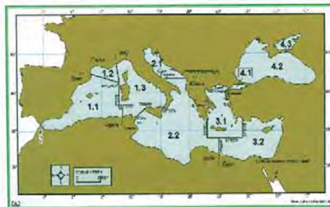
Figure 1. Map F.A.O. statistical area 37 THE BLACK SEA (V. Dumitrescu et all. 1989)

These species display an increased scientific value as many of them appear in the Red Book of the vertebrates from Romania.