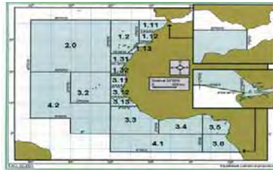
Figure 2. Map F.A.O. statistical area 34 The Eastern Central Atlantic Ocean – MAURITANIA (V. Dumitrescu, et all. 1989) Figura 2. Harta Zona statistică F.A.O. 34 Oceanul Atlantic est-central – MAURITANIA