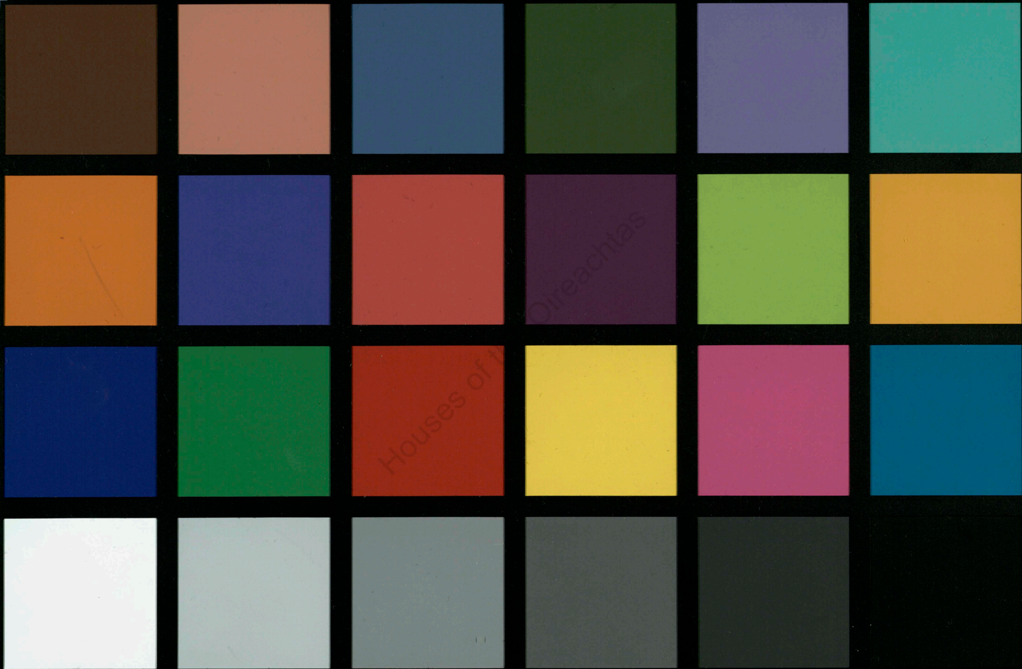
x-rite ColorChecker® Color Rendition Chart