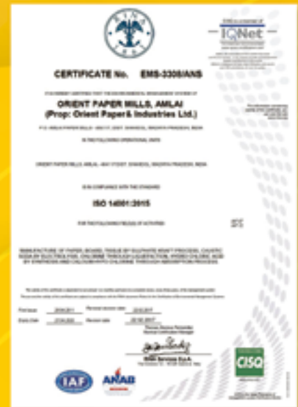
Accredited with the ISO 14001 certification for environment management system