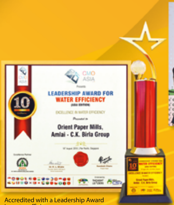
Accredited with a Leadership Award in water efficiency