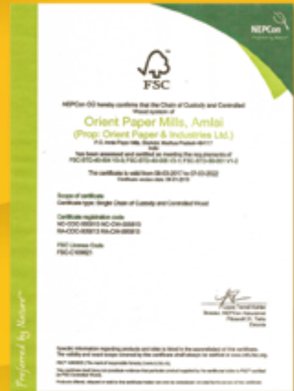
Accredited with FSC certification confirming compliance with the chain of custody and a controlled wood system