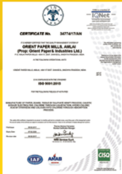
Accredited with the ISO 9001 certification for quality management system