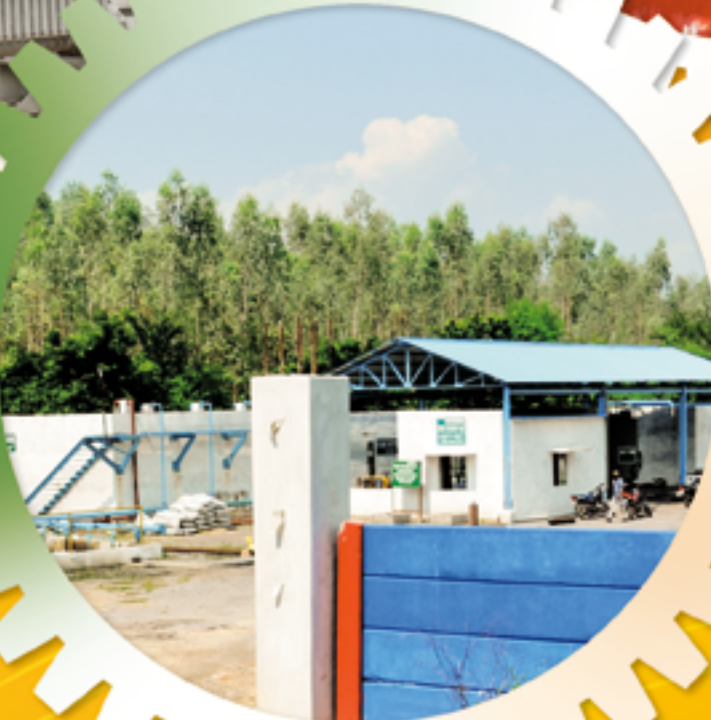
New sewage treatment plant