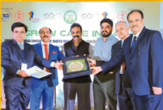
Accredited with the Growcare Environment Award