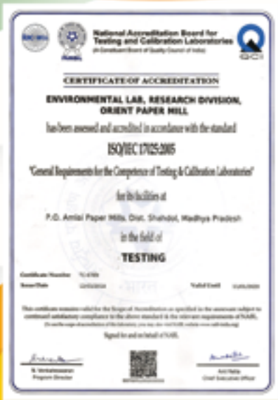
Certificate of Accreditation from NABL for our research lab

Recognitions and awards received in FY19-20 that reflect our commitment to the conservation of natural resources and adherence to the best quality standards