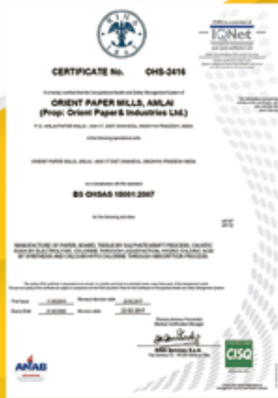
Our plant is accredited with Occupational Health and Safety Assessments Series certification