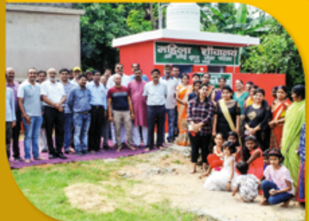
Community toilet at Sai Mandir Parisar