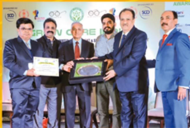
Accredited with the Growcare Water Conservation Award