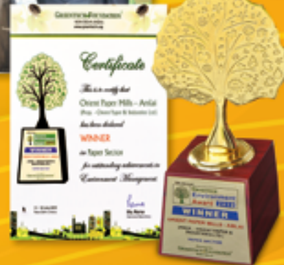
Accredited with the Greentech Environment Award