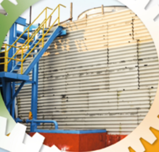
New cooling tower at the ClO2 plant