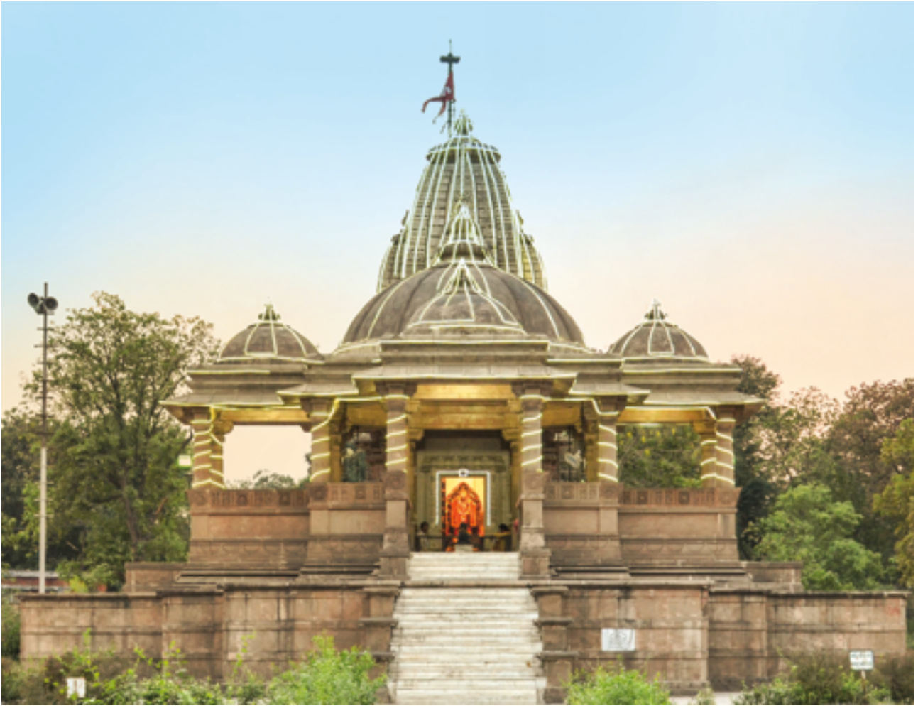
Maa Bhavtarini Temple, Amlai