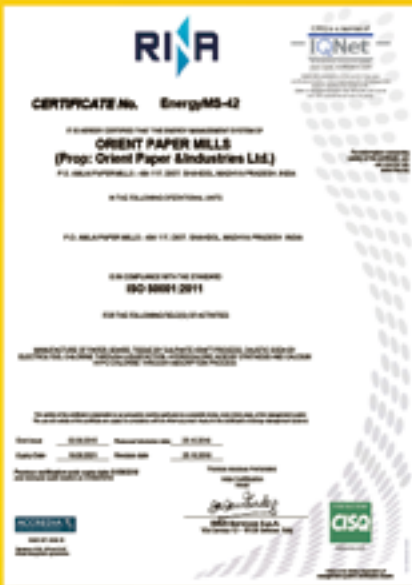
Accredited with the energy management certification for its caustic soda unit