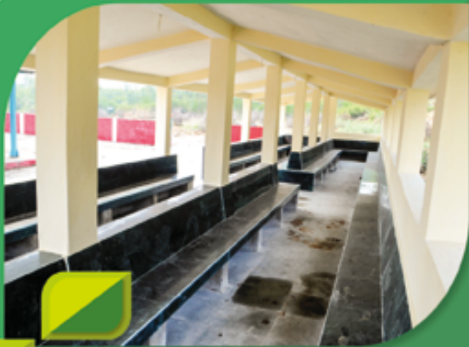
Waiting area at Mukti Dham