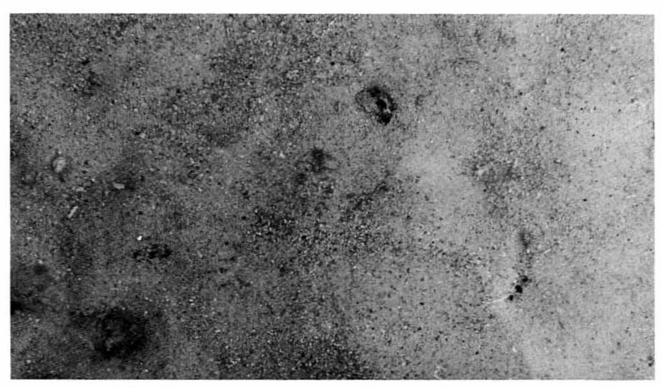
Figure 2.V.2.—Lingula reevei: several characteristic 3-hole burrow openings in sand maintained by setae for water currents.

to 5 m. A 3-hole siphonal opening formed by the valve setae is evident at the sand surface (Fig. 2.V.2). This opening is reduced to a slit when the animal retracts. In Hawaiian waters, L. reevei is recorded only from Kaneohe Bay, Oahu, where it has been found most abundantly in the southeastern part of the bay in the lower intertidal and subtidal reef flats (Emig 1978, 1981, 1984). Recently Cals and Emig (1979) reported this species from Indonesian waters.