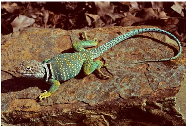
The Eastern Collared Lizard, Crotaphytus collaris , is widespread in North America, native to areas from Kansas to Mexico. Males are brightly colored during the breeding season. They eat a variety of arthropods and other lizards. Over-collection of collared lizards is a conservation concern.

skins (monitors), meat (iguanas), traditional or modern medicines (monitor fat—antibacterial; monitor oil—aphrodisiac; geckos—miracle cures), and souvenirs (stuffed horned lizards!). This is not solely an issue for other parts of the globe—large numbers of lizards or lizard products are sold in the U.S. every year, although the demand for lizards is higher elsewhere. The lack of harvest and trade regulations and difficulty in the enforcement of existing regulations exacerbate this over-exploitation problem.