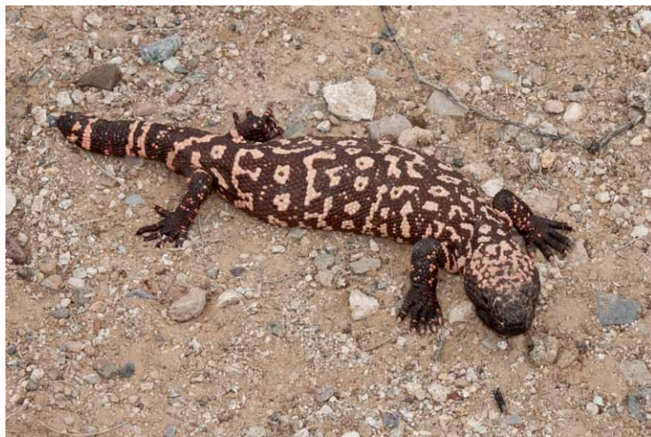
Southwest PARC members were very fortunate to see no fewer than three Gila Monsters (Heloderma suspectum) on a single field trip to Sabino Canyon near Tucson, Arizona.

a-Highway program there. A recent favorite memory came during the 2011 Southwest PARC annual meeting in Tucson. I was hosting the meeting so I wanted everything to run smoothly. Thankfully the stars lined up for our field trip to Sabino Canyon in the Santa Catalina Mountains. We scored big time and I will always remember how I treated SW PARC attendees to a three-Gila Monster day.