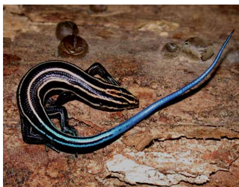
This Common Five-lined Skink, Plestiodon fasciatus, may be on the menu for your outdoor cat. Unprecedented predation rates by domestic or feral cats are key threats to many lizards.

Non-native species are competitors and predators of native lizards, with cascading effects through food-web dynamics. Forty introduced exotic lizard species occur in the southeastern U.S., mostly in Florida. Many of these have origins from the pet trade; release of non-native animals into the wild can harm native species through both food web dynamics, displacement from habitats, and disease introductions. Another non-native species concern for lizards is ants. Some invasive ants displace native ants, depleting the main food resource for horned lizards. In a 'turn of the tables', invasive Fire Ants eat lizards. Additional threats that both non-native and native predators pose to lizards are included in the next section.