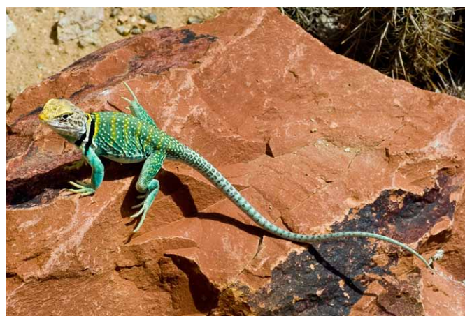
Specacuarly colored male Eastern Collared Lizards ( Crotaphytus collaris ), © Larry Jones.