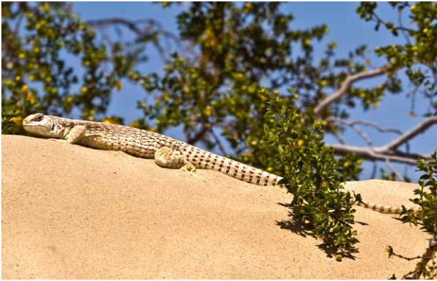
A Desert Iguana ( Dipsosaurus dorsalis), out in the mid-day heat, which it tolerates better than any other U.S. species.