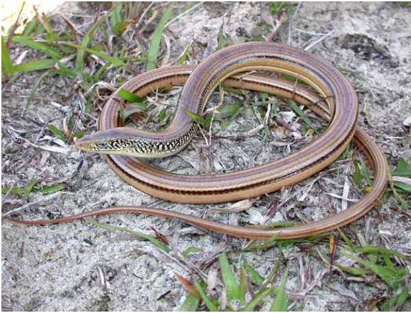
The Island Glass Lizard, Ophisaurus compressus, is US ESA-listed as a Species of Concern due to habitat loss and degradation. It is legless and occurs in sandy scrub habitats of South Carolina, Georgia and Florida.

usually live on the ground or climb up into vegetation or over rocks. In North America, physical habitat conditions are of paramount concern for many lizards. Two prime habitat elements of consideration for lizards include temperatures suitable for thermoregulation and substrates suitable for burrowing or providing spaces used for cover. Vegetation is key for providing a variety of hiding places, refugia from predators, and habitat for their prey. As these elements are altered, so are lizard habitats, and lizard survival and/or reproduction also may be affected.