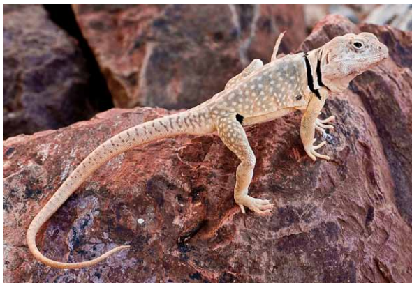
The Sonoran Collared Lizard ( C. nebris ) is much paler in color than most of its kin.

Sierra los Cucapás Collared Lizard ( C. grisei ), and Isla Ángel de la Guardia Collared Lizard ( C. insularis ). One thing that all collared lizards have in common (besides the collar) is that they are attractive, stately animals. Males are usually much more vibrant than the females, although C. nebris is rather bland for a collared lizard. Eastern Collared Lizards are the most widespread of the species, occurring over much of the U.S. and northern Mexico. Males may be bright green to bluish. However, they are outdone by the cobalt-blue color of the male Sonoran Collared Lizard. The Venerable and Reticulate collared lizards have a beautiful reticulated pattern that is quite unlike the other species (although juveniles of most species have a weakly reticulated pattern). Females of all species sport bright orange bars along the sides when gravid. Juveniles also tend to have orange bars, especially young males.