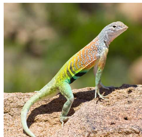
Males of the Greater Earless Lizard, Cophosaurus texanus , become brightly colored in the mating season. They do not have external ear openings, and thus appear to be earless.

Mounting evidence suggests that climate change is affecting some species. For example, in Oregon,