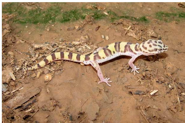
The Western Banded Gecko, Coleonyx variegatus, is nocturnal, and occurs in arid habitats of southern California, Arizona, Nevada, and Mexico.

reproductive ‘busts’ from variable spring conditions narrowing the time window of suitable breeding conditions have been reported in the Side-blotched Lizard, Uta stansburiana . In Alberta, Canada, lizard mortality has been seen with unseasonal warm weather midwinter, followed by more cold weather. Winter survival for the Greater Short-horned Lizard, Phrynosoma hernandesi , in Alberta may rely on persistent snow cover, which insulates hibernating animals from such warm spells. North temperate zones may be particularly susceptible to such year-round weather vagaries, and in North America, lizard range boundaries are coincident with areas subject to widely fluctuating weather patterns. In short, if the rate of climate change increases, lizards may be in peril. It should be noted that predicting weather patterns from climate-change trends is not straightforward, many complex factors come into play, including geographic variation in climate drivers. However the point here is that it is also not a straightforward conclusion to assume that global warming trends will create warmer habitats that will be ‘good’ for ectothermic lizards, expanding population boundaries. Nevertheless, in Spain’s Mediterranean-influenced environments, one study has found a significant northward expansion of lizard ranges between two time