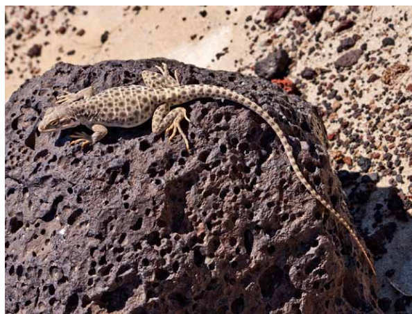
Long-nosed Leopard Lizard ( Gambelia wislizenii) basking in the sun.

Long-nosed Leopard Lizard ( Gambelia wislizenii ), Cope's Leopard Lizard ( G. copeii ), and Blunt-nosed Leopard Lizard ( G. sila ). The latter species is restricted to several valleys in central California. Cope's is endemic to the Baja California, Mexico, and a small area of adjacent southern California. The Long-nosed Leopard Lizard is much more widespread, being found in all deserts of the Southwest from Oregon to northern Mexico. All species are similarly marked, and there is little difference between the sexes, although gravid females have orange bars, as do their cousins the collared lizards. However, male Blunt-nosed Leopard Lizards have an orange blush over the entire body during the active season. Juvenile leopard lizards have red, rather than brown, spots. Leopard lizards prefer open areas of shrubs and bunchgrasses, but do not require boulders like most collared lizards. Leopard lizards are most commonly seen while basking on roadways, road berms, or while in the shade of bushes. In some areas leopard lizards are locally abundant and fairly easy to find, while in other areas they can be quite difficult to locate.