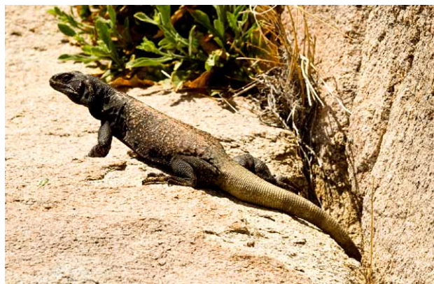
A Common Chuckwalla, Sauromalus ater .

proper care (e.g., exposure to the appropriate spectrum of light, temperature balance, vitamins, and vertebrates in the diet), so they may languish in captivity.