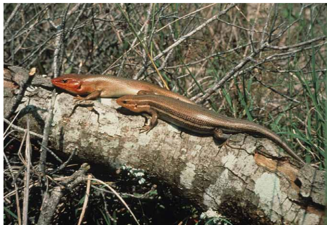
Courting Broad-headed Skinks, (Plestiodon laticeps).