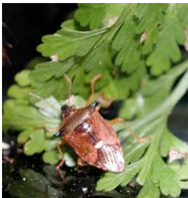
Rurutu: Oechalia new species from Amphineuron fern,

The Coleotichus new species was collected in a narrow elevational range of between 70-80 m, likely because feral ungulates are largely discouraged from gaining access to the upper plateau area by the sharp makatea limestone formation and the Dodonea maintained healthy stands in this area. The Plateau Papanai area contained one of the largest stands of Dodonea in the Austral Islands by far (J. Florence, pers. comm.), and also one of the most intact Dodonea shrublands in French Polynesia (J.Y. Meyer, pers. comm.). The size of the mixed Dodonea shrubland was estimated by J. Florence (pers. comm.) to range from 6-8 ha, with the larger and healthier fruiting plants found on the steep and shaded sides than at the dryer and flatter makatea plateau summit. Other much smaller patches such as the Dodonea plants sampled near the summit of Mt. Taatioe on 18 Nov 2003