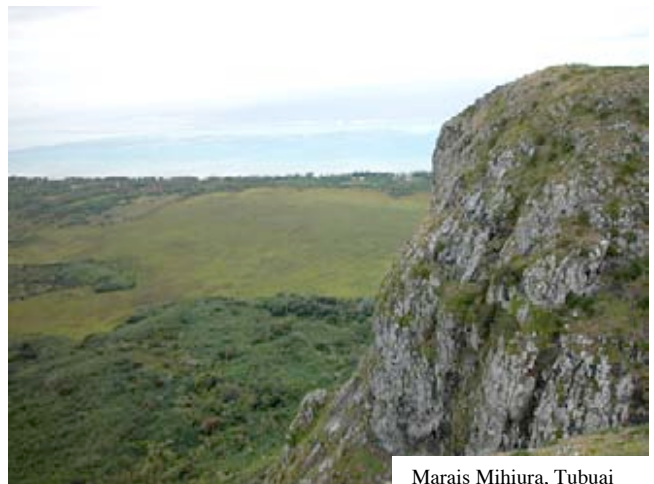
Marais Mihiura, Tubuai

The watersheds of Tubuai are relatively short and radiate out in a spoke-like arrangement from the central spine of the caldera. One of the most prominent features of Tubuai is the large wetland complex of Marais Matavahi and Marais Mihiura found on the western side of the island. These two wetlands are undoubtedly the largest in the Austral Island chain, and one of the larger wetland areas in all of French Polynesia. Small taro fields within the Marais Matavahi, near Piton Pahatu were sampled for aquatic insects, and the adjacent Marais was also briefly sampled.