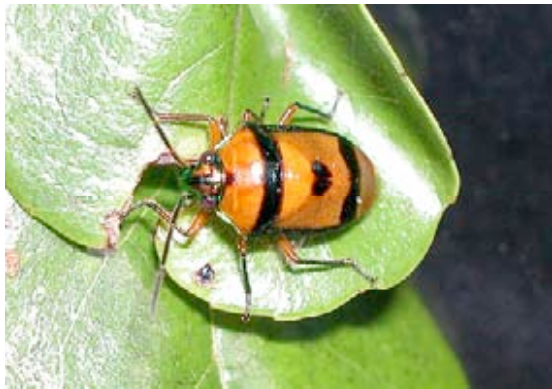
Tubuai: Catacanthus new sp. 1 from Xylosma , Mt. Tonarutu