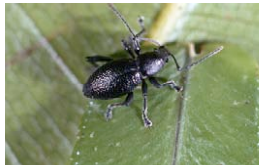
Rurutu: Rhyncogonus excavatus