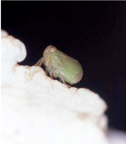
Rurutu: Atylana new sp. 1 from Cyrtandra elisabethae , Mt. Taatioe