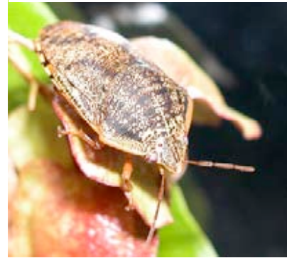
Rurutu: Coleotichus new species from Dodonea

The Coleotichus new species was collected in a narrow elevational range of between 70-80 m, likely because feral ungulates are largely discouraged from gaining access to the upper plateau area by the sharp makatea limestone formation and the Dodonea maintained healthy stands in this area. The Plateau Papanai area contained one of the largest stands of Dodonea in the Austral Islands by far (J. Florence, pers. comm.), and also one of the most intact Dodonea shrublands in French Polynesia (J.Y. Meyer, pers. comm.). The size of the mixed Dodonea shrubland was estimated by J. Florence (pers. comm.) to range from 6-8 ha, with the larger and healthier fruiting plants found on the steep and shaded sides than at the dryer and flatter makatea plateau summit. Other much smaller patches such as the Dodonea plants sampled near the summit of Mt. Taatioe on 18 Nov 2003