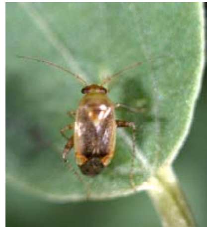
Rurutu: Miridae new sp. from Pipturus argenteus