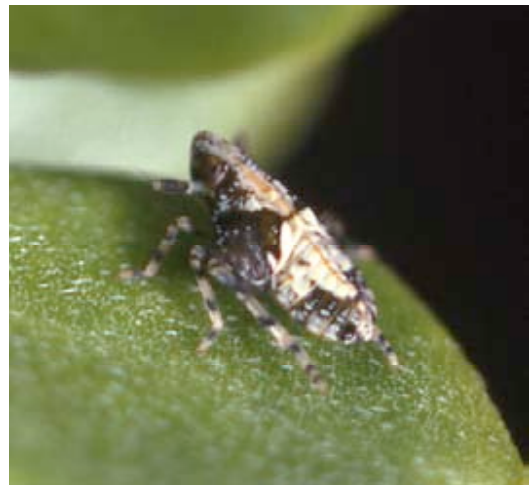
Rurutu: Delphacidae sp. 1 (immature) from Pemphis , Te Araroa sea cliffs