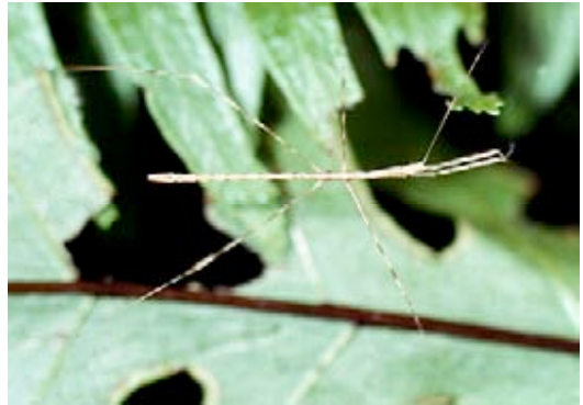
Tubuai: Emesinae new sp. 2 from Metrosideros , Mt. Taitaa