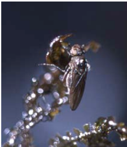
Tubuai: Scatella sp. 1, Tamatoa Stream