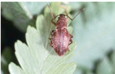
Rurutu: Rhyncogonus debilis