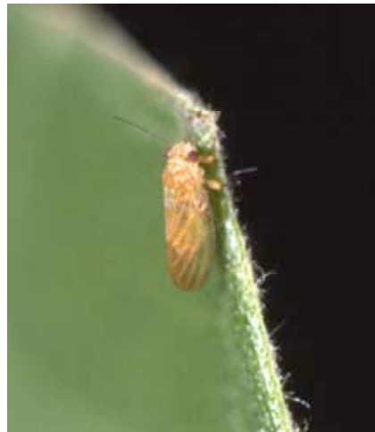
Rurutu: Psylloidea, Hemiptera from Serianthes rurutensis