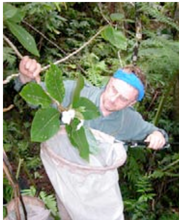
Rurutu: Sampling Cyrtandra elisabethae for issid planthoppers