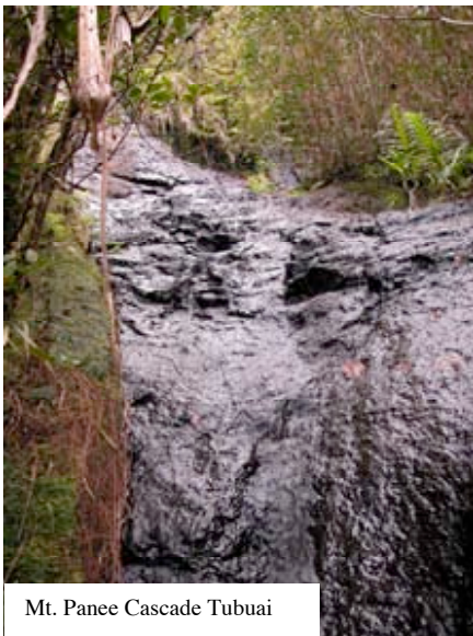
Mt. Panee Cascade Tubuai

The other major aquatic system surveyed was the area below the Mt. Panee summit, and at 250 m elevation was the highest elevation at which flowing water was found on Tubuai. Water started flowing here from a perched spring in a mixed Pandanus tectorius and strawberry guava ( Psidium cattleianum ) forest and flowed downstream over the smooth rock face to a large pool estimated at 10 x 12 m in size around 170 m elevation. Because of time constraints only 10 minutes was spent at this pool area, though several samples were collected while climbing down the steep madicolous rock wall. As this is probably the largest permanently wetted rock face area on Tubuai the area was of great biological interest for aquatic insects, and should be sampled more thoroughly in the future as number of aquatic taxa