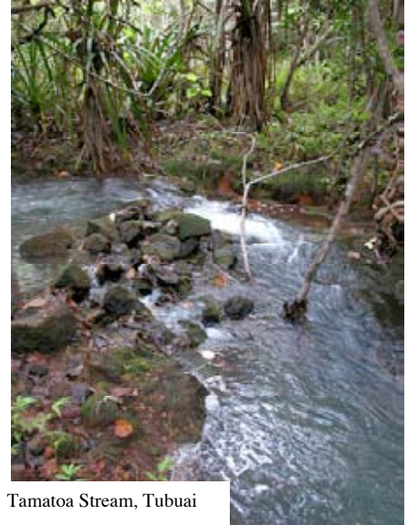
Tamatoa Stream, Tubuai

highest reaches of the Vaiapu watershed, below the summit of Mt. Panee. Tamatoa Stream was accessed near the Tamatoa Cemetery and the stream was surveyed by hiking upstream. The stream was covered with a thick growth of Hibiscus tiliaceus and Pandanus tectorius in the lowest reaches of this stream and had scattered cobbles and larger rocks, but mostly the stream flowed through soil and finer substrates. At 20 m elevation the stream channel started to pick up gradient and cobbles became more common, and small tributaries started to empty into Tamatoa Stream. Stream flow was somewhat high and the water was turbid from heavy rains the day before. At the end of the survey at around 150 m elevation a few 1-2 m high plunge pools were observed, and stream gradient began to pick up significantly.