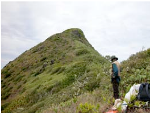
Summit area of Mt. Tonarutu, Tubuai