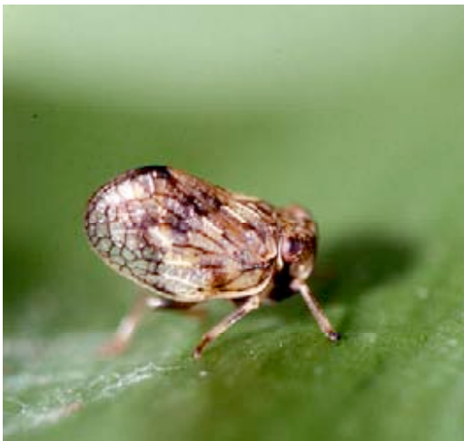
Rurutu: Atylana sp. 4 from Xylosma suaveolens , Mt. Taatioe