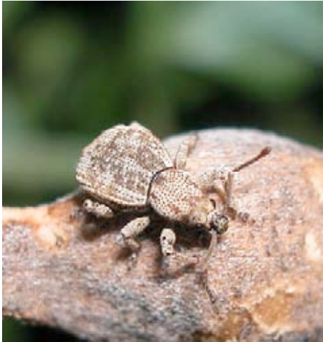
Tubuai: Curculionidae from Sophora tomentosa , Motu Tapapatauai