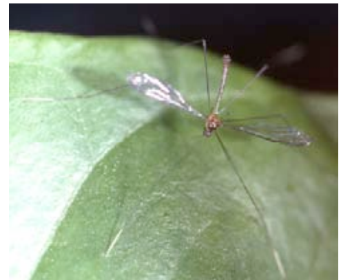
Rurutu: Tipulidae from Puputa Stream