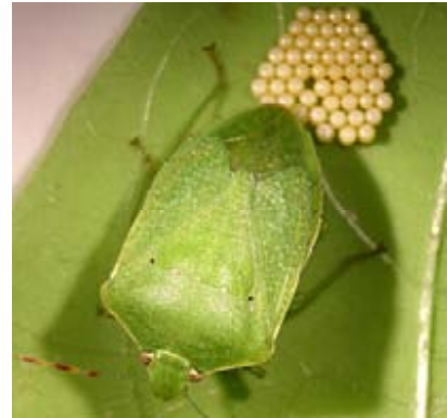
Southern green stinkbug ( Nezara viridula )

The southern green stinkbug ( Nezara viridula ) was found on Rurutu and it is unknown how long this species has been present, but this is the first capture of this species during the present Austral Island surveys. This species is one of the most serious agricultural pests in Hawai'i, and is currently responsible for yield reductions averaging 10-20% in macadamia crops, and is responsible for US$6 million dollars in yearly damages to crops in Hawai'i (Wright and Follet, in prep.). The southern green stinkbug is also a wide-ranging pest on other important vegetable and fruit crops. Strict quarantine laws would need to be actively enforced to prevent this highly injurious pest from spreading to other islands in French Polynesia.