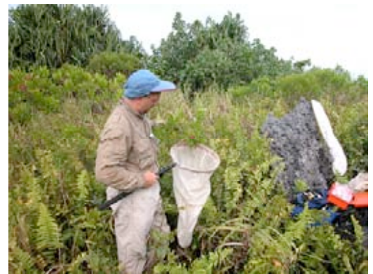
Rurutu: Plateau Papanai makatea area where large Dodonea stand was found