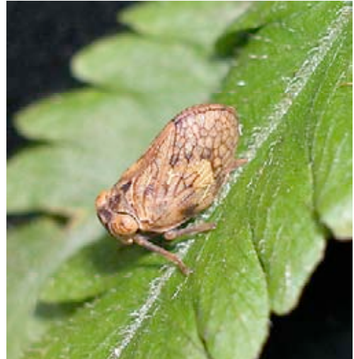
Rurutu: Atylana sp. 2 from Guettardia speciosa , Plateau Paparai