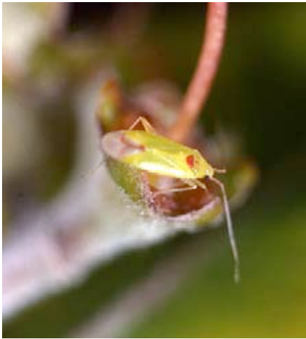
Rurutu: Miridae new sp. from Metrosideros , Mt. Taatioe