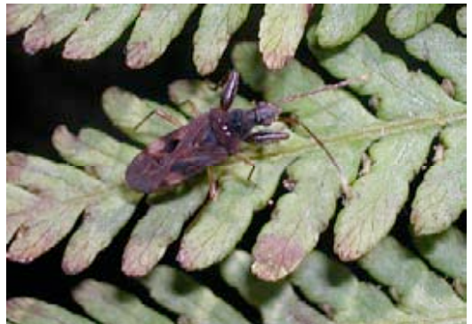
Tubuai: Rhyparochromidae Gen sp. 1 from Metrosideros , Piton Pahatu