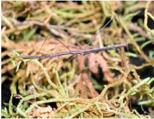
Tubuai: Emesinae new sp. 1 from Metrosideros , Mt. Taitaa