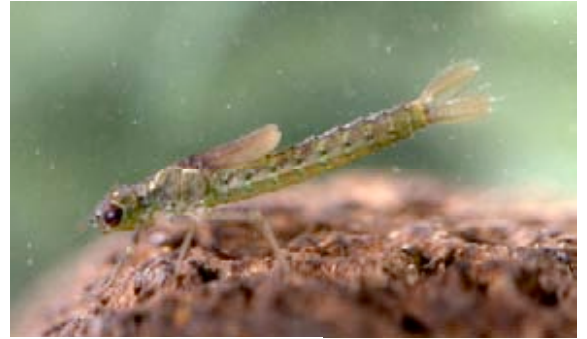
Rurutu: Ischnura new species adult (left) and larva (right), Puputa Stream