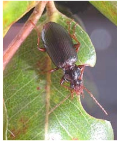
Tubuai: Metacolpodes new sp. Mt. Tavaetu, Metrosideros