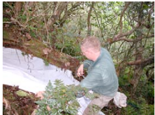
Canopy fogging Metrosideros forest at Mt. Tavaetu, Tubuai