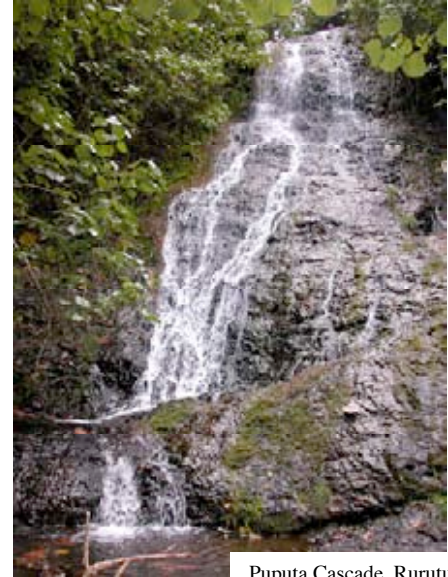
Puputa Cascade, Rurutu

Puputa Stream, flowing behind the main village of Moerai was the largest stream on Rurutu and was diverted for domestic supplies, (as were all streams on Rurutu) at an elevation of 64 m. Water temperature above the captage (diversion) was recorded at a cool 20.5°C. The stream flowed for an estimated 400-500 m above the captage before the largest waterfall observed on Rurutu was encountered at 82 m elevation. The free-flowing Puputa Stream in this area was heavily shaded mainly by Hibiscus tiliaceus and Pandanus tectorius and was relatively high gradient with ample riffle habitats and excellent water clarity. Puputa Stream was sampled intensively for aquatic biota on 23 Nov and 27 Nov 2003. Other high quality stream habitats sampled on Rurutu included smaller Uatoa Stream that fed the taro fields of Pupuhi Village.