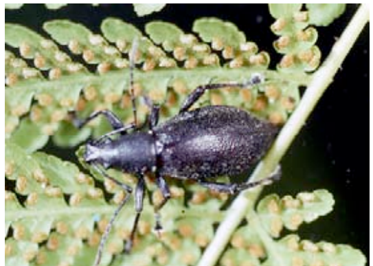
Tubuai: Rhyncogonus longulus from ferns, upper Tamatoa Valley, 240 m