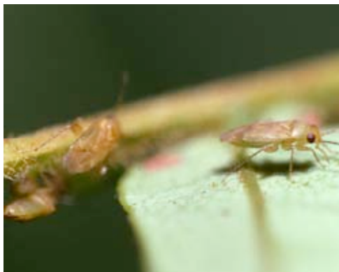
Rurutu: Miridae new sp. from Serianthes rurutensis