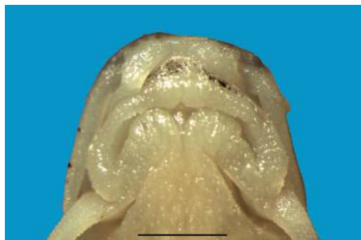
Fig. 6. Schistura pavensis , ZRC 53776, holotype, 31.3 mm SL; mouth. Scale bar 1 mm.