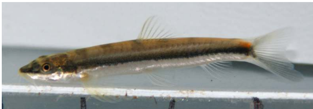
Fig. 1. Schistura rubrimaculata ; ZRC 53774, paratype, 26.1 mm SL; Myanmar: Magway division: stream Man Chaung; shortly after capture. Right side, reversed.