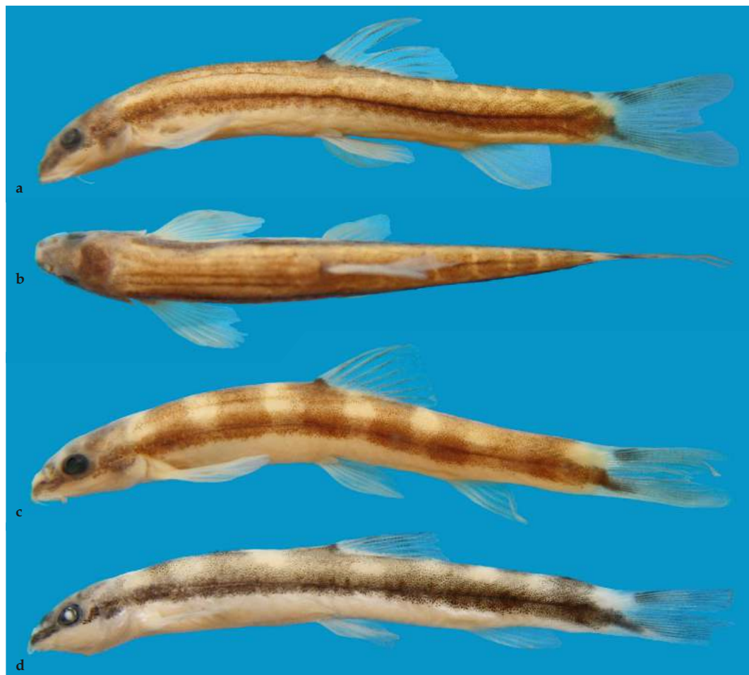
Fig. 5. Schistura pavensis , Myanmar: Shan State: Hsipaw. a- b, ZRC 53776, holotype, 31.3 mm SL; c, ZRC 53777, paratype, 25.7 mmSL; d, IAPG A5901, paratype, 25.4 mm SL.