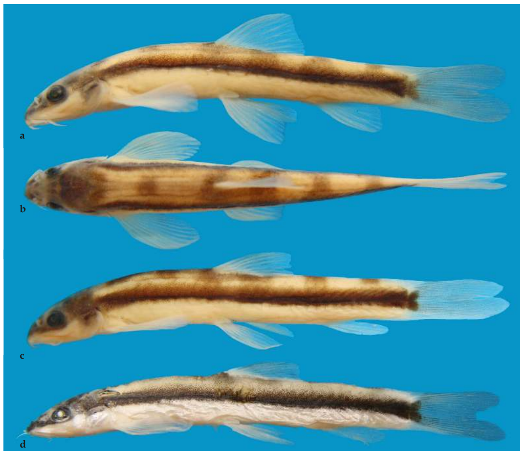
Fig. 2. Schistura rubrimaculata ; Myanmar: Magway division: stream Man chaung. a- b, ZRC 53773, holotype, 26.2 mm SL; c, ZRC 53774, paratype, 26.9 mmSL; d, IAPG A5904, paratype, 27.2 mm SL.