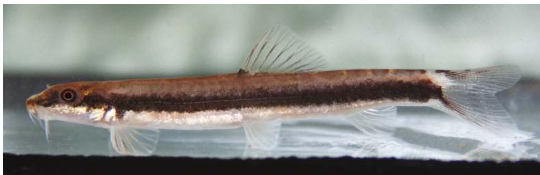
Fig. 4. Schistura pawensis ; ZRC 53776, holotype, 31.3 mm SL; Myanmar: Shan State: Hsipaw; shortly after capture. Right side, reversed.

1964). These character states are observed in T. kosswigi as well as in an undescribed species from Iran, but the third known species, T. himalaya , has small scales on the posterior part of the body, the origin of the pelvic fin slightly before or under dorsal-fin origin and the lateral line reaching until end of dorsal-fin base (Convay et al., 2011). Schistura rubrimaculata differs from all three species of Turcinoemacheilus by having the anus about one eye diameter in front of anal-fin origin, a complete lateral line, the posterior margin of the caudal forked, the origin of the pelvic fin behind dorsal-fin origin and by the presence of a suborbital flap in adult males (vs. absence). Schistura rubrimaculata further differs from T. kosswigi and the undescribed species by having the posterior part of the body covered by scales and from T. himalaya by the black midlateral stripe (vs. dark bars or mottling along body sides).