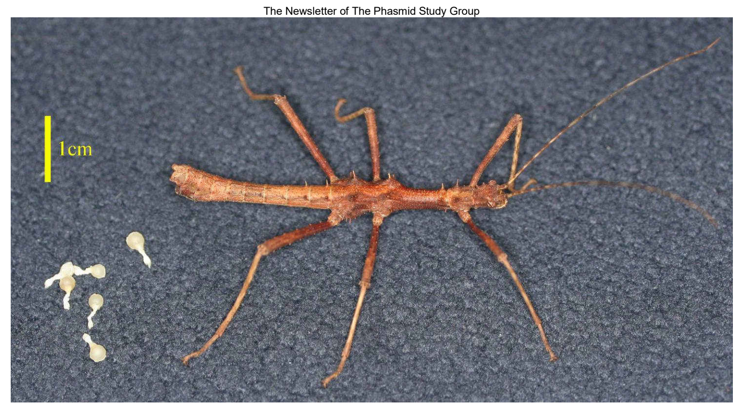
Male Brasidas foveolatus with spermatophores.