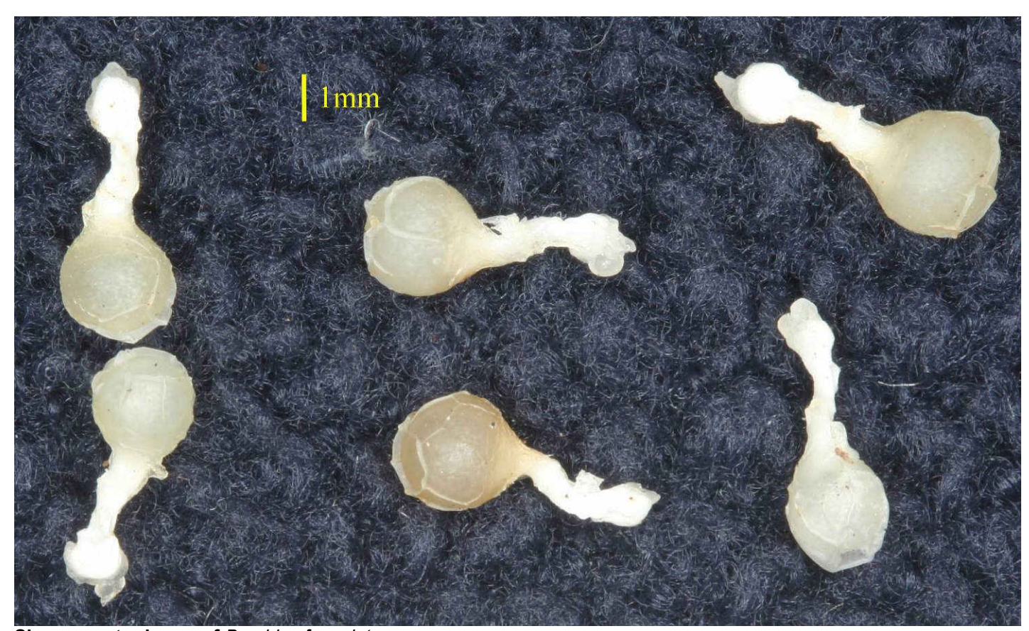
Six spermatophores of Brasidas foveolatus.