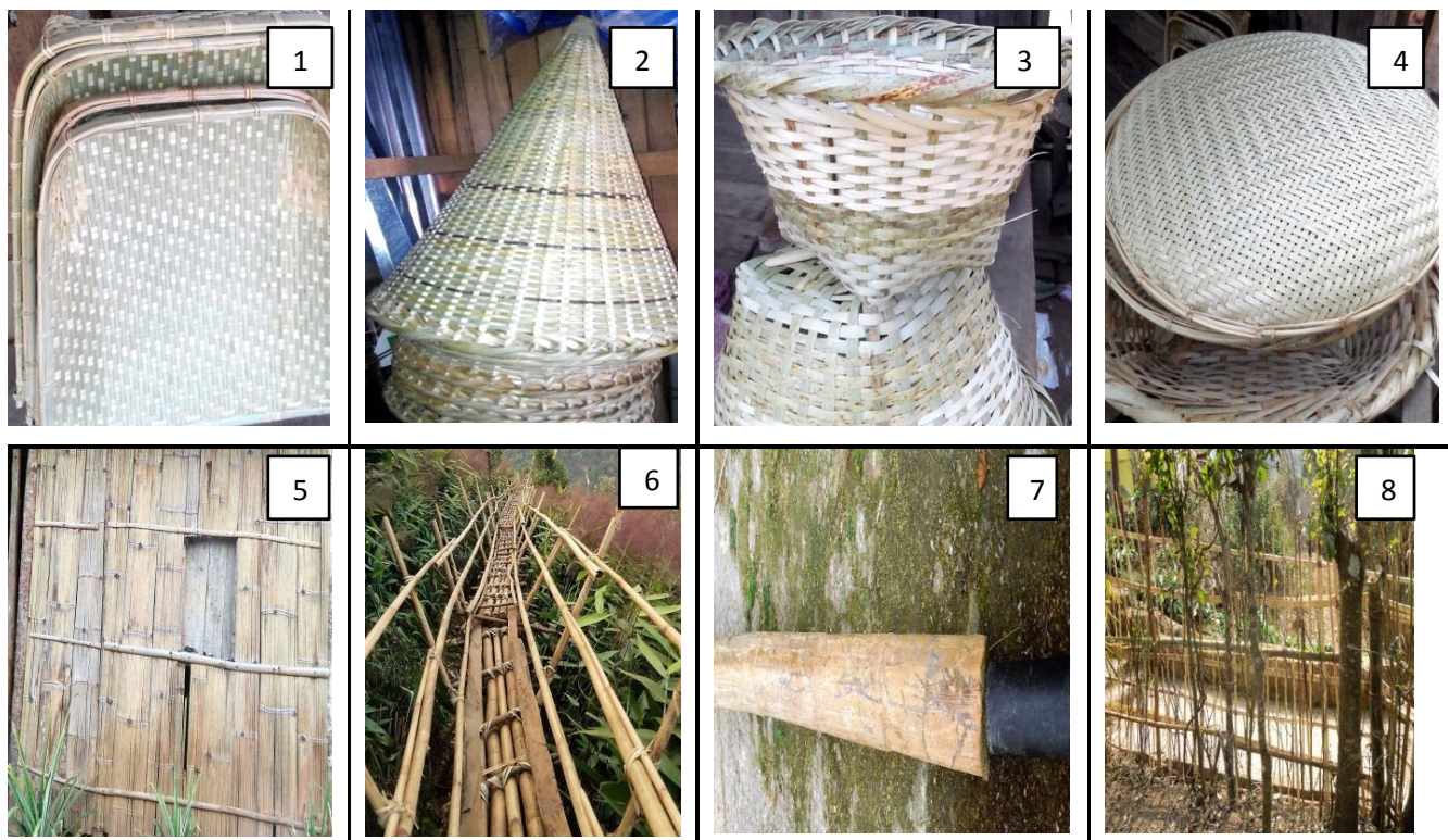
Fig. 3: Bamboo used for various purposes: 1. Winnowing tray 2. Basket 3. Small basket 4. Round winnowing tray 5. Bamboo house 6. Bamboo ladder 7. Water pipe 8. Fencing bamboo.