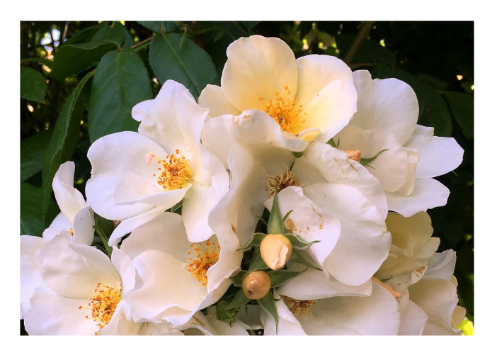
'Sally Holmes' PNW District Photo Contest, 2016 First Place, Class 6, Amateur Division