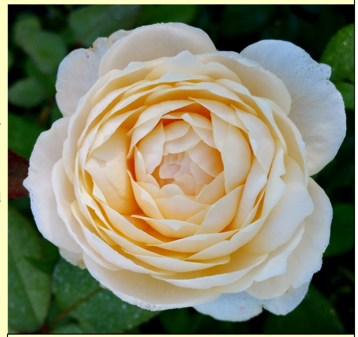
'Crocus Rose' Photo by Karine Haman PNW District Photo Contest, 2016

4. The English Alba Hybrids——These roses have the lightness and grace of the wild roses. The bushes are tall with an open growth habit, often with blue leaves like their forebears, the Albas. They are predominately pink. Some roses in this group are: 'Windflower', 'Ann', Scarborough Fair', 'Cordelia' .