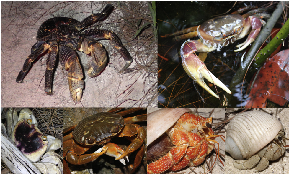
Fig. 3. Terrestrial Decapoda found at Juan de Nova Island, from left to right and top to bottom: Birgus latro, Cardisoma carnifex , Geograpsus grayi , G. crinipes , Coenobita perlatus , C. rugosus .

The distinction of sand and hard bottoms of the reef flat (Fig. 1) is a simplified approach to classify the habitats occupied by the crustaceans. In the field the two habitats were sometimes found on a single reef flat station for example at st. 15 where two species