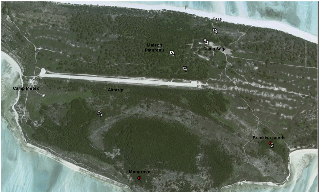
Fig. 4. Places of observation of the coconut crab ( Birgus latro ) at Juan de Nova in 2011 and 2013 (squares 3–7) and of the land crab ( Cardisoma carnifex ) during BIORECIE 3 (circles: 1, mangrove; 2, brackish ponds). These places can be displayed using Google Earth and kmz file at http://doi.pangaea.de/10.1594/PANGAEA.836272 .

typical of sand bottoms ( Ashtoret lunaris , Parascytoleptus tridens ) were found in small sand areas in between coral bommies. In comparison of this simplified approach not less than 36 distinct reef flat micro-habitats were considered for sessile species such as algae or hydrozoans.