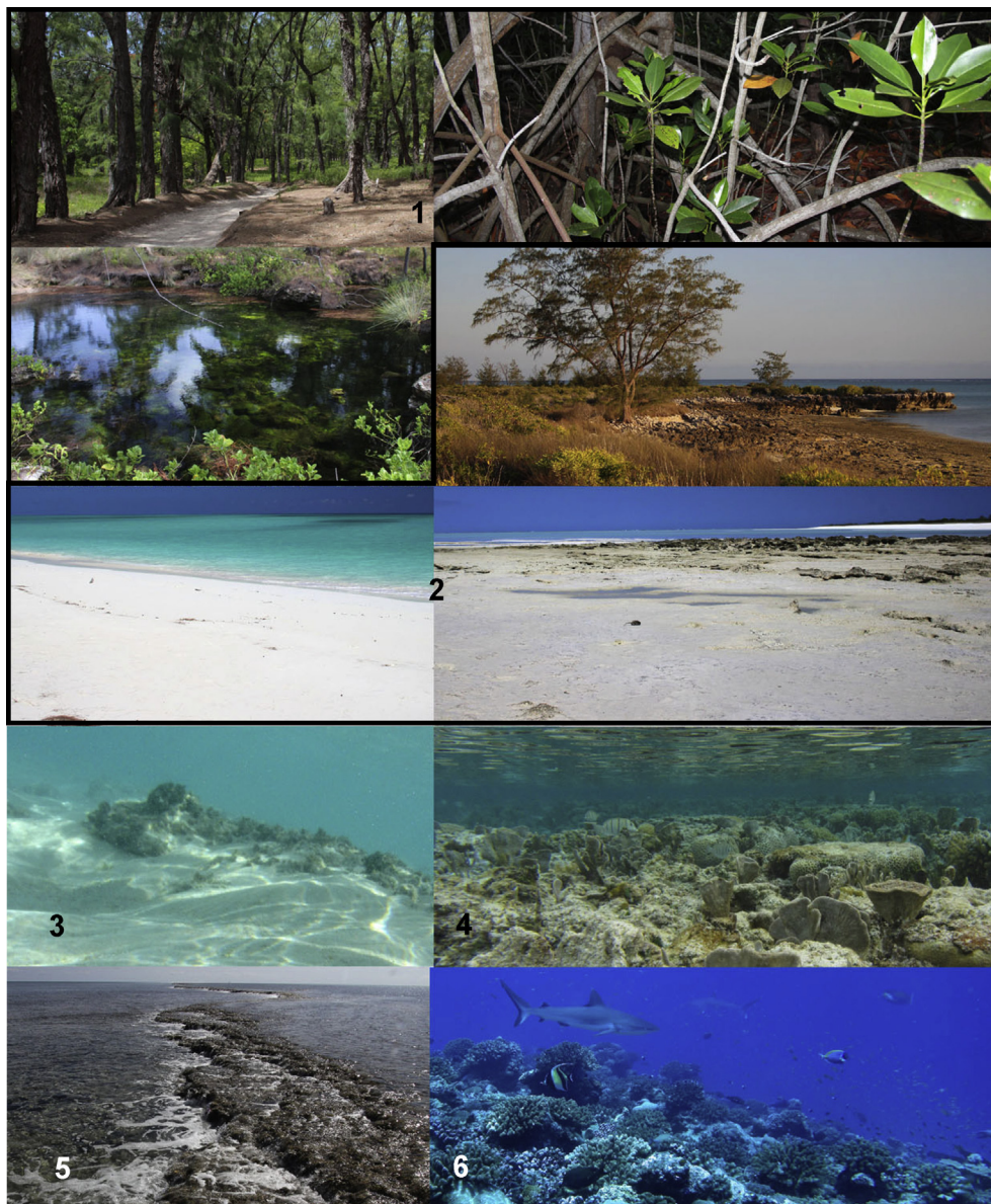
Fig. 2. Key habitats identified at Juan de Nova for the Crustacea (Decapoda, Stomatopoda). From top to bottom and left to right: 1) Terrestrial: forest with sparse filao trees ( Casuarina equisetifolia ); mangrove trees ( Rhizophora mucronata ) in the small mangrove (n°1 of Fig. 4); brackish water pond in karstic area near mangrove. 2) Supra littoral and intertidal: herbaceous coverage and rocks in supra littoral; fine sand beach of the intertidal; dead corals, coral slab, and fine sandy-muddy sediment in between, at st. 20. 3) Sand bottom of the reef flat at st. 4. 4) Hard bottom of the reef flat at st. 8. 5) Reef front at st. 19. 6) Outer reef, at st. 31.