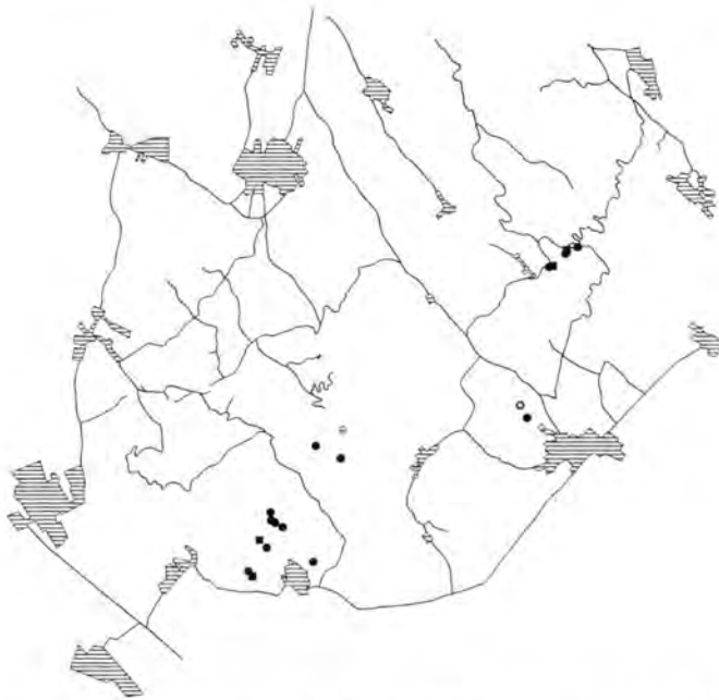
Fig. 4. Distribution of Myurella julacea (Schwägr.) Schimp. in the Vértes Mts (original).