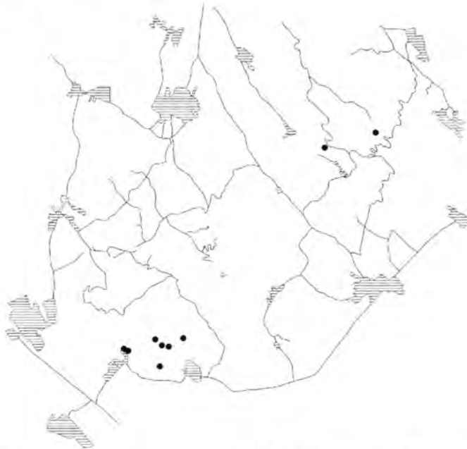
Fig. 2. Distribution of Anomodon rostratus (Hedw.) Schimp. in the Vértes Mts (original).

New records of occurrence: Csákberény : Gémfőrtés-völgy (22.05.2005, 47° 21' 14.4" N, 18° 18' 08.4" E, alt. ca 350 m); Kőkapu-völgy (leg. Z. Barina, Cs. Németh, D. Pifkó, D. Schmidt, 25.09.2005, 47° 22' 02.8" N, 18° 17' 55.1" E, alt. ca 390 m); (19.02.2006, 47° 2' 52.2" N, 18° 18' 13.4" E, alt. ca 360 m); Meszes-völgyi-lyuk (16.04.2005, 47° 21' 49.8" N, 18° 18' 32.1" E, alt. ca 369 m); Ugró-völgy (leg. P. Erzberger, 29.04.2001 (PAPP and ERZBERGER 2003)); Csókakő : Kőlyuk-völgy (11.03.2006, 47° 21' 42.3" N, 18° 16' 43.3" E, alt. ca 355 m); Gánt (Vérteskozma): Fillér-árok és a Kápolna-völgy találkozási pontja (06.08.2005, 47° 27' 52.8" N, 18° 25' 26.5" E, alt. ca 346 m); Szár : Holdvilág-árok (30.04.2005, 47° 28' 20.2" N, 18° 27' 42.6" E, alt. ca 308 m).