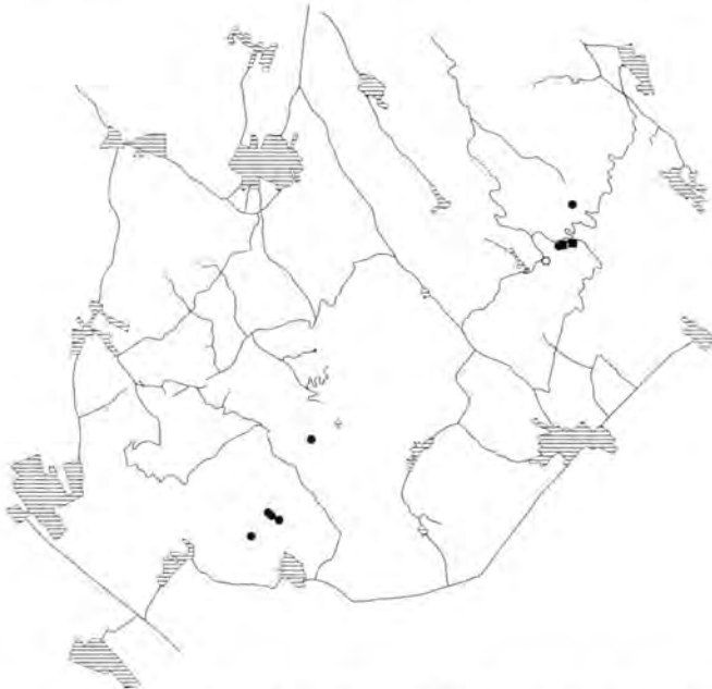
Fig. 3. Distribution of Leiocolea collaris (Nees) Schljakov in the Vértes Mts (original).

New records of occurrence: Csákberény : Kőkapu-völgy (25.03.2006, 47° 21' 45.8" N, 18° 18' 24.3" E, alt. ca 369 m); Ugró-völgy (10.09.2005, 47° 22' 13.3" N, 18° 18' 53.5" E, alt. ca 392 m); (10.09.2005, 47° 22' 14.5" N, 18° 18' 52.1" E, alt. ca 371 m); Ugró-völgy (Szentegyházi-hegy) (21.05.2005 47° 22' 05.0" N, 18° 19' 12.9" E, alt. ca 365 m); Ugró-völgyi-lyuk