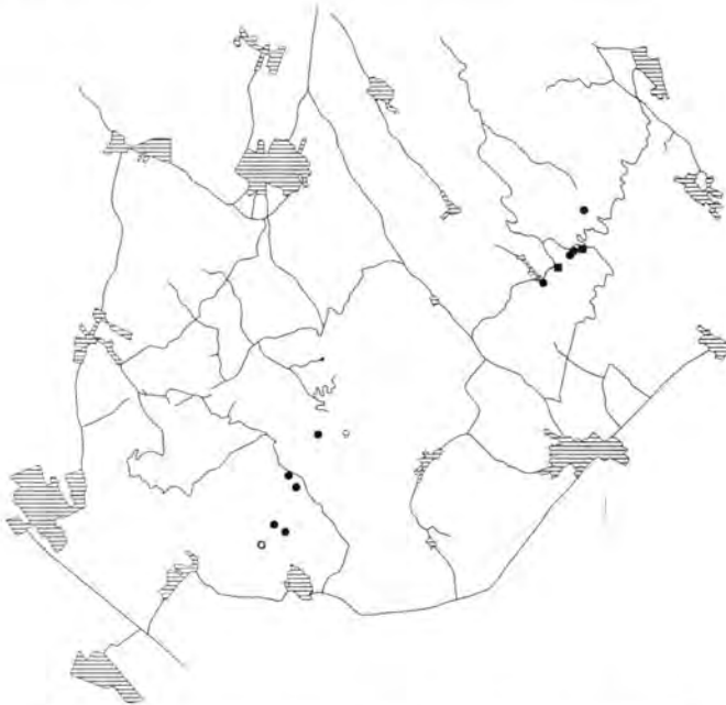
Fig. 7. Distribution of Plagiobryum zierii (Hedw.) Lindb. in the Vértes Mts (original).

Not confirmed occurrence from herbarium specimens: Csákberény : Kőkapu (leg. Á. Boros, 17.04.1949).