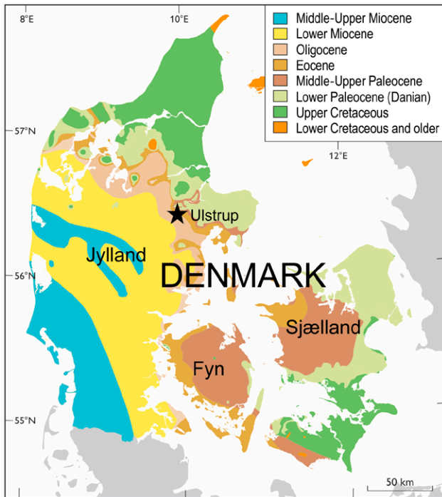
Fig. 1. Pre-Quaternary map of Denmark indicating the location of the clay-pit Sofienlund Lergrav in the Oligocene–Miocene deposits at the small town of Ulstrup (56° 23.4002'N, 09° 48.3961' E). Modified from Håkansson & Pedersen (1992).

prograding fluvio-deltaic systems were established south of the Fennoscandian Shield (Schjøler et al. 2007; Jarsve et al. 2014). These systems were restricted to a narrow rim around present-day Norway (Śliwińska et al. 2014). A branch of delta lobes that prograded deeper into the North Sea Basin are found south-west of present-day Norway (Jarsve et al. 2014). The eastern part of the North Sea Basin, however, remained fully marine, with a water depth at a minimum of 300 m and dominated by deposition of glaucony-rich mud. Late Oligocene – early Miocene inversion in the Central Graben and probably in the Norwegian-Danish